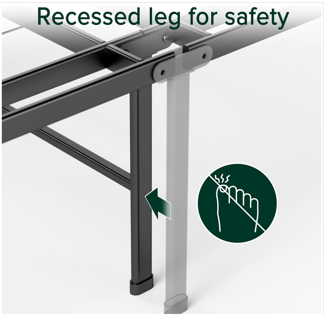
Image 3: Diagram highlighting the recessed leg design for enhanced safety.