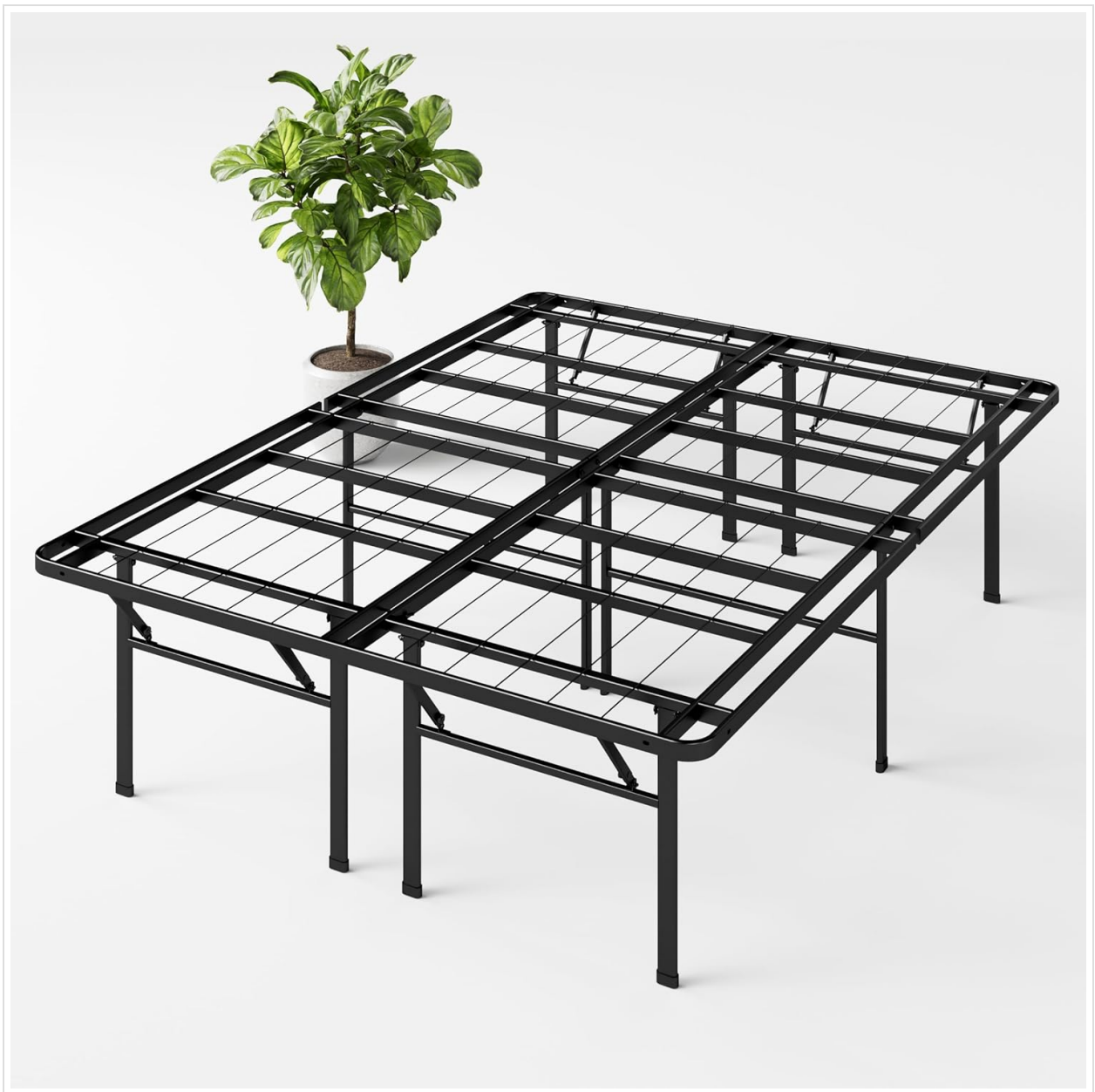
Image 1: The Zinus SmartBase Heavy Duty Mattress Foundation fully unfolded and ready for use.