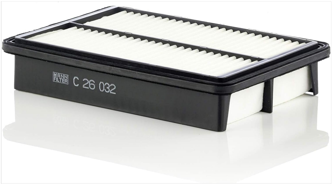
Image 1: The MANN-FILTER C 26 032 air filter. This image shows the overall appearance of the filter, highlighting its rectangular shape and pleated filter media within a black frame.