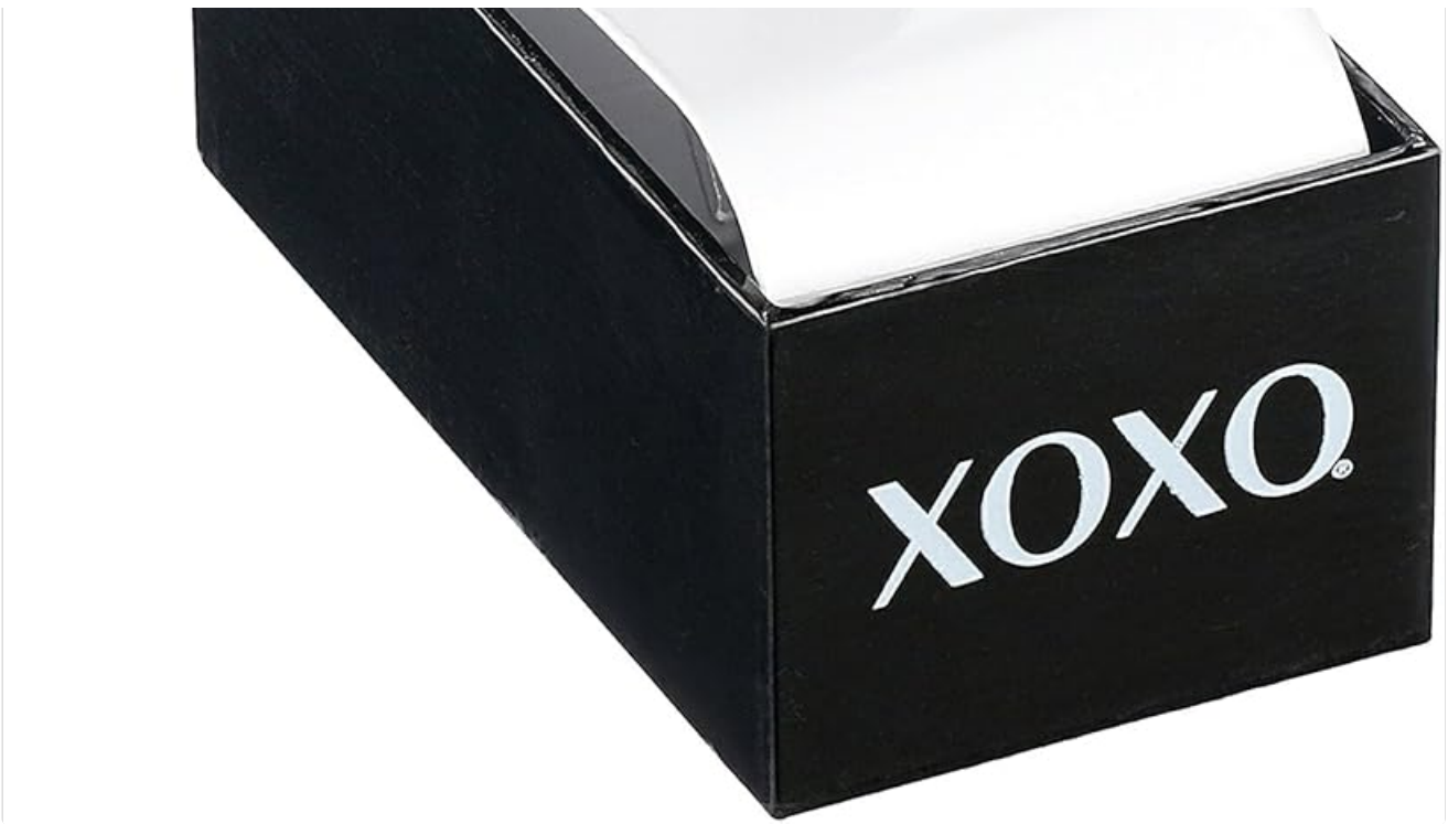
Figure 6.1: The ACCUTIME XOXO Women's XO5846 Gold Watch stored within its original black presentation box, ideal for protection and storage.