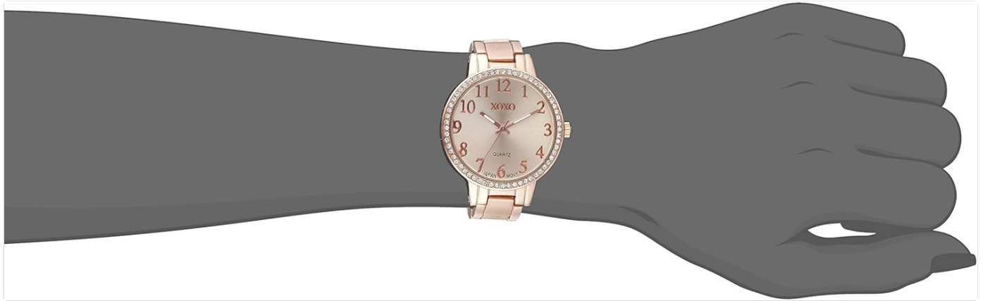
Figure 3.2: The ACCUTIME XOXO Women's XO5846 Gold Watch as worn on a wrist, demonstrating its size and appearance in use.