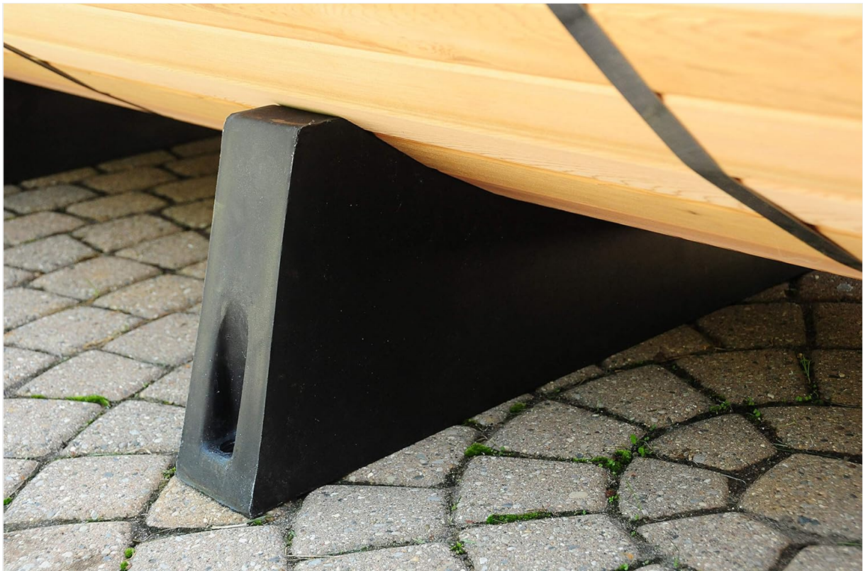
Image: Synthetic support cradles positioned beneath the sauna barrel, elevating it from the ground to prevent moisture contact.

Choose a level, stable surface for your sauna. The synthetic support cradles provide a moisture barrier, making it suitable for outdoor placement. Ensure adequate space around the sauna for access and maintenance.