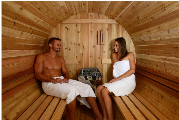
Image: A couple seated comfortably on the benches inside the sauna, illustrating its capacity for multiple users.