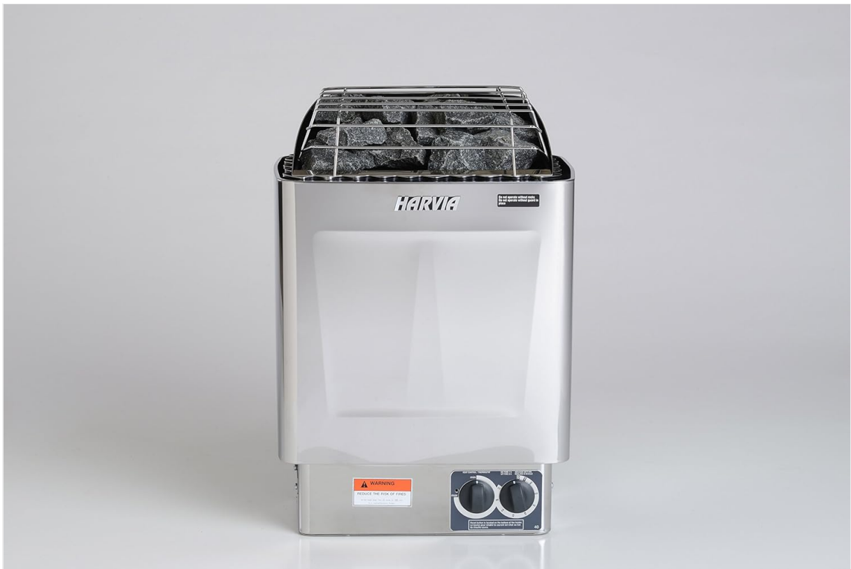
Image: The Harvia 6.0kw stainless steel heater, showing the rock basket on top and control knobs at the bottom for setting time and temperature.