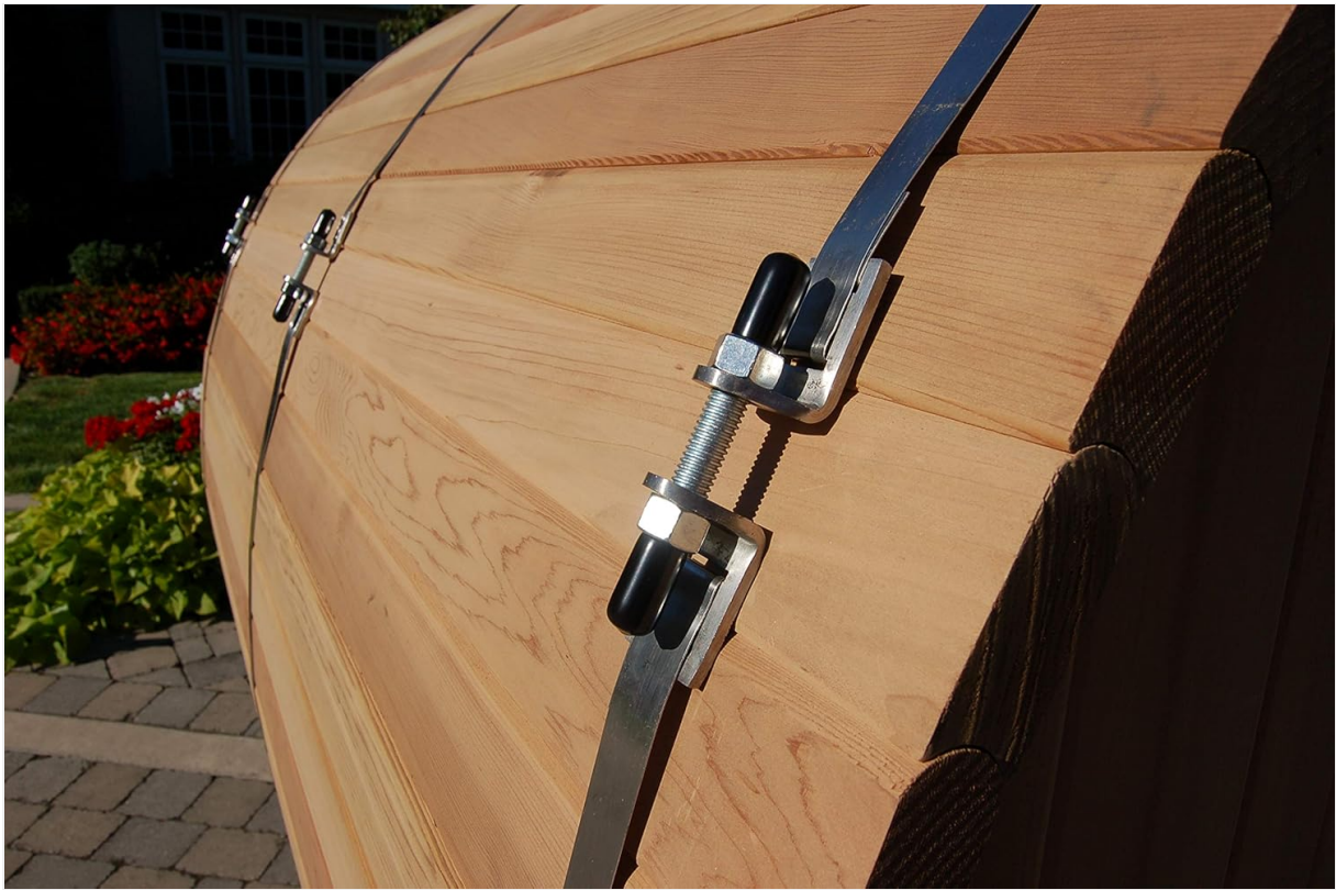
Image: Close-up of the stainless steel bands and hardware that secure the cedar staves, forming the barrel shape of the sauna.