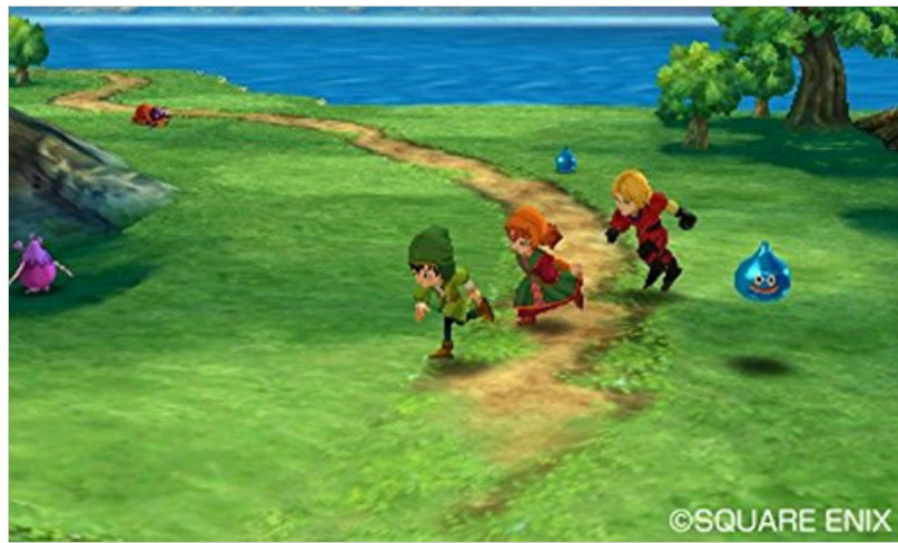
Image: Three party members, including the main protagonist, run along a dirt path through a vibrant green field. Small, colorful monsters are visible in the distance, indicating an explorable overworld.