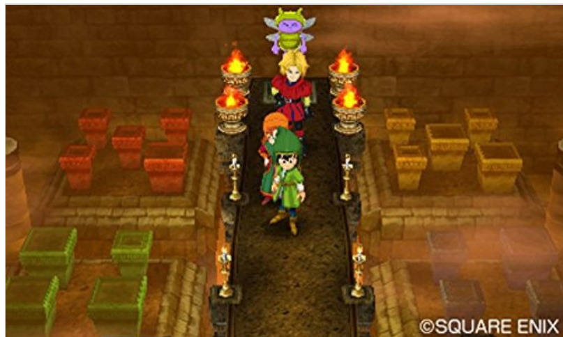
Image: The player's party stands in a dimly lit dungeon corridor, adorned with torches and ancient architecture. This scene suggests exploration within a dangerous area where combat encounters are frequent.

Combat in Dragon Quest VII is turn-based. When you encounter enemies, the game transitions to a battle screen. You will issue commands to each party member, choosing actions such as Attack, Spell, Skill, Item, or Defend. Pay attention to enemy weaknesses and your party's strengths.