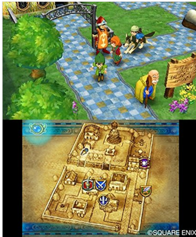
Image: Characters are seen walking through a town square with a bridge, while the bottom screen displays a detailed map of the town, highlighting various buildings and pathways.