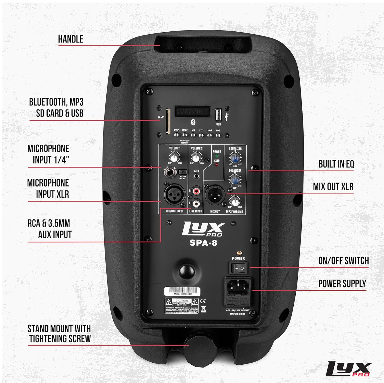
Figure 3: Detailed view of the LyxPro SPA-8 rear panel, highlighting the various inputs, outputs, and control knobs for audio management.