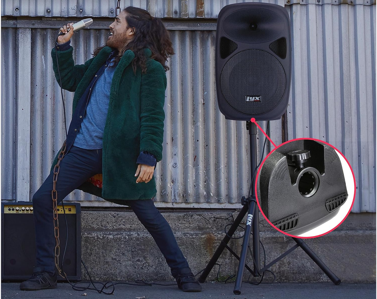
Figure 2: The LyxPro SPA-8 speaker securely mounted on a speaker stand, demonstrating its compatibility with standard mounts.