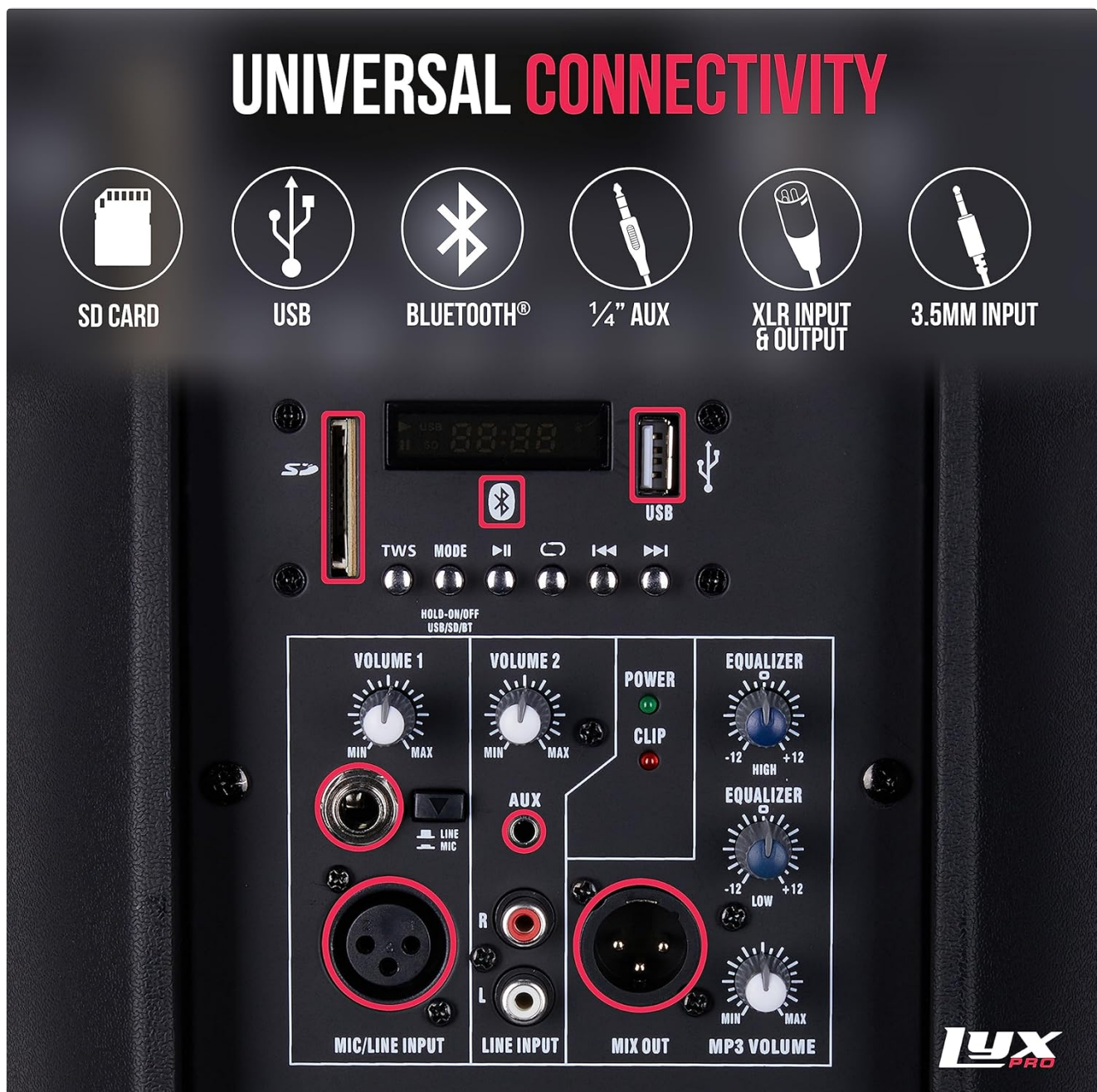
Figure 4: An illustration detailing the universal connectivity options of the LyxPro SPA-8, including SD card, USB, Bluetooth, 1/4" AUX, XLR, and 3.5mm inputs.