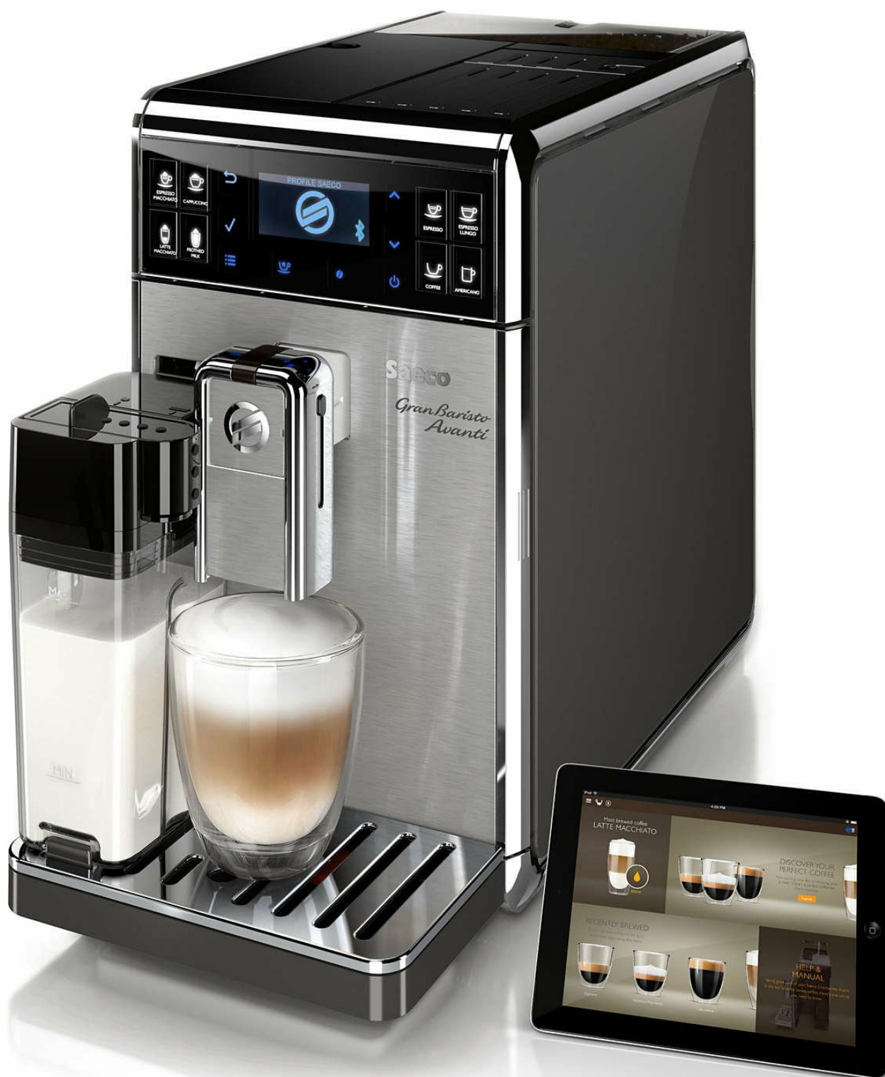
The Saeco GranBaristo Avanti machine, showcasing its ability to prepare various coffee beverages and its connectivity features via a tablet.