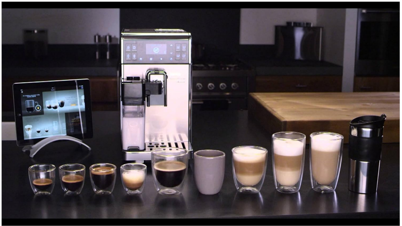
The machine's control panel with touch-sensitive icons for Espresso Macchiato, Cappuccino, Espresso, Espresso Lungo, Latte Macchiato, Frothed Milk, Coffee, and Americano.