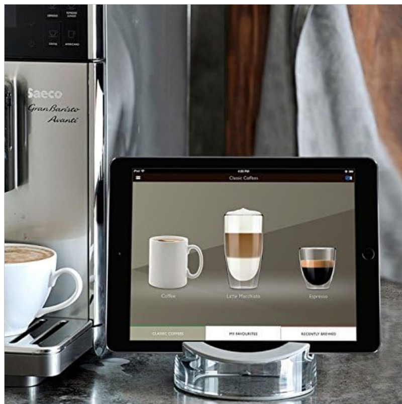
The Saeco Avanti app on a tablet, offering a selection of classic coffee beverages, positioned beside the espresso machine.