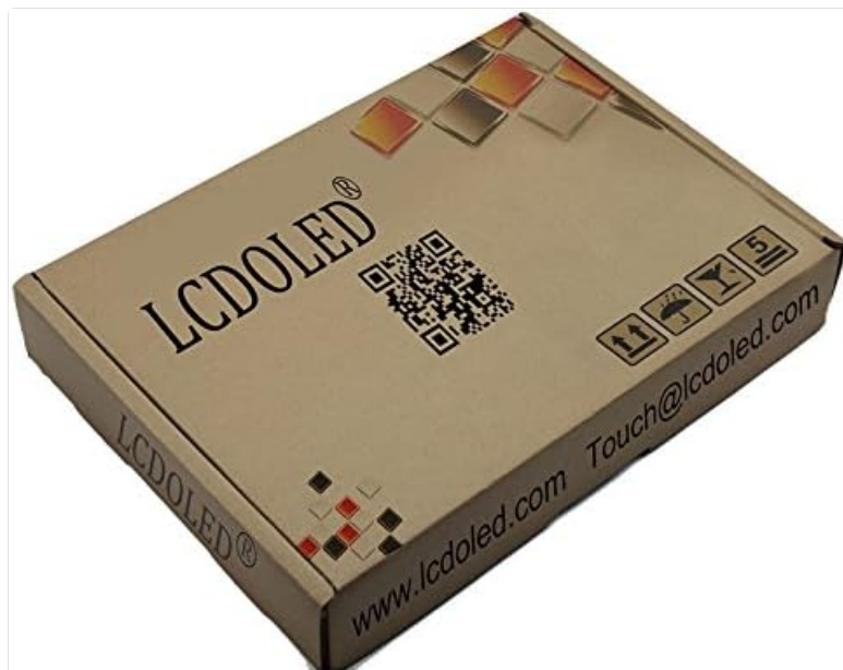
Image: The LCDOLED product box displaying the brand logo and official website for support.

LCDOLED is committed to providing professional and considerate customer service. Any inquiries or questions will be answered within 24 hours. Any dissatisfaction or problem will be addressed promptly with a satisfactory solution.