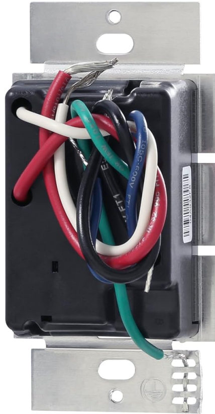
Figure 2: Rear view of the Lutron Caseta Smart Light Switch, illustrating the various wires (red, black, white, green) for connection during installation.