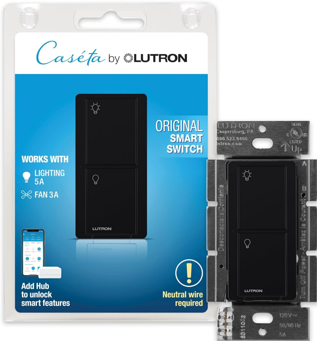
Figure 1: Lutron Caseta Smart Light Switch (PD-6ANS-BL) in its packaging and as a standalone unit, highlighting its design and the requirement for a neutral wire.