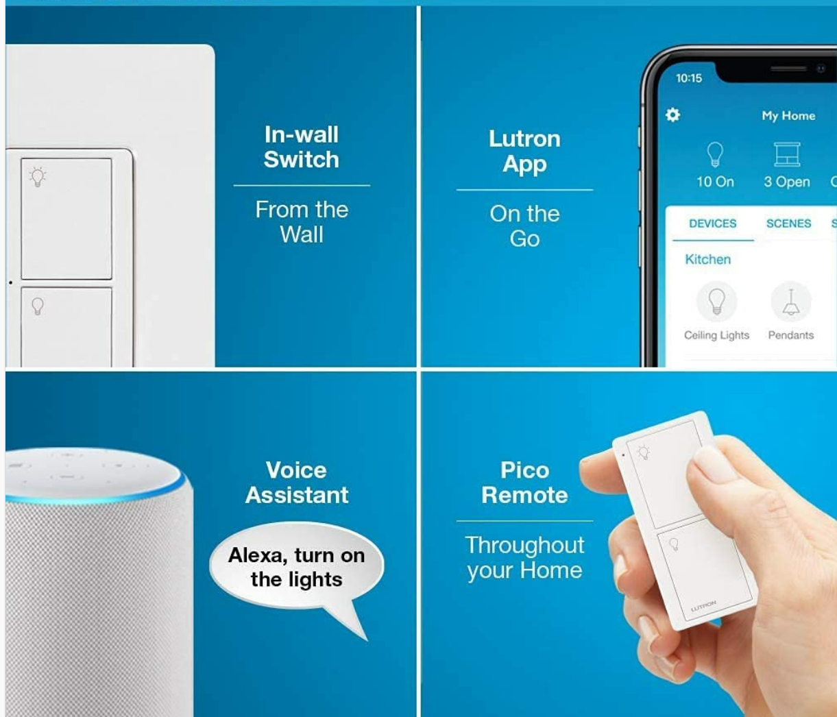
Figure 4: Visual representation of the four primary control methods for Caseta smart lighting: directly from the in-wall switch, via the Lutron app on a mobile device, using a voice assistant like Alexa, and with a portable Pico remote.