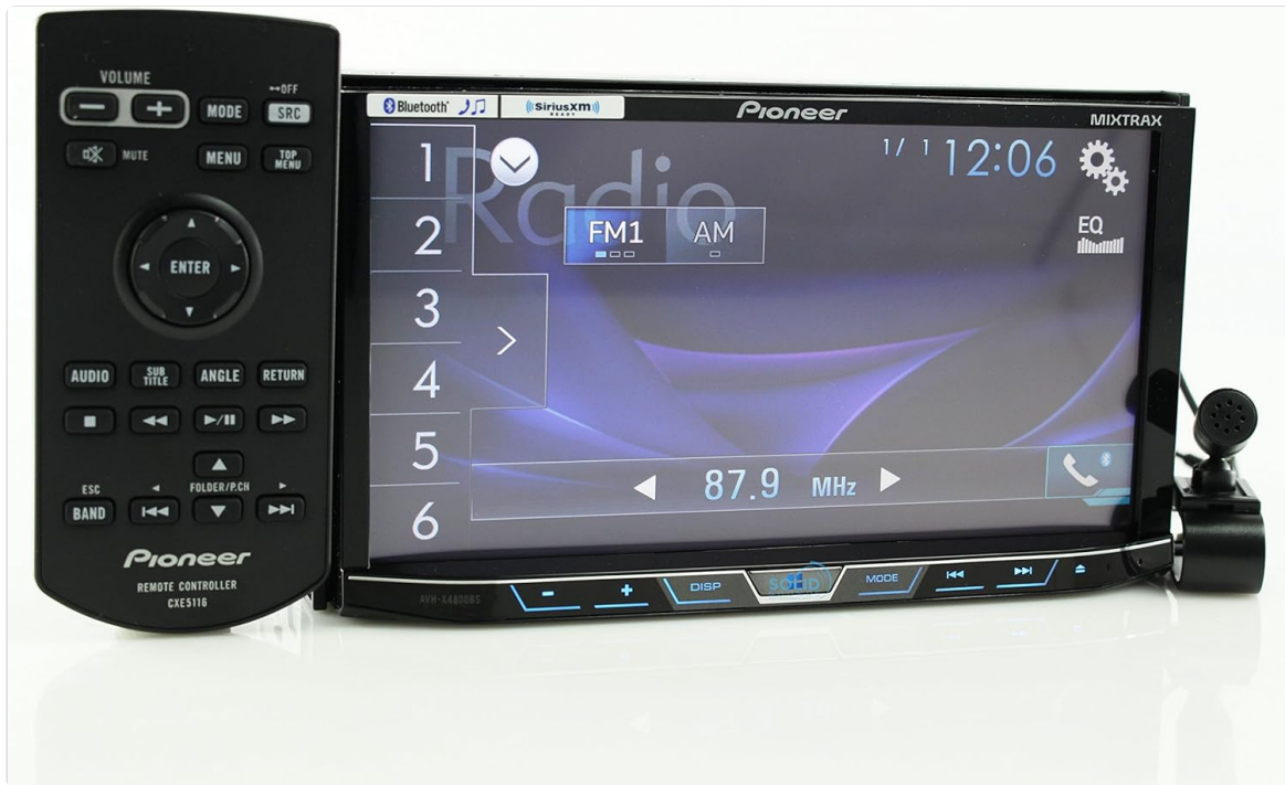
Figure 2.2: Close-up of the 7-inch motorized display showing the main interface.