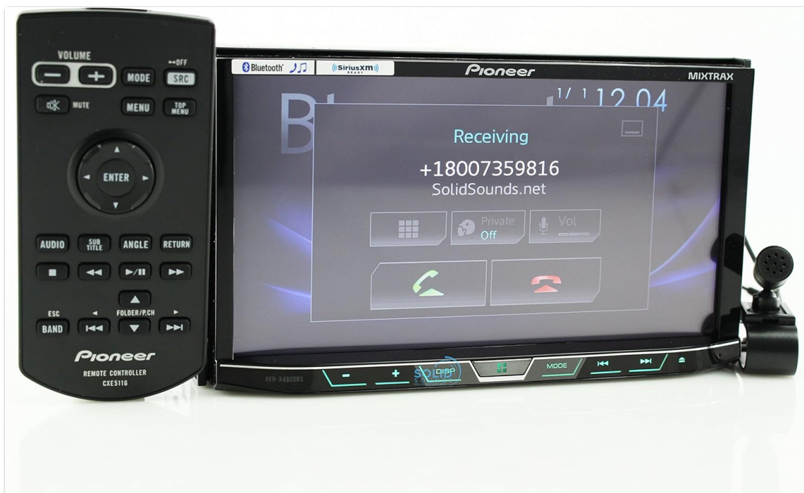
Figure 6.1: Display showing an incoming Bluetooth call.

Pair your smartphone via Bluetooth for hands-free calling and wireless audio streaming. The included microphone ensures clear voice transmission during calls.