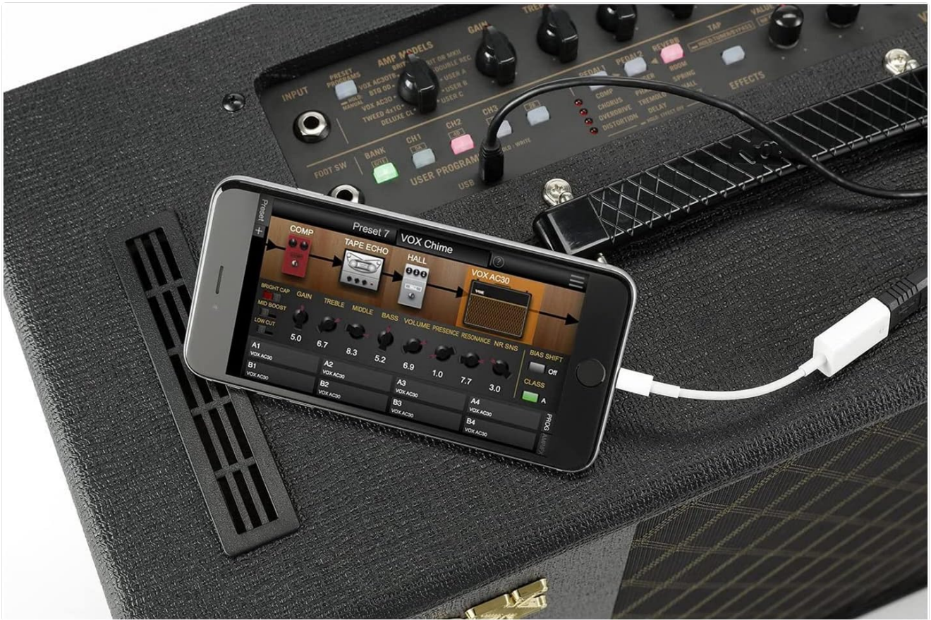
Image: A VOX VT20X amplifier with a smartphone connected via USB, displaying the Tone Room application interface for editing amplifier settings and effects.