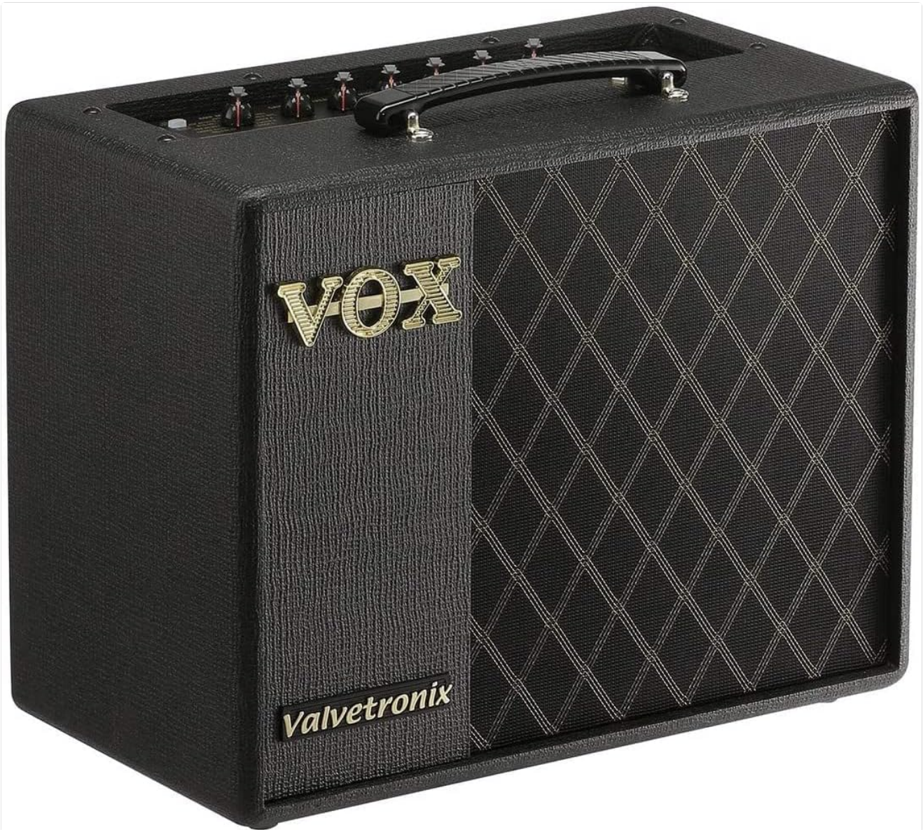
Image: Front view of the VOX VT20X Modeling Guitar Combo Amplifier, showcasing its black textured finish and classic diamond-patterned grille cloth with the VOX logo.