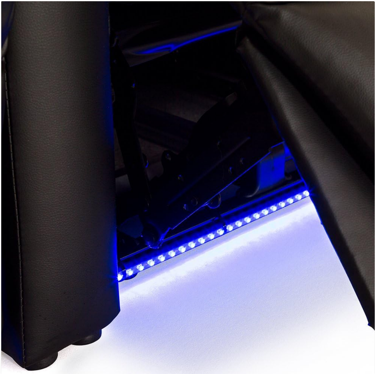
Figure 4: Ambient Base Lighting. This image shows the blue LED strip lighting along the bottom of the seating, creating a soft glow.