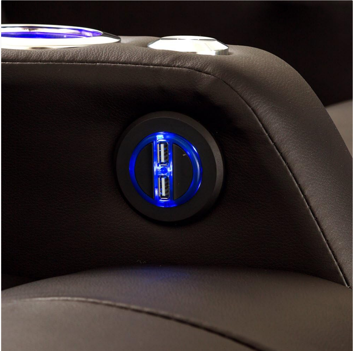
Figure 2: USB Charging Port. This image shows the illuminated USB charging port, allowing users to conveniently power their devices while seated.