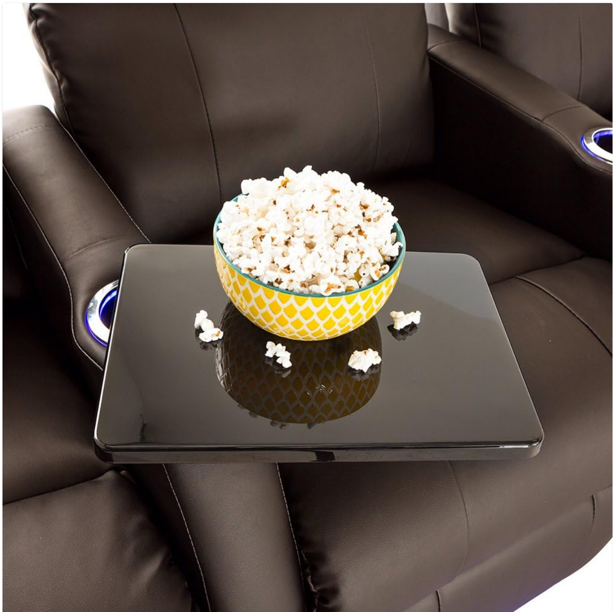
Figure 5: Removable Tray Table. This image demonstrates a tray table in use, providing a stable surface for items like snacks or a remote control.