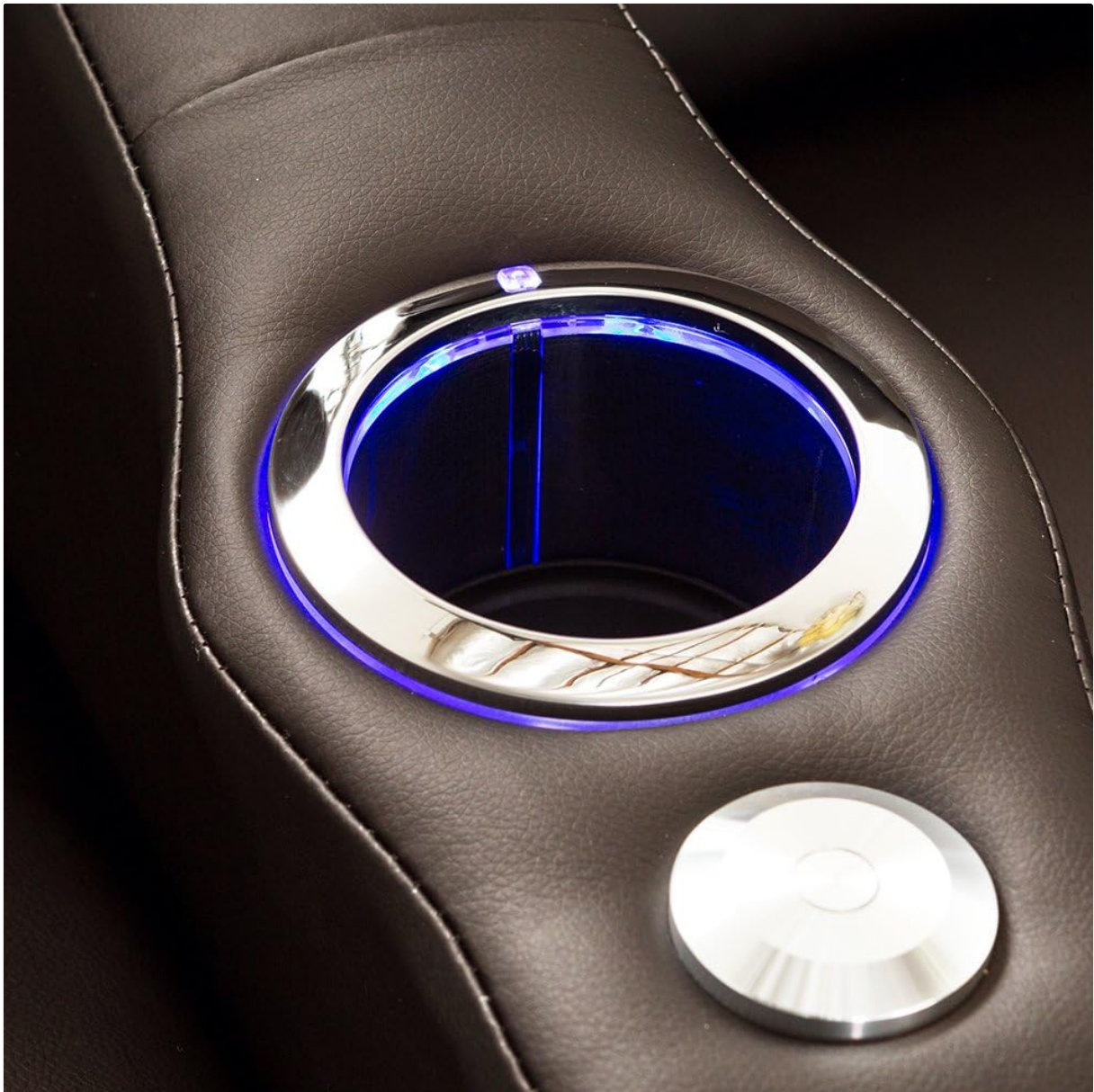
Figure 3: Illuminated Cupholder. This image highlights the blue LED lighting within the cupholder, providing subtle illumination.