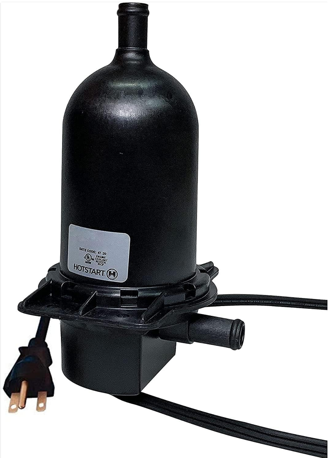
Figure 5: Angled view of the preheater, clearly showing the inlet and outlet ports for coolant circulation.