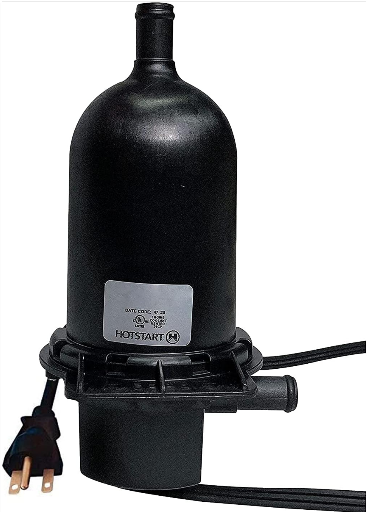
Figure 1: Front view of the HOTSTART TPS202GT10-000 Coolant Preheater. This image shows the main body of the preheater, the power cord with a NEMA 6-15 plug, and the inlet/outlet ports.