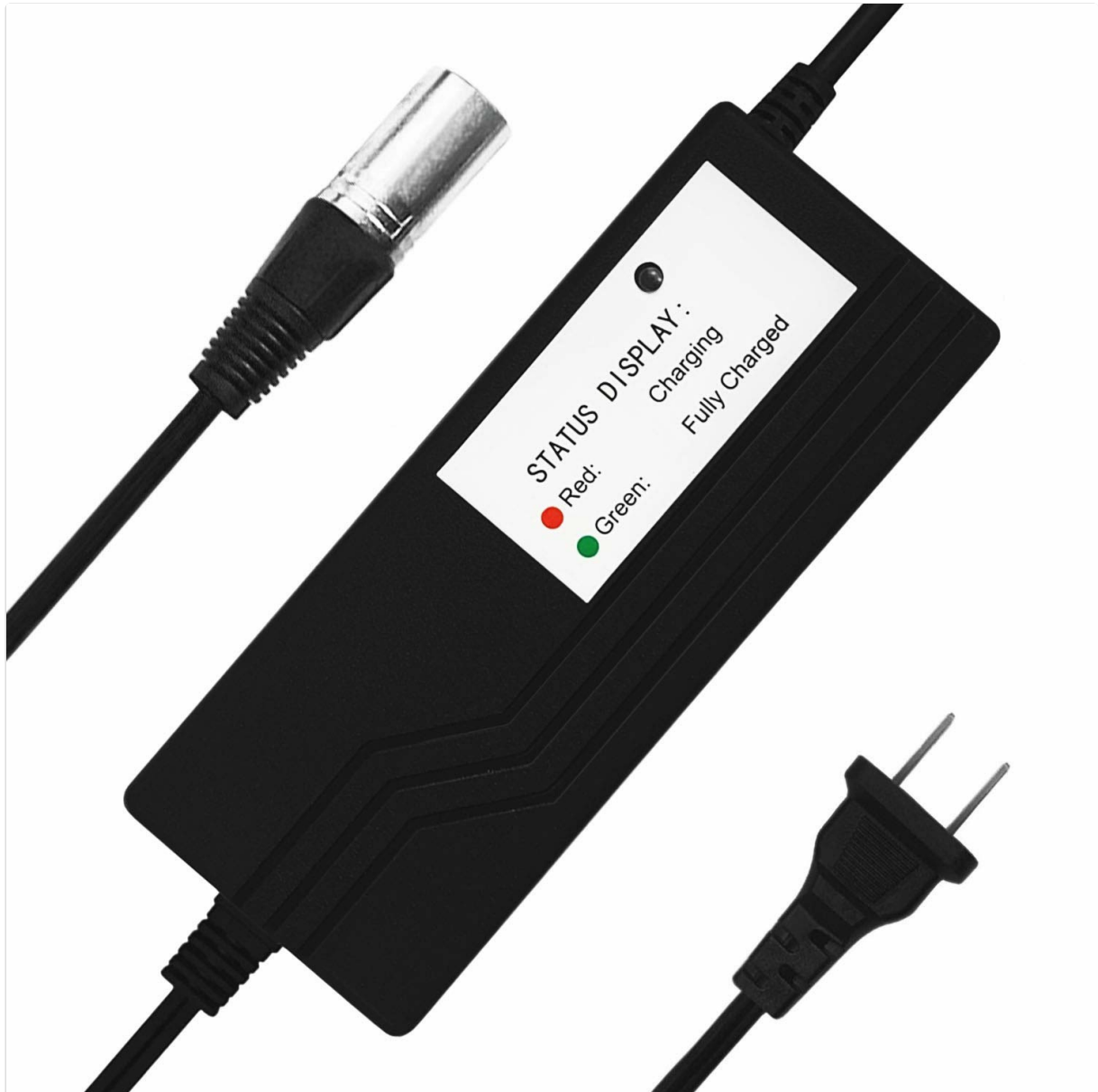
Image: Close-up of the Mighty Max Battery charger's status display, clearly indicating the meaning of the red (charging) and green (fully charged) LED lights.