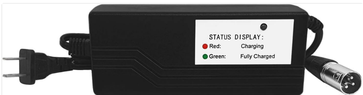
Image: The Mighty Max Battery 24V 3Amp charger showing its main components: the charger unit, the AC power cord, and the 3-pin XLR output connector.