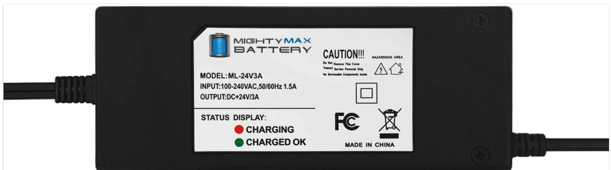
Image: The product label on the charger, displaying the model number ML-24V3A, input voltage (100-240VAC, 50/60Hz 1.5A), and output (DC+24V/3A), along with various safety warnings and certifications.