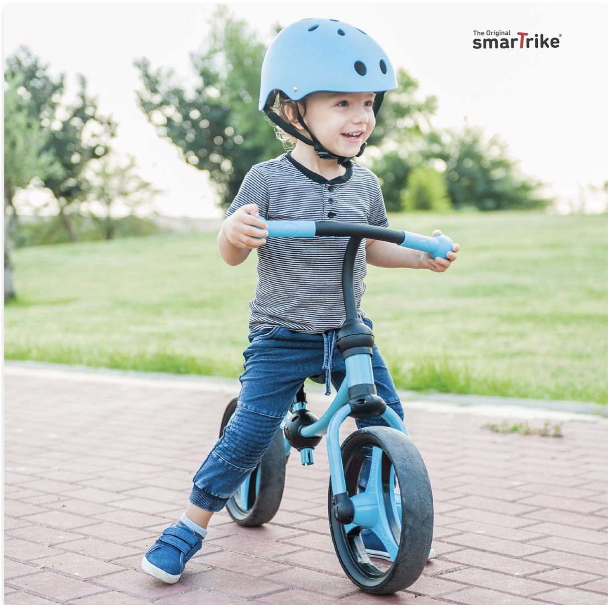
Image: A child confidently riding the blue smarTrike Balance Bike outdoors, demonstrating proper use and the importance of a helmet.

Encourage your child to walk or run while seated on the bike, using their feet to propel themselves forward. As they gain momentum, they will naturally lift their feet and glide, developing their balance. Always supervise your child during use and ensure they wear appropriate safety gear, including a helmet.