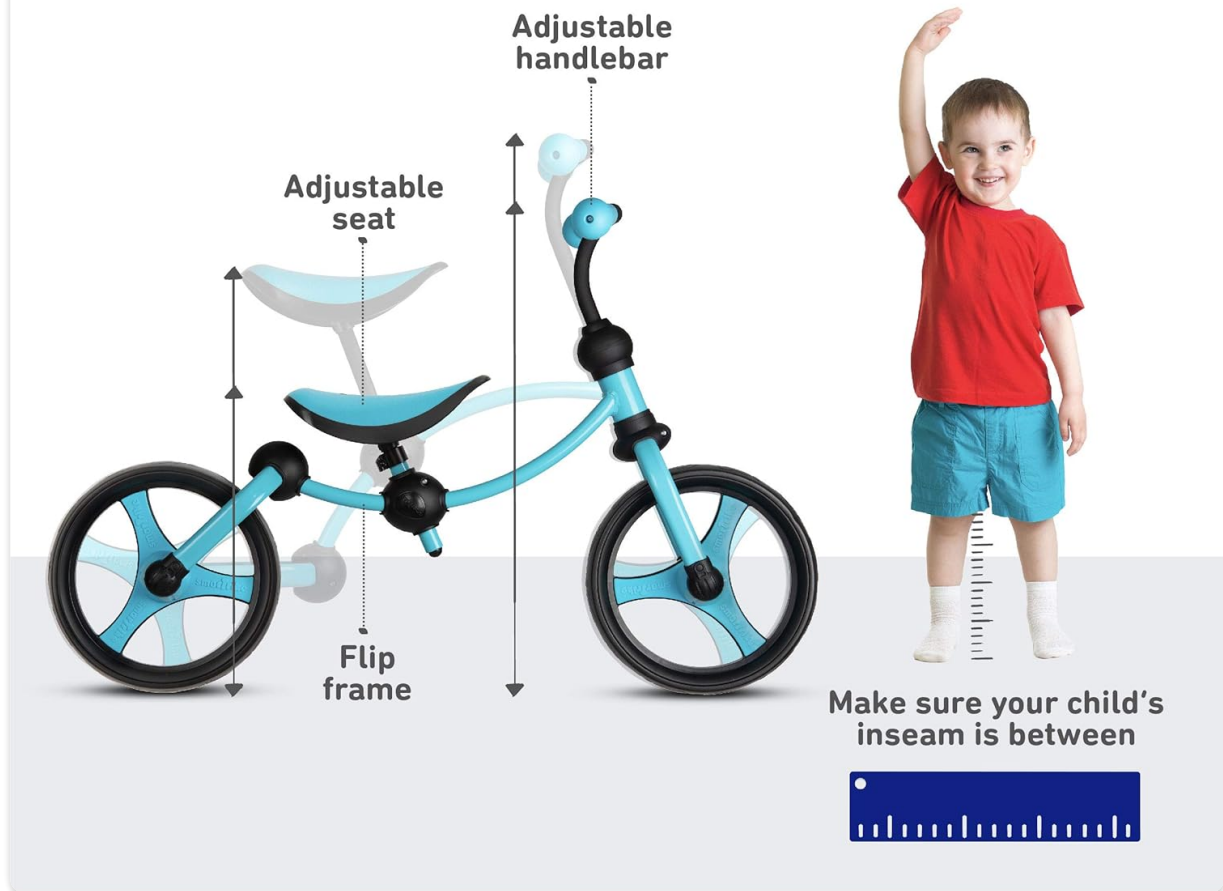
Image: The smarTrike Balance Bike in blue, highlighting its adjustable features and the recommended inseam measurement for a child.