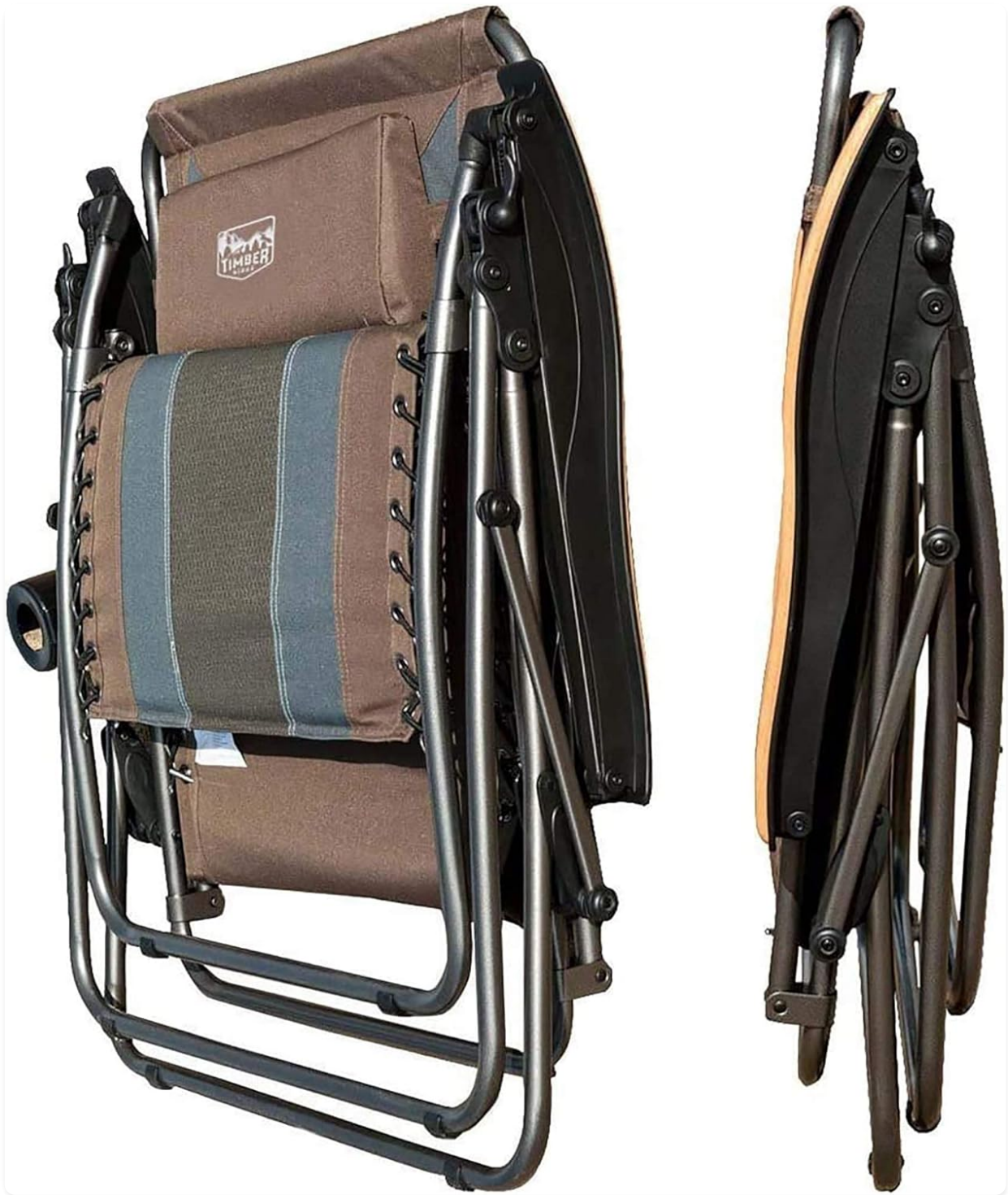
Image: The chair is displayed both folded for compact storage and fully extended, illustrating the ease of unfolding for use.