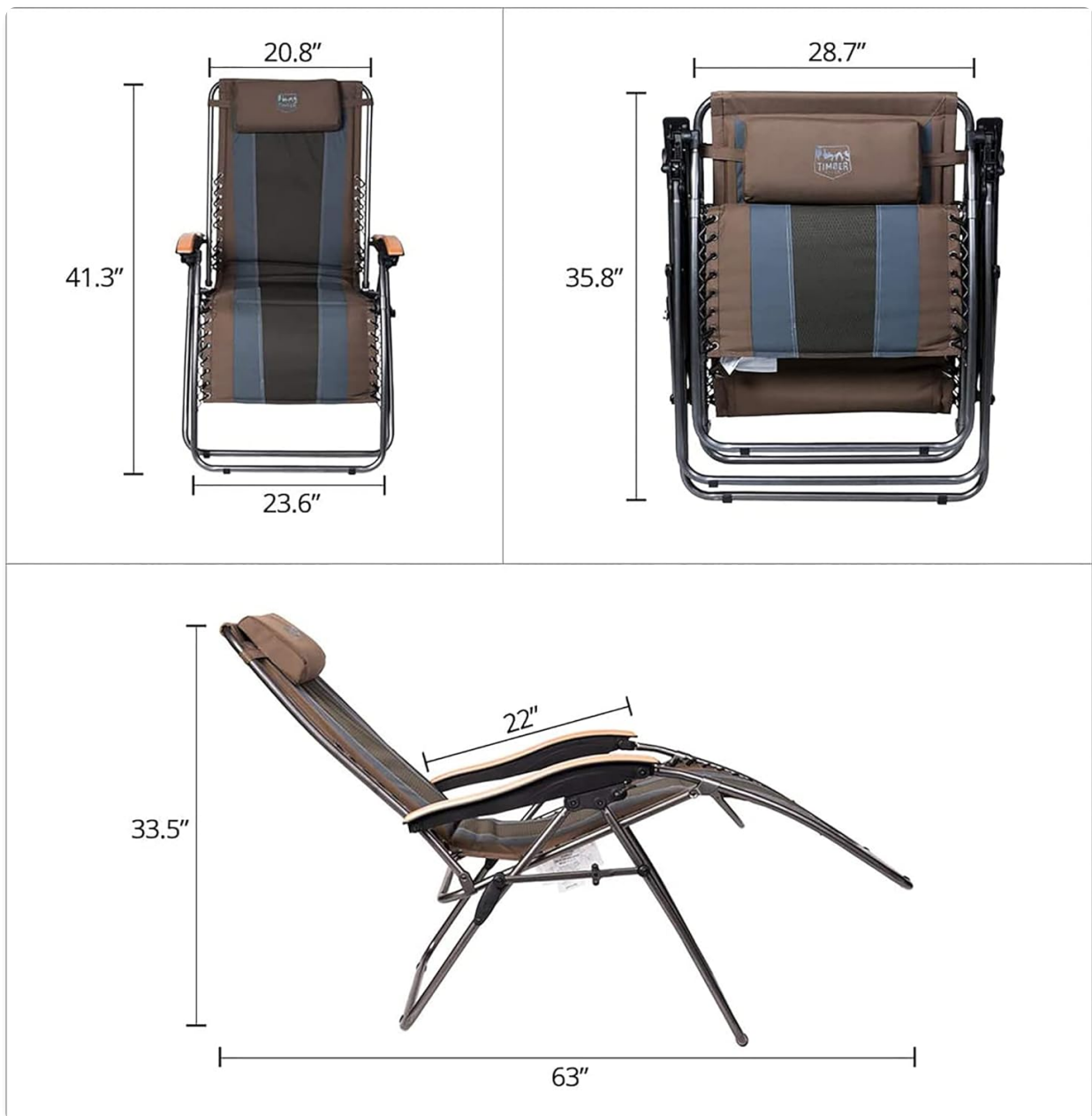
Image: Technical drawing showing the key dimensions of the chair, including width, height, and reclined length, to help users understand its size.