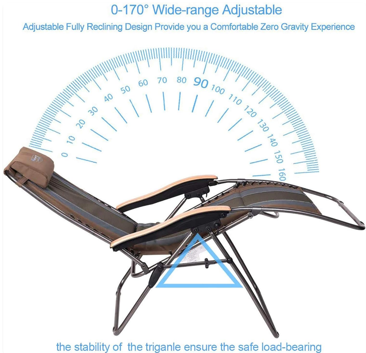
Image: A visual representation of the chair's adjustable reclining range, from 0 to 170 degrees, emphasizing the stability provided by its triangular frame design.