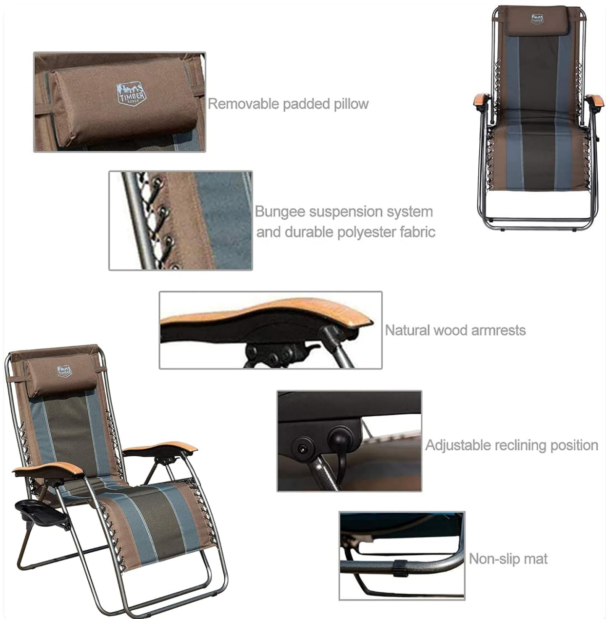
Image: Detailed view of the chair's key features: the removable padded pillow, the durable bungee suspension system, natural wood armrests, the adjustable reclining mechanism, and a non-slip mat on the feet.