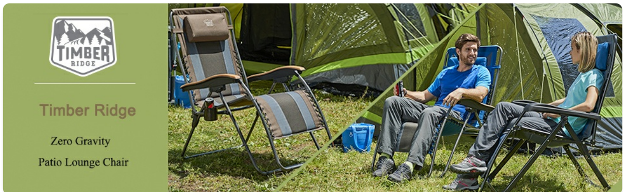
Image: Two individuals enjoying the comfort of Timber Ridge Zero Gravity Chairs in a serene outdoor environment, highlighting the chair's suitability for relaxation.

Thank you for choosing the Timber Ridge Zero Gravity Chair. This oversized recliner is designed for ultimate comfort and durability, perfect for outdoor relaxation. Please read this manual carefully to ensure proper setup, operation, and maintenance of your chair.