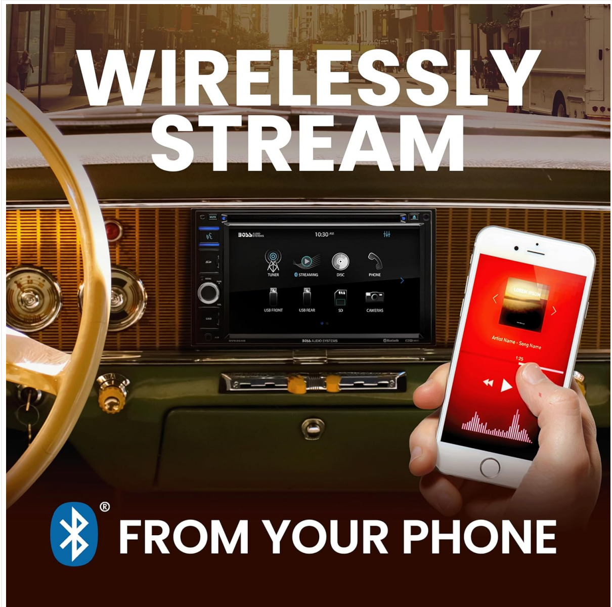
Image 4.1: Wireless audio streaming from a smartphone via Bluetooth.