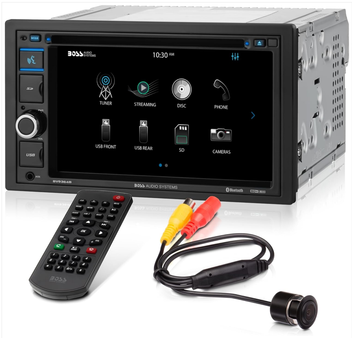
Image 1.1: The BVB9364RC car stereo unit, wireless remote control, and included backup camera.