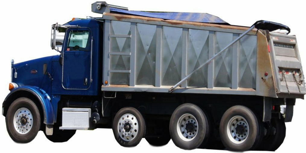
Figure 1: XTARPS 6.5' x 12' Dump Truck Mesh Tarp. This image shows the black mesh tarp, designed for dump truck manual tarp systems.