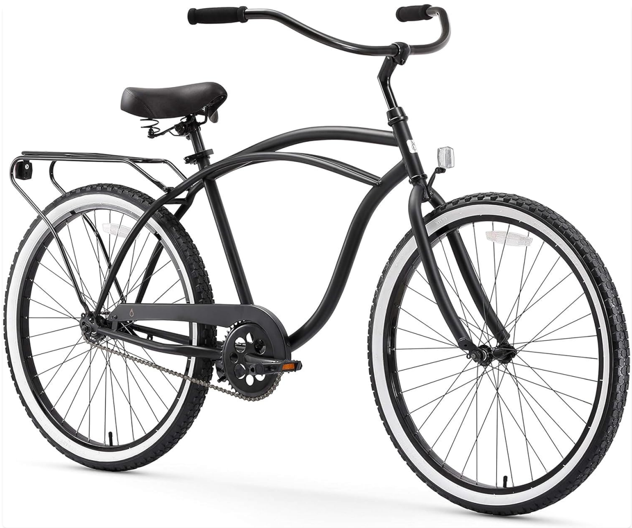
Image: The sixthreezero Around The Block Men's Beach Cruiser Bike, matte black with white wall tires.