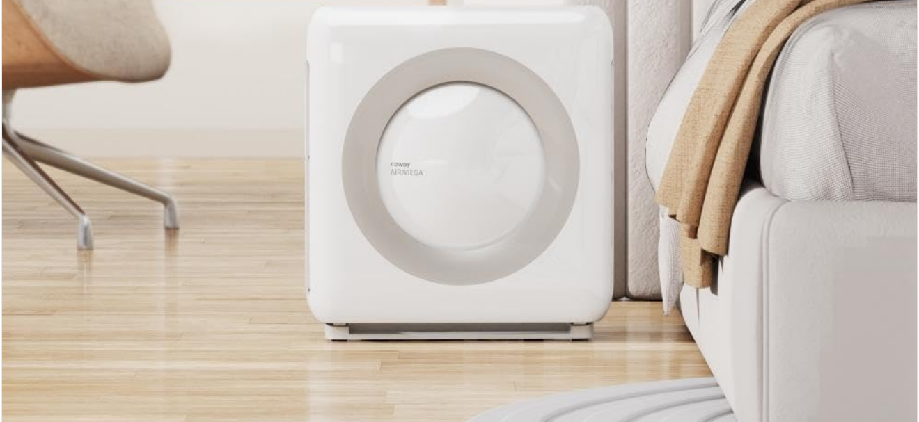
Figure 1.1: Overview of the Coway Airmega AP-1512HH(W) and its primary features.