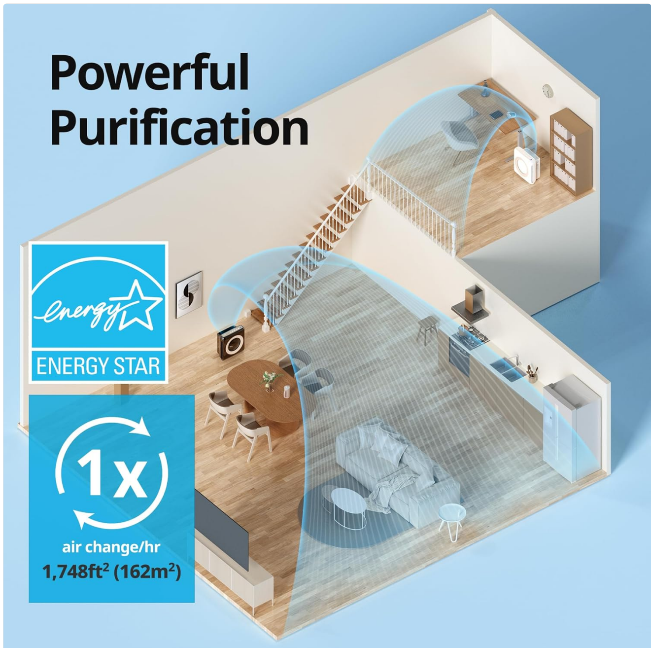
Figure 1.2: Illustration of the air purifier's powerful purification and air circulation within a living space.