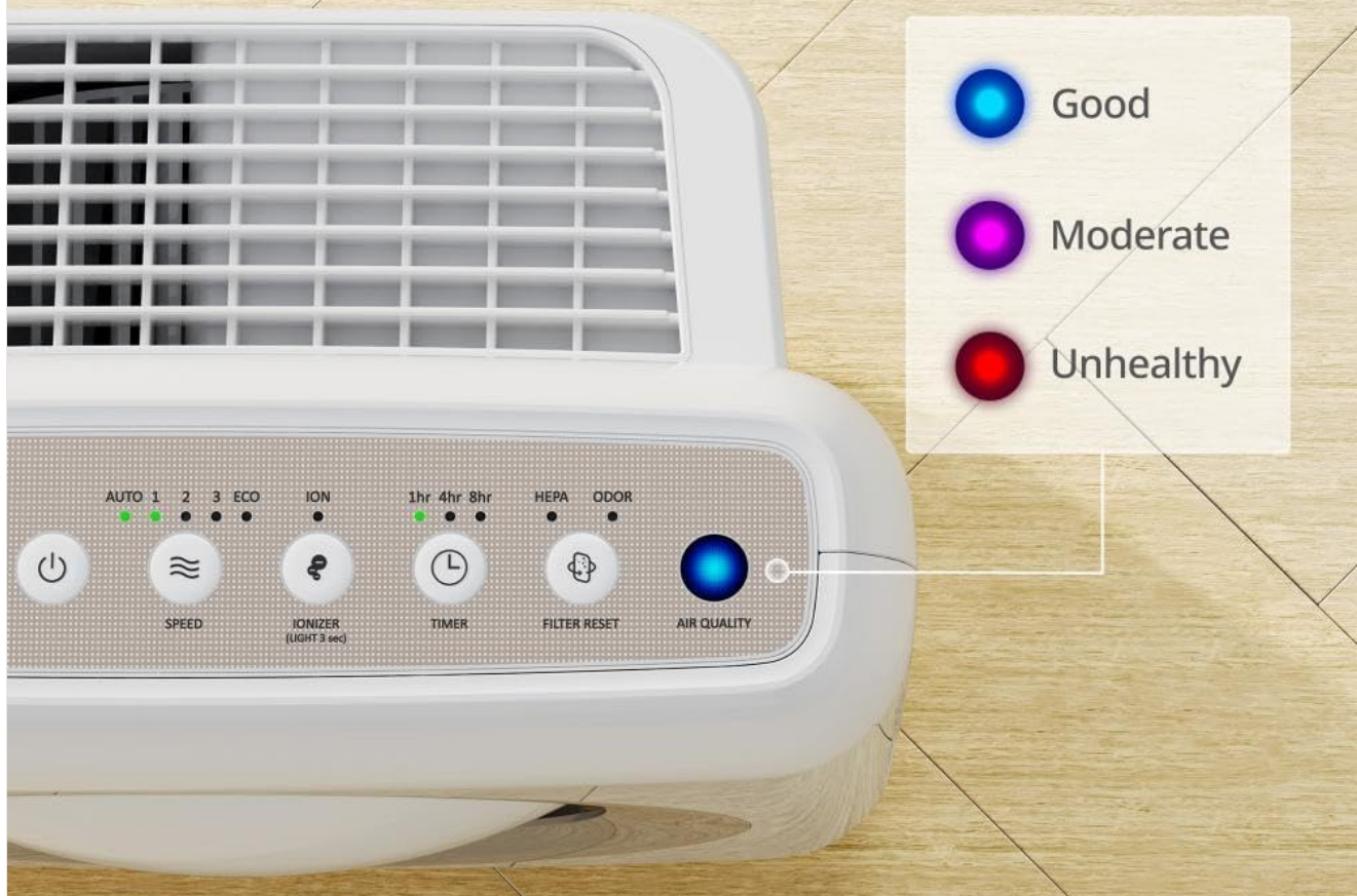
Figure 3.3: Real-time air quality monitoring indicated by the LED color.

The pollution monitor indicates air quality and adjusts purification to the necessary level