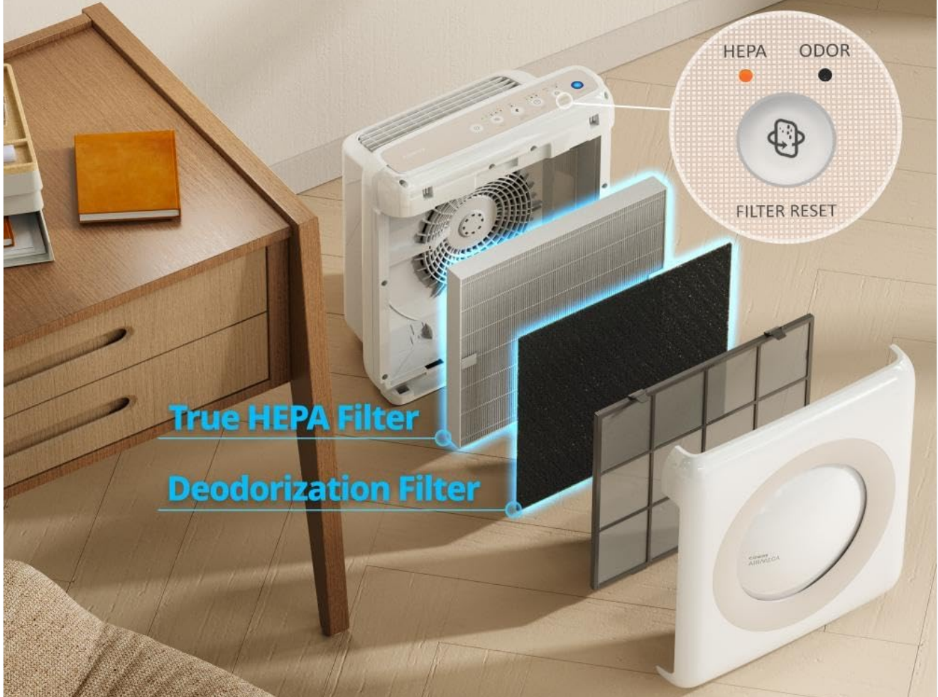
Figure 4.1: Filter replacement indicator lights for HEPA and Odor filters.

It tells you when the True HEPA Filter and Deodorization Filter need to be replaced