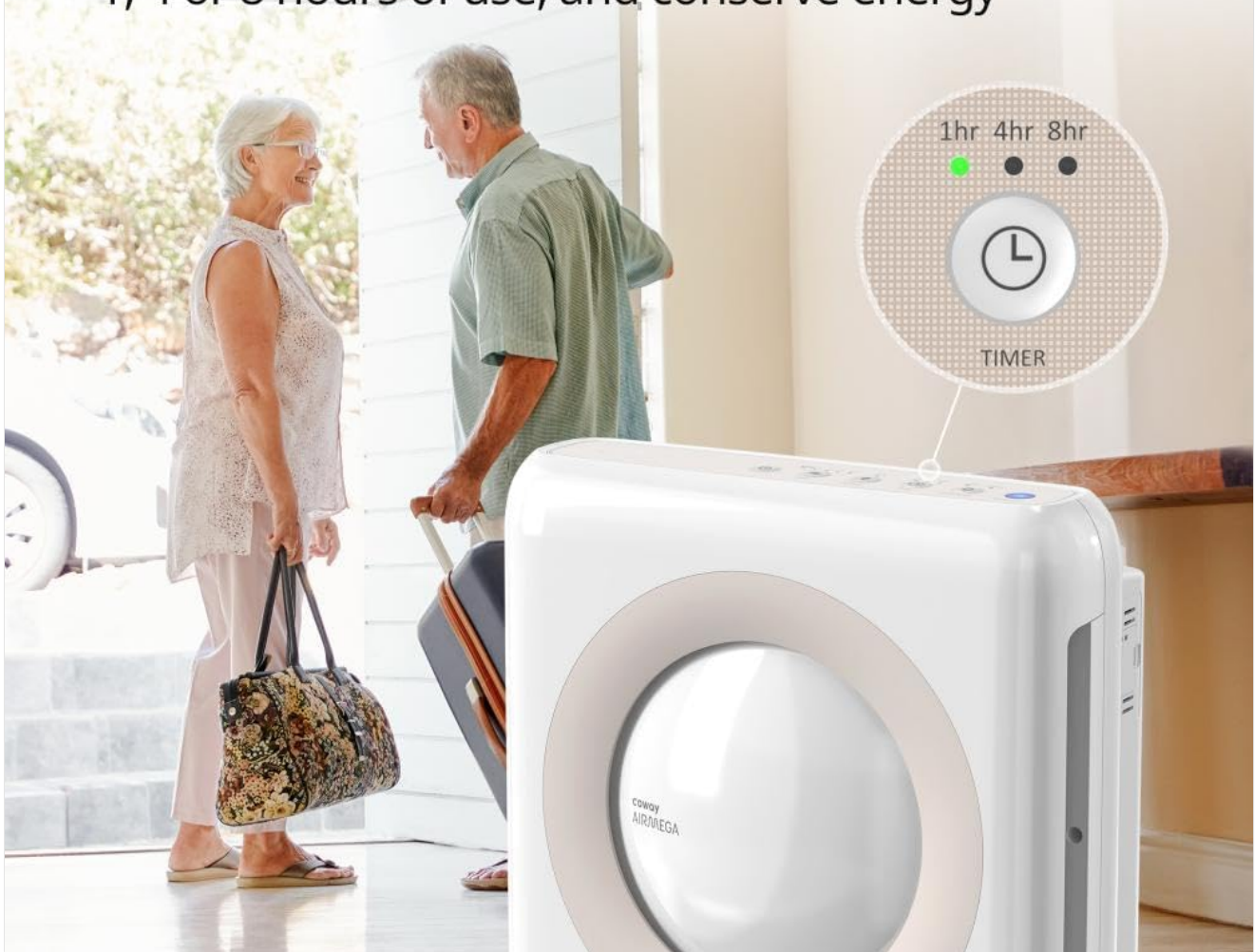
Figure 3.2: Setting the timer for 1, 4, or 8 hours of operation.

Schedule the unit to purify 1, 4 or 8 hours of use, and conserve energy