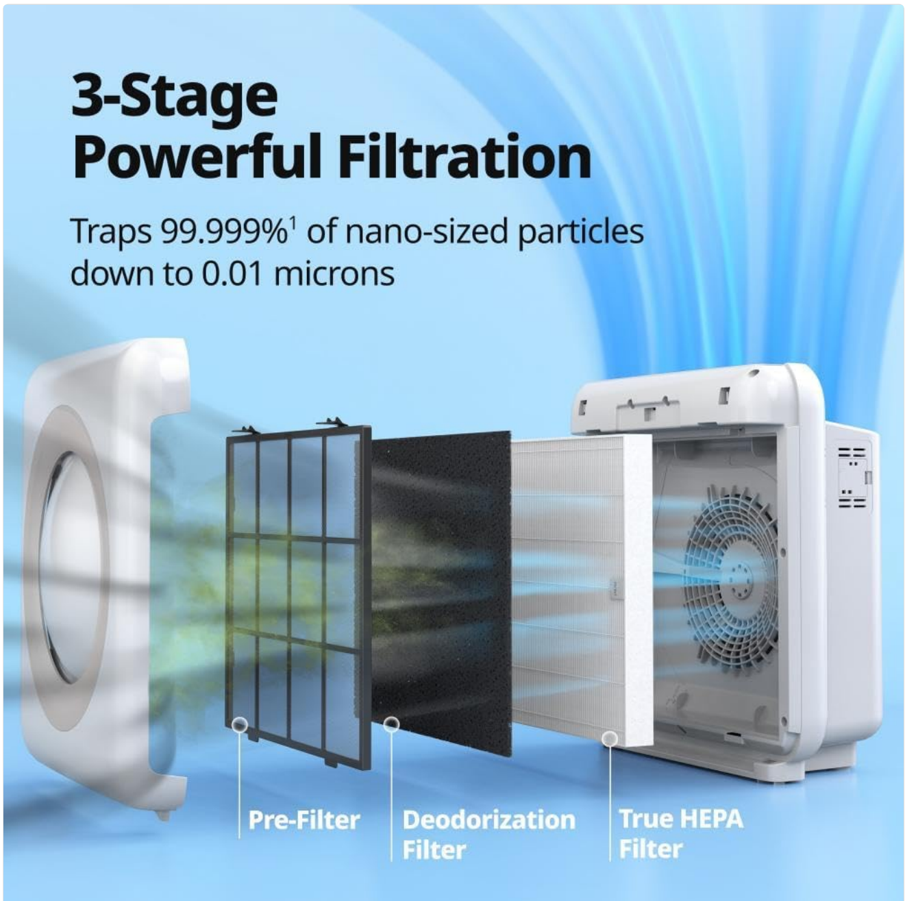
Figure 2.1: The 3-stage filtration system, showing the Pre-Filter, Deodorization Filter, and True HEPA Filter.

6. Connect Power: Plug the power cord into a standard electrical outlet.