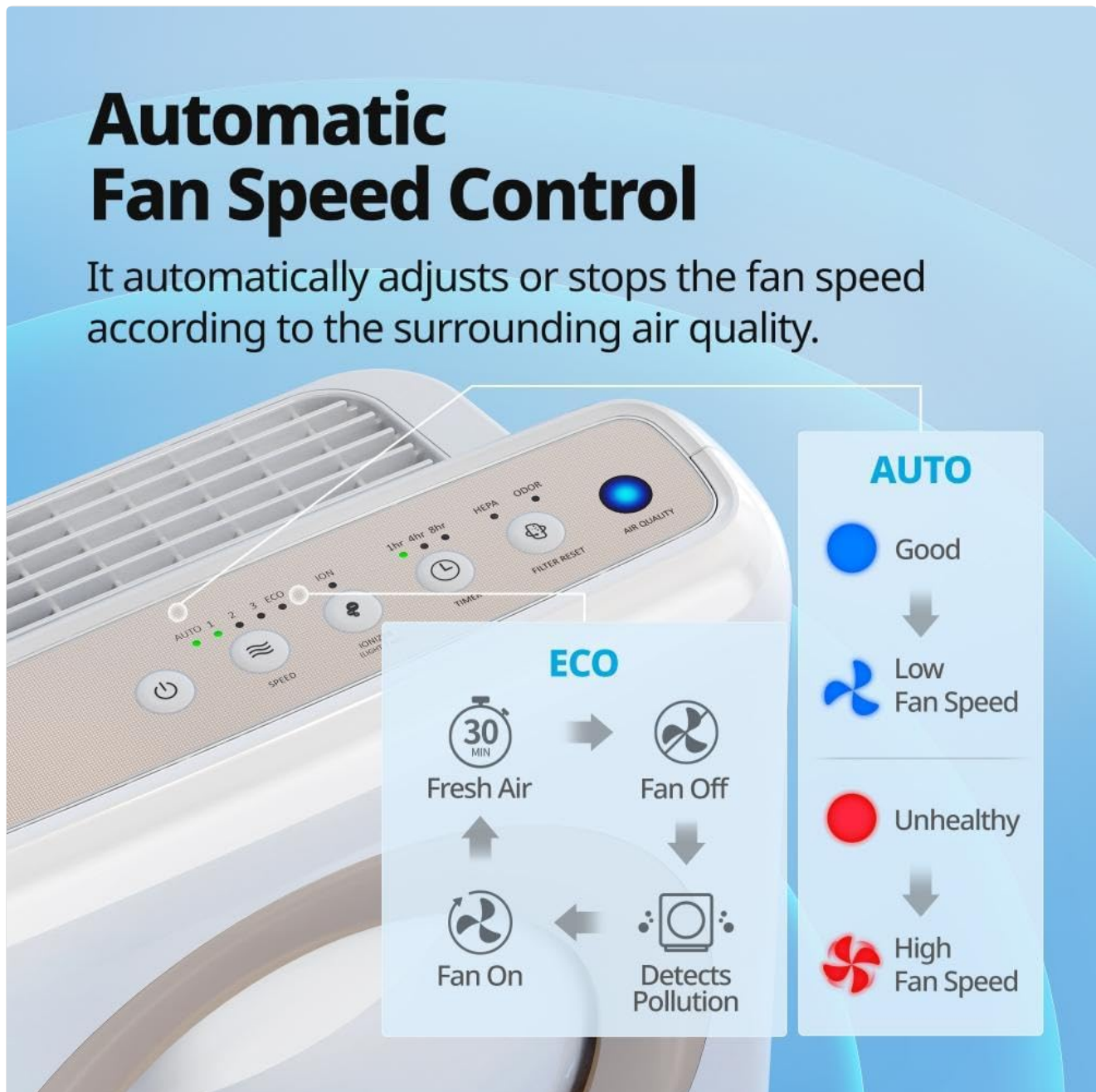
Figure 3.1: Automatic fan speed adjustment and Eco Mode operation based on detected air quality.

Press the Auto button (🌀) to activate Auto Mode. In this mode, the air purifier automatically adjusts the fan speed based on the real-time air quality detected by its pollution sensor.