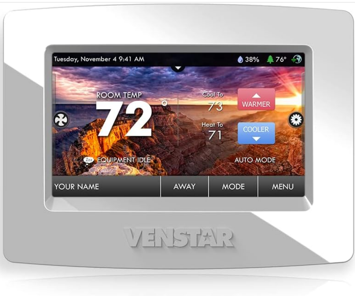
Figure 1: Main display of the Venstar ColorTouch T8800 thermostat. It shows the current room temperature (72°), target cool temperature (73°), target heat temperature (71°), and system status (Equipment Idle). Buttons for "Warmer" and "Cooler" adjust set points. Navigation options include "Your Name," "Away," "Mode," and "Menu." The top bar displays date, time, humidity (38%), and outdoor temperature (76°).