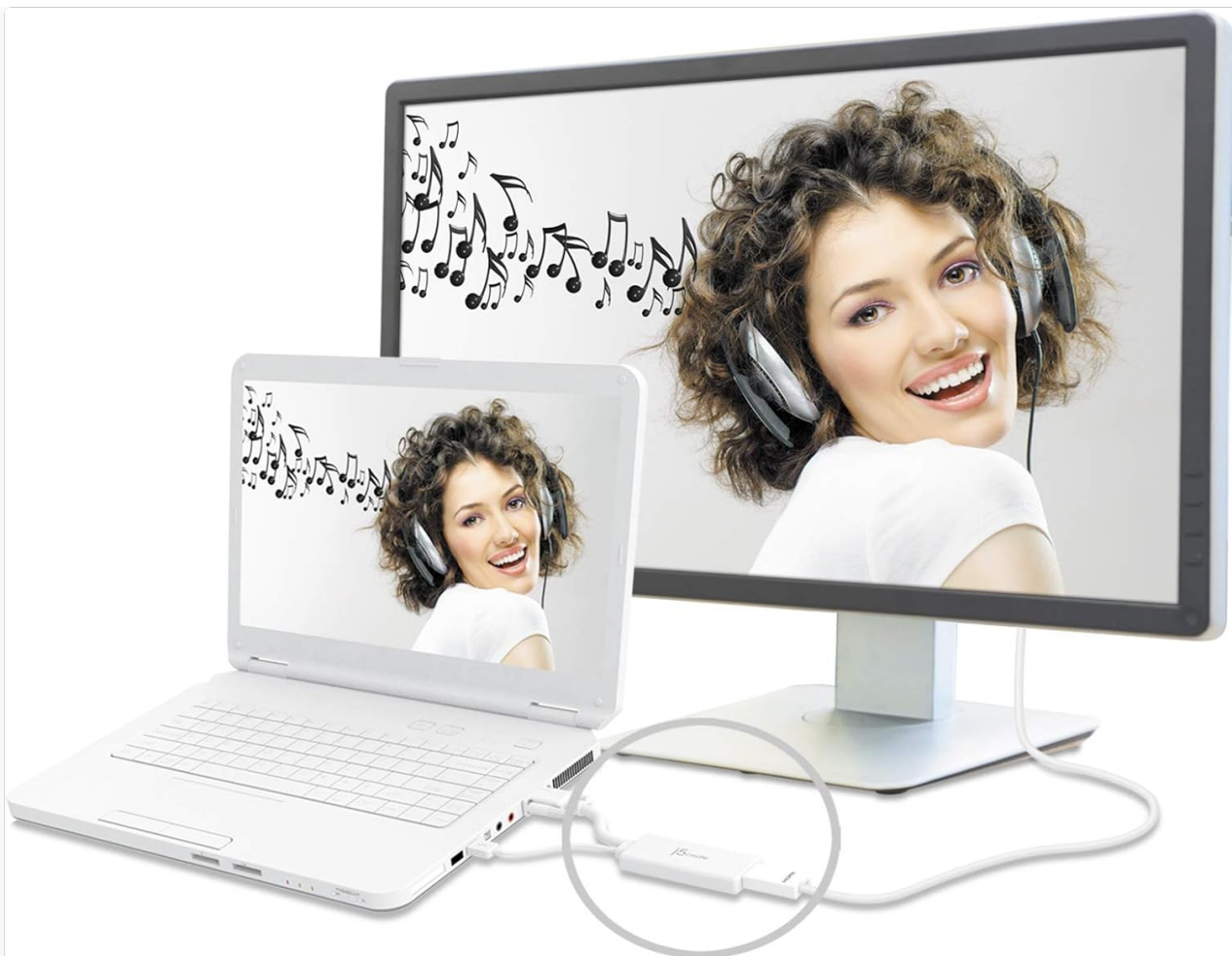
Figure 3.2: Example setup showing a laptop extending its display to an external monitor using the j5create JDA214 adapter.

Your browser does not support the video tag.