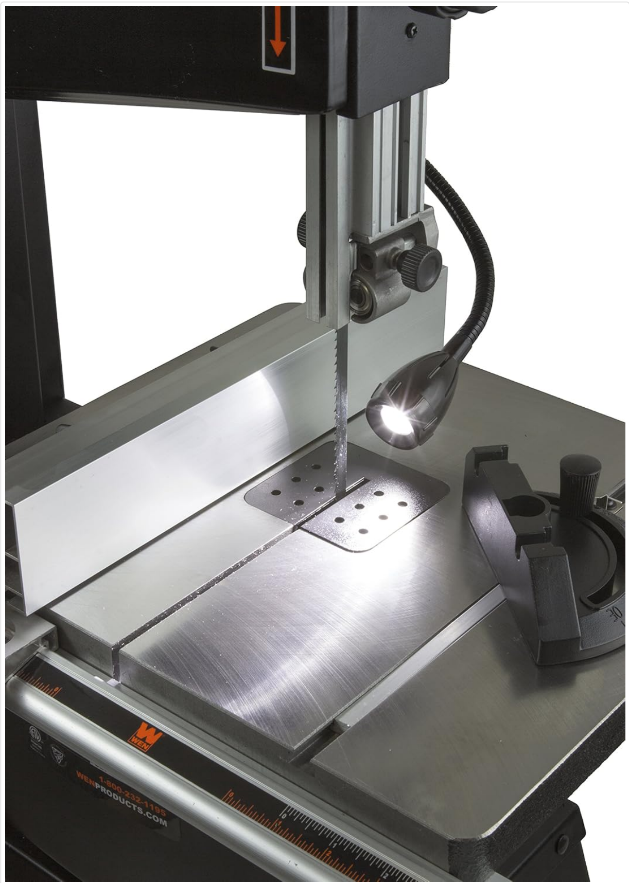
Figure 4.4: Flexible work light in position.