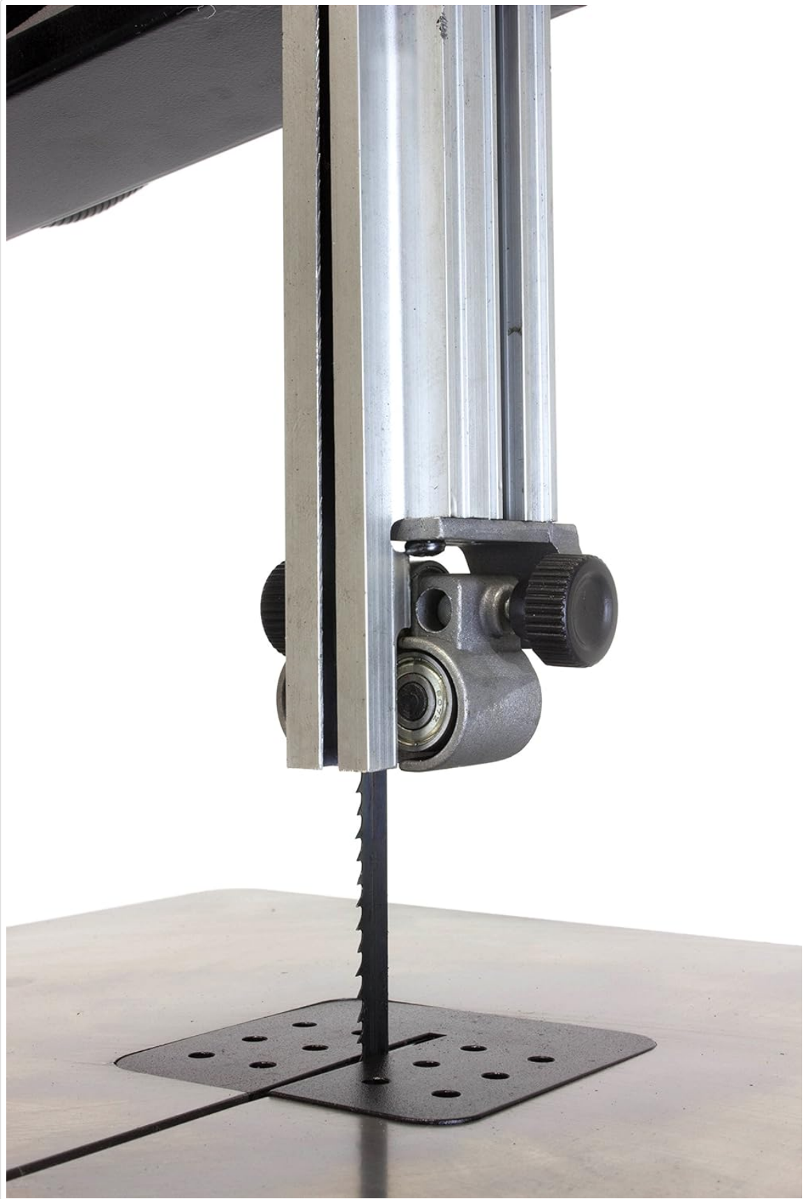
Figure 4.2: Close-up of blade guide and thrust bearings.