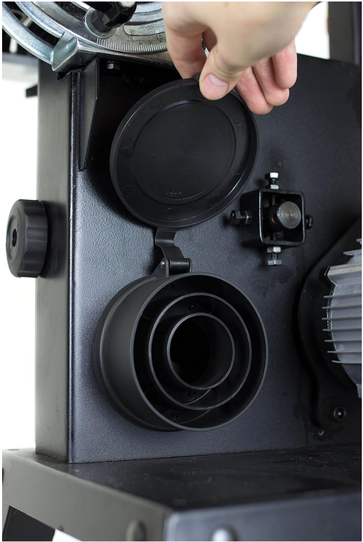
Figure 4.5: 3-in-1 dust port for dust collection.