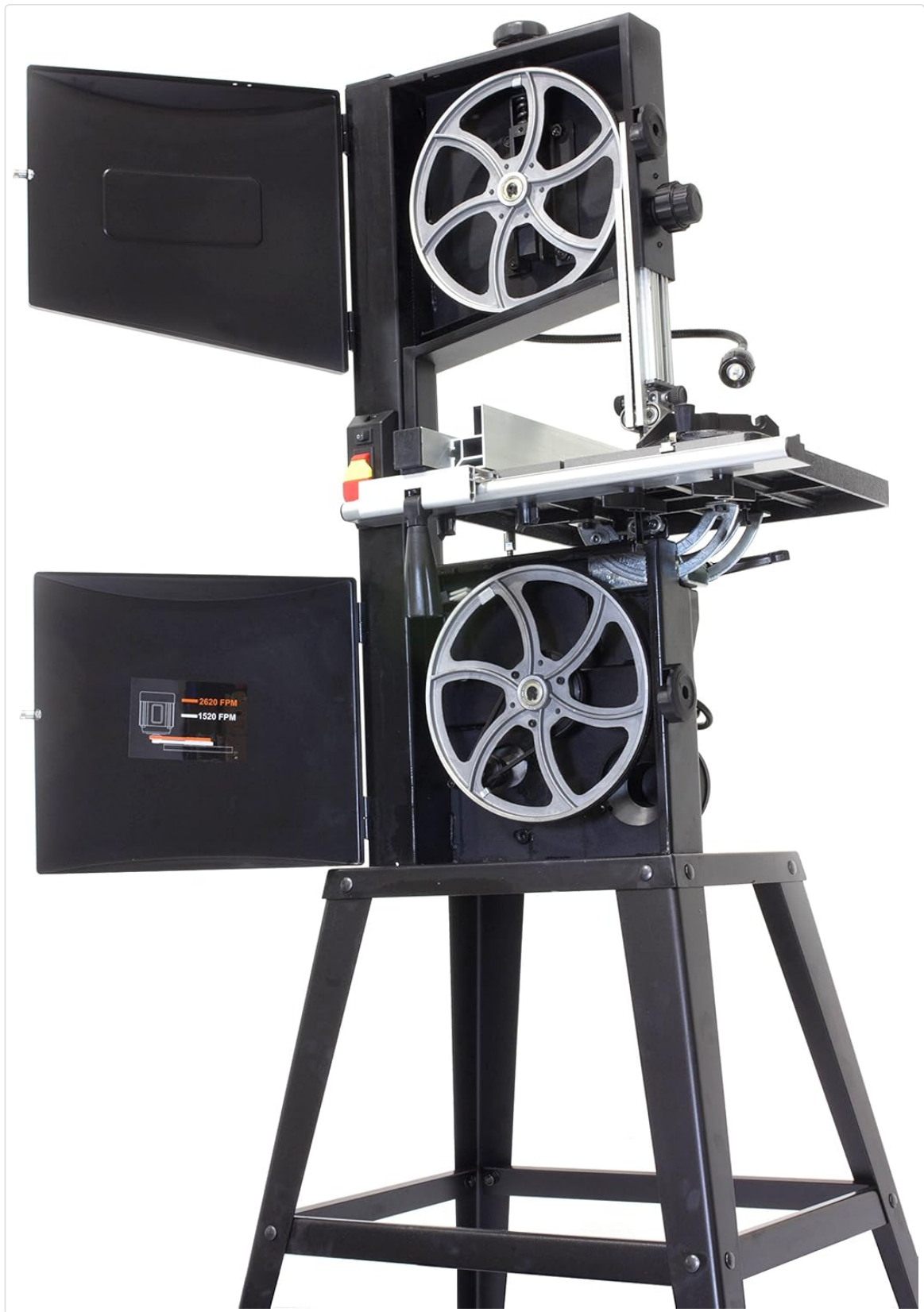
Figure 4.1: Internal view showing blade wheels and tensioning.