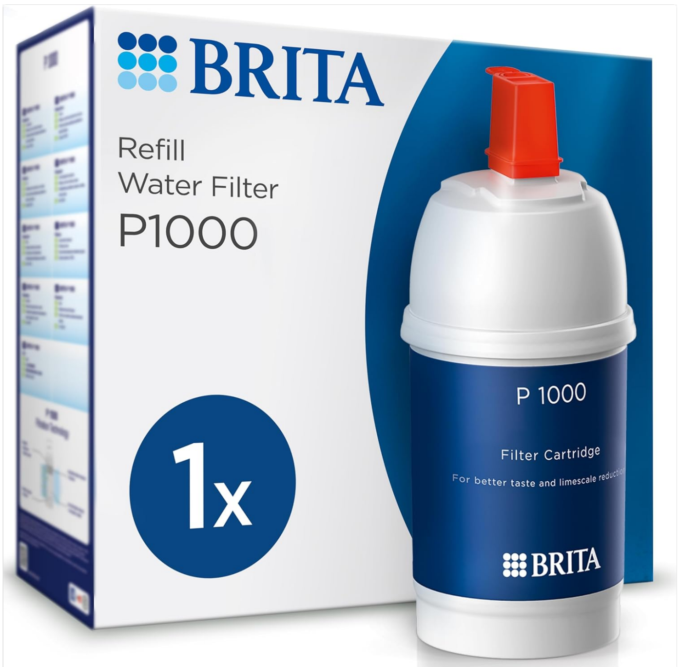
Image Description: This image shows the packaging for a single BRITA P1000 Refill Water Filter cartridge alongside the cartridge itself. The packaging clearly indicates "1x" and "P1000", emphasizing that this is a replacement filter for the system.