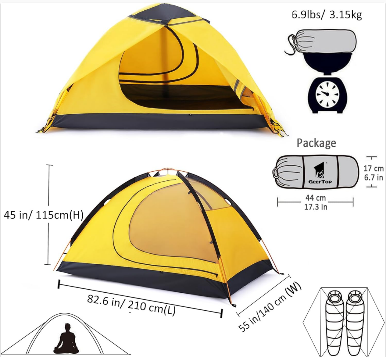
The tent's spacious interior and accessible entry point.