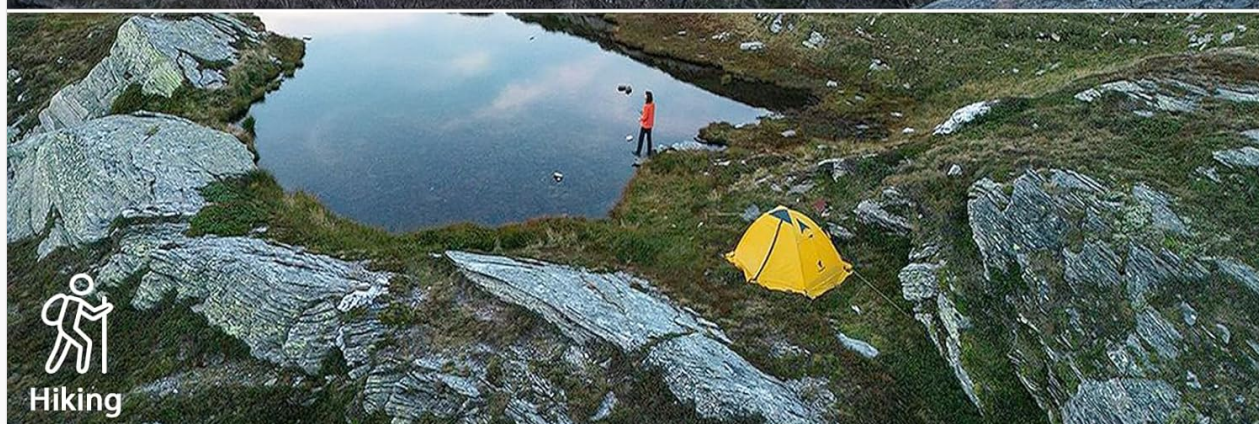
The GEERTOP tent fully set up in an outdoor environment.