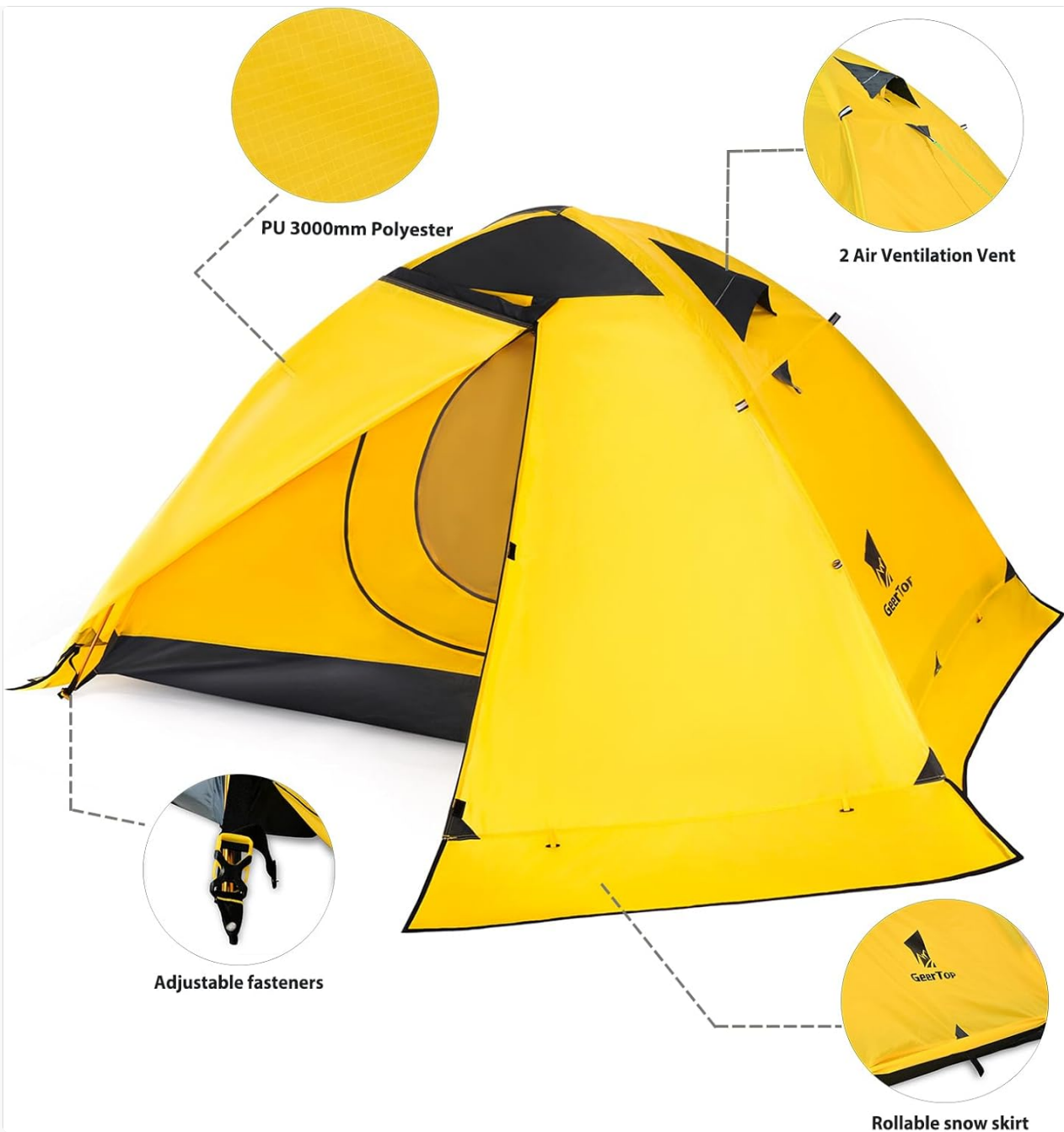
Key features of the GEERTOP tent, including material, ventilation, and adjustable components.