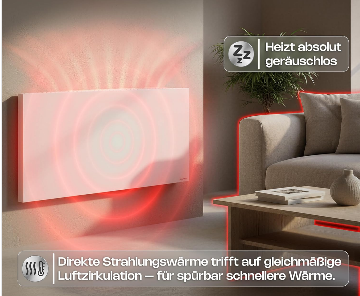
Figure 2.2: Illustration of the hybrid heating principle, combining direct radiant heat and uniform air circulation.