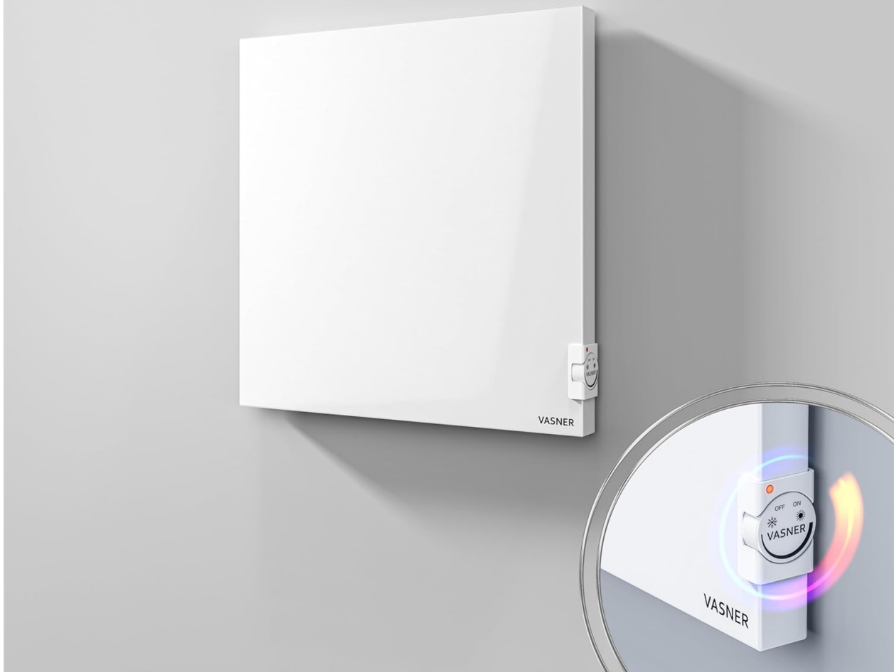
Figure 2.1: VASNER Konvi 600W Hybrid Infrared Heater, front view showing the compact design and integrated thermostat knob.