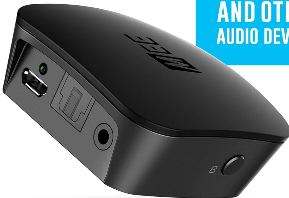
Figure 4: The MEE audio Connect offers digital and analog connectivity, including an optical TOSLINK port.