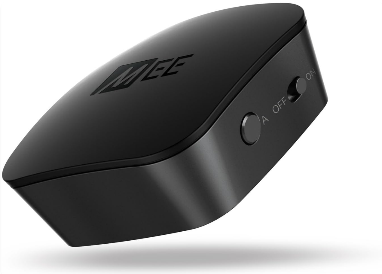
Figure 1: MEE audio Connect Bluetooth Audio Transmitter. This compact device enables wireless audio streaming from your

The MEE audio Connect Bluetooth Audio Transmitter allows you to stream high-definition stereo sound wirelessly from your TV or other audio sources to up to two Bluetooth headphones or speakers simultaneously. Featuring Qualcomm aptX Low Latency technology, it ensures a high-fidelity, lag-free audio experience, eliminating lip-syncing issues. It supports multiple connectivity options including 3.5mm, RCA, and optical TOSLINK inputs, making it universally compatible with various devices.