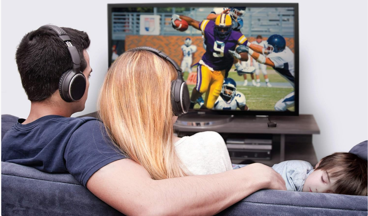
Figure 3: The MEE audio Connect supports dual headphone streaming, allowing two users to listen simultaneously.

Streams audio to up to two Bluetooth headphones or speakers simultaneously