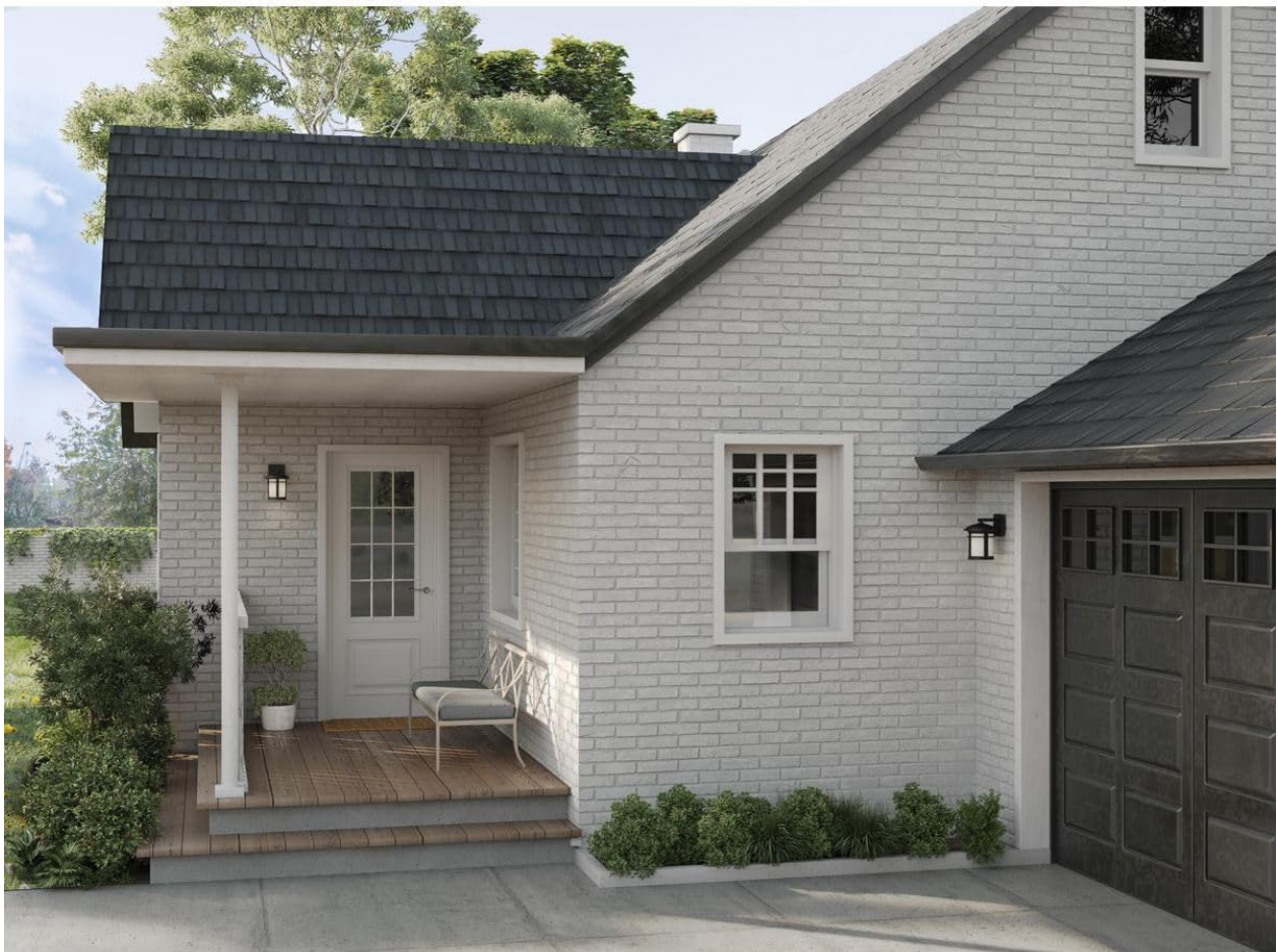
Image Description: Two Progress Lighting Wish LED outdoor wall lanterns illuminating the entryway of a house with light-colored brick and a dark wooden double door.