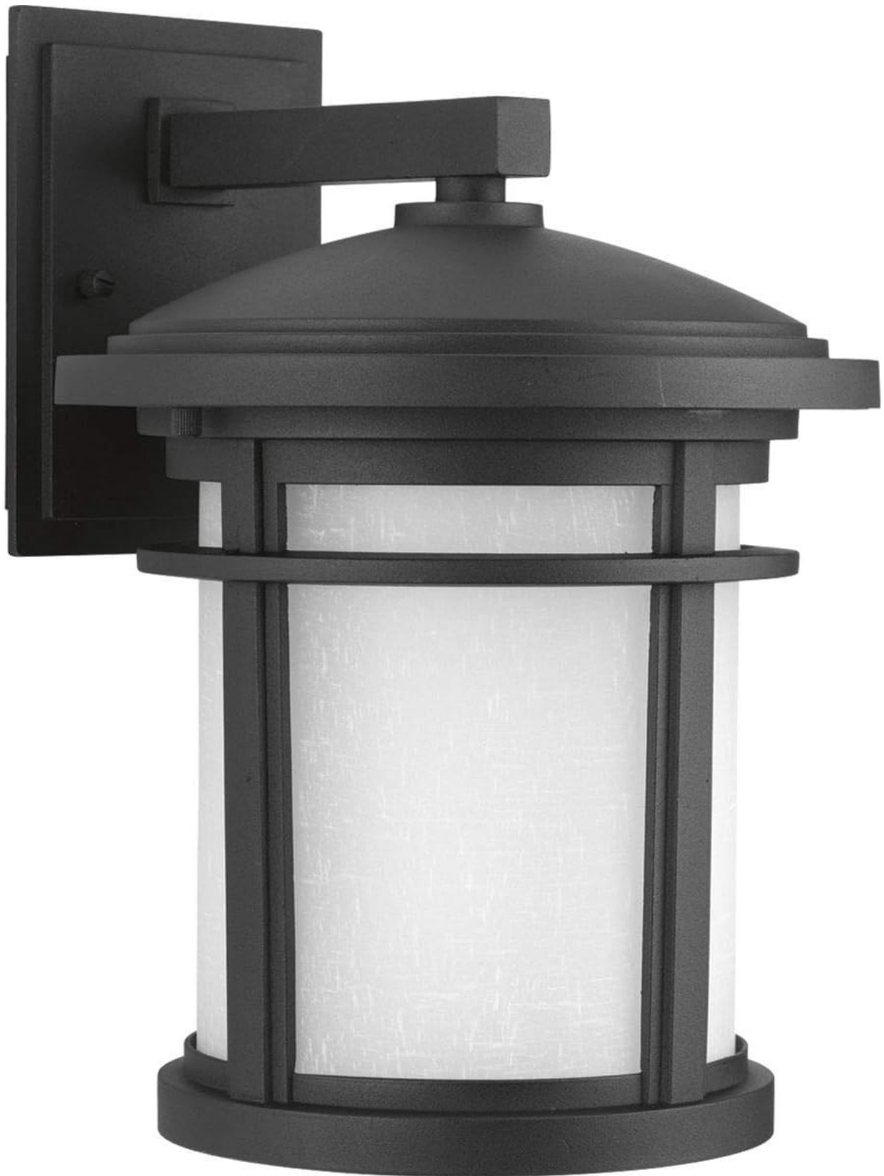
Image Description: A close-up view of the Progress Lighting Wish LED Outdoor Wall Lantern, showcasing its textured black finish and etched white linen glass cylinder.