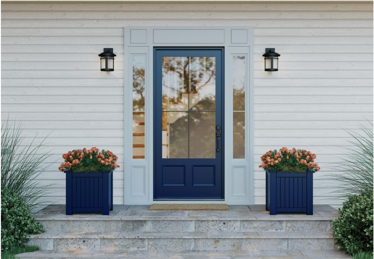
Image Description: Two Progress Lighting Wish LED outdoor wall lanterns flanking a dark blue front door on a white-sided house, demonstrating proper placement.