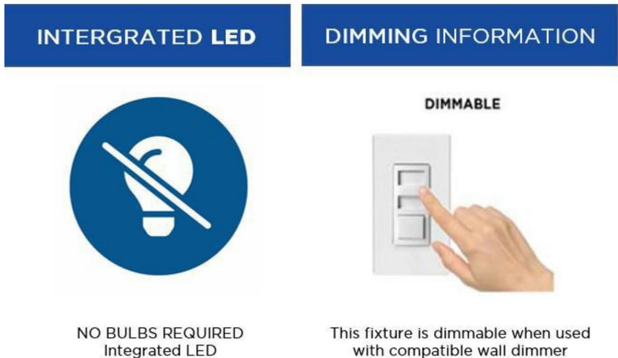
Image Description: A graphic illustrating the integrated LED feature (no bulbs required) and demonstrating the fixture's dimmable capability with a compatible wall dimmer switch.

This fixture features integrated LED lighting and is dimmable when used with a compatible wall dimmer. Ensure your dimmer switch is rated for LED lighting to prevent damage and ensure proper operation. The LED module is integrated and does not require bulb replacement.