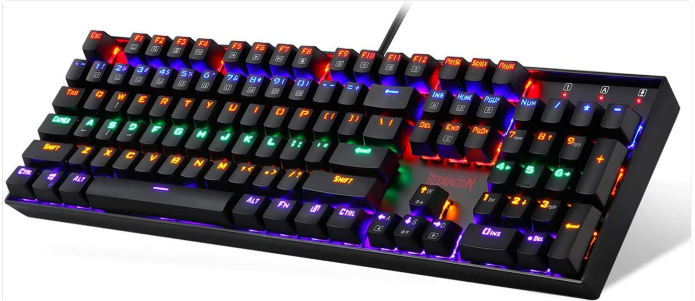
Figure 1: Redragon K551 Rainbow LED Backlit Mechanical Gaming Keyboard.

This user manual provides comprehensive instructions for the Redragon K551 Rainbow LED Backlit Mechanical Wired Gaming Keyboard. It covers essential information regarding setup, operation, maintenance, troubleshooting, and product specifications to ensure optimal performance and longevity of your device.