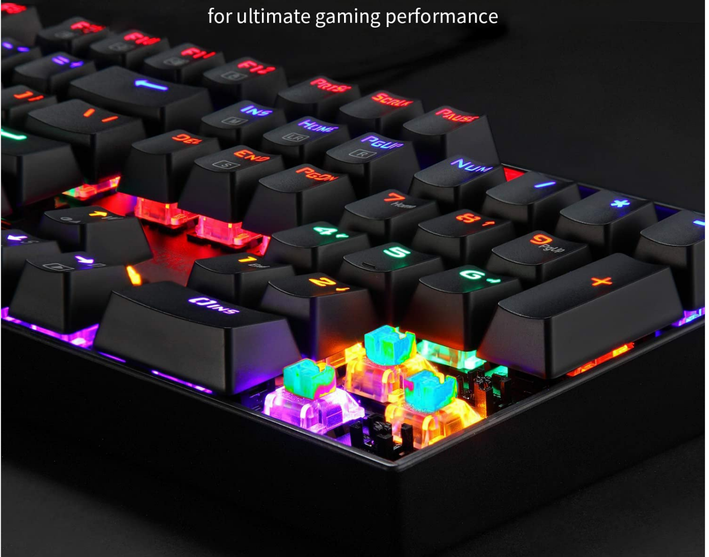
Figure 6: Mechanical key switches providing quiet click sound and fast action.

Clicky sound, fast action with minimal resistance with a tactile bump feel, for ultimate gaming performance