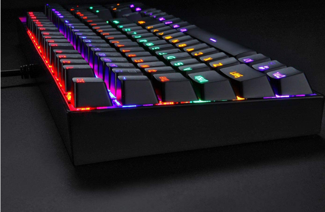
Figure 7: Durable metal-ABS construction for long-lasting use.

The PC gaming keyboard is constructed of metal alloy and ABS with plate-mounted mechanical keys and switches that stand up to tough gaming conditions