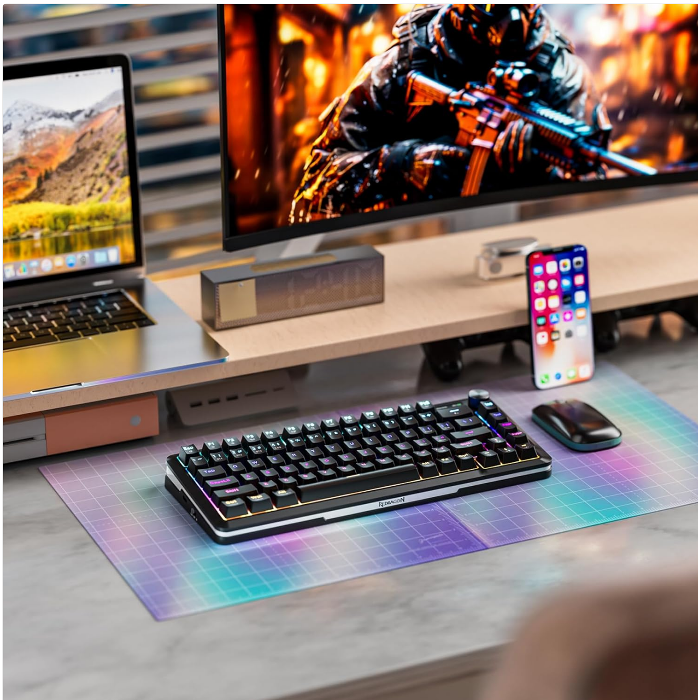
Figure 2: Redragon K551 keyboard integrated into a gaming setup.