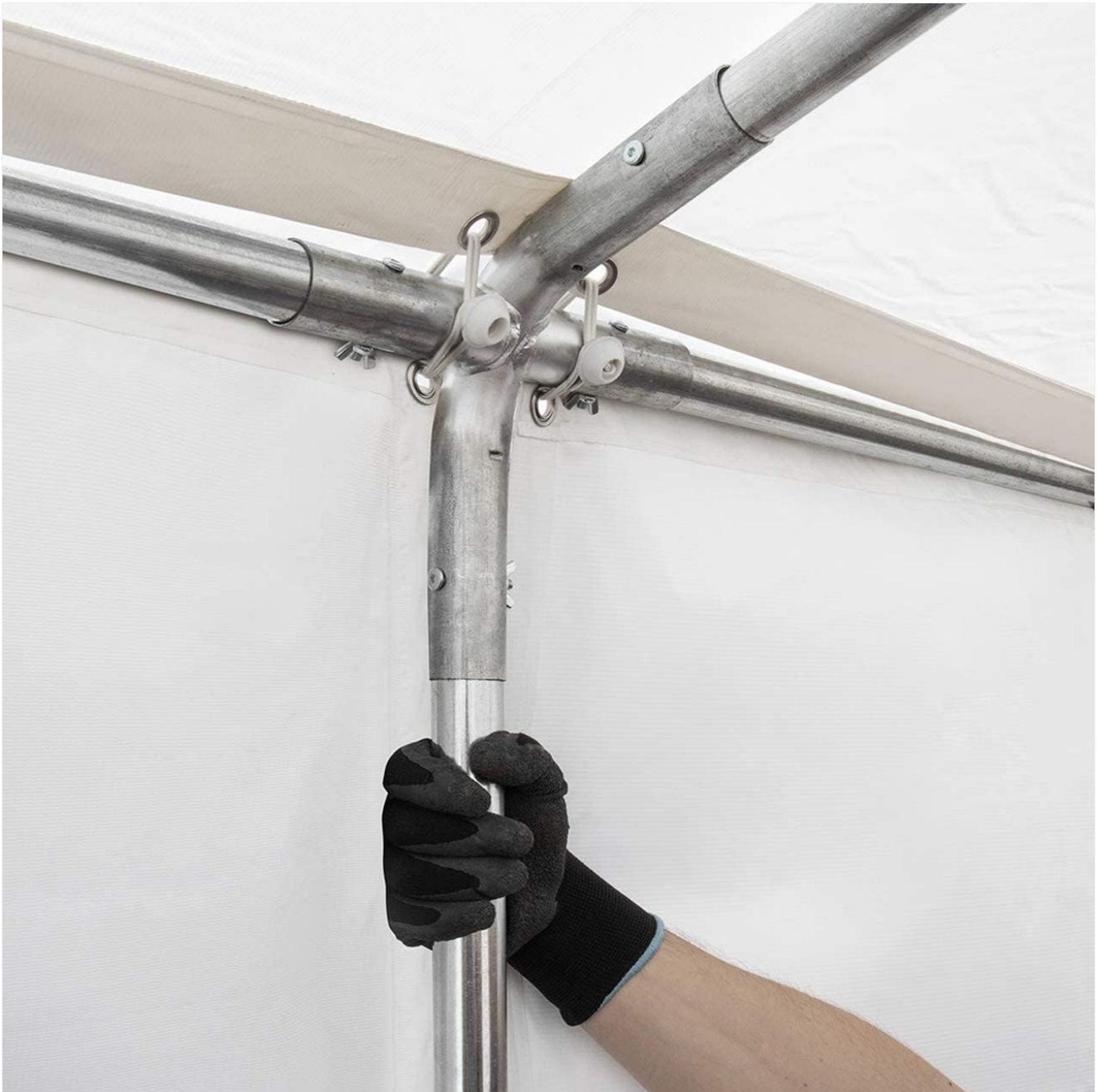
Image: Detail of a hand securing a tent pole connection with a bolt and wing nut.