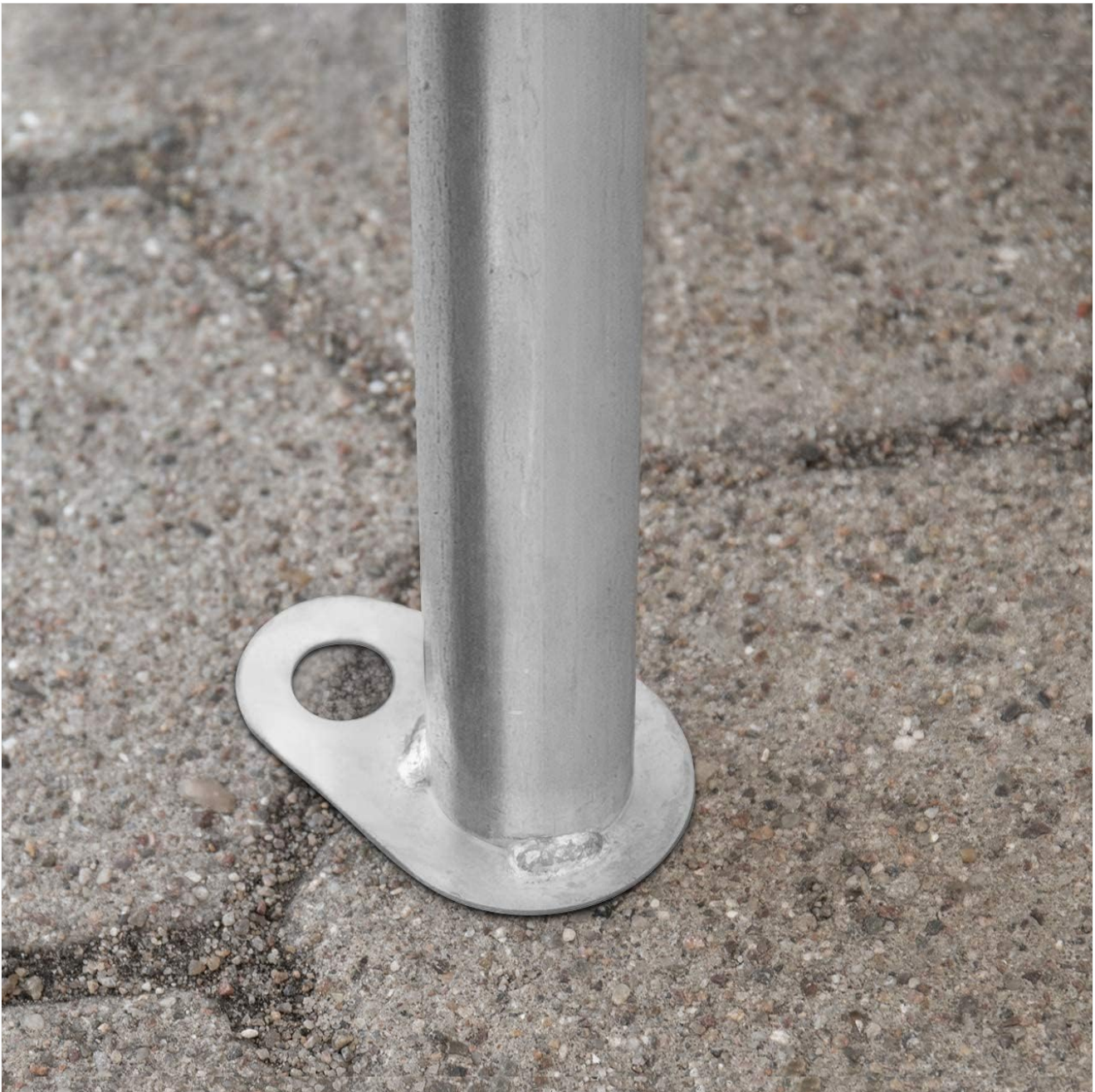
Image: Close-up of a tent leg with a welded-on base plate for secure anchoring.