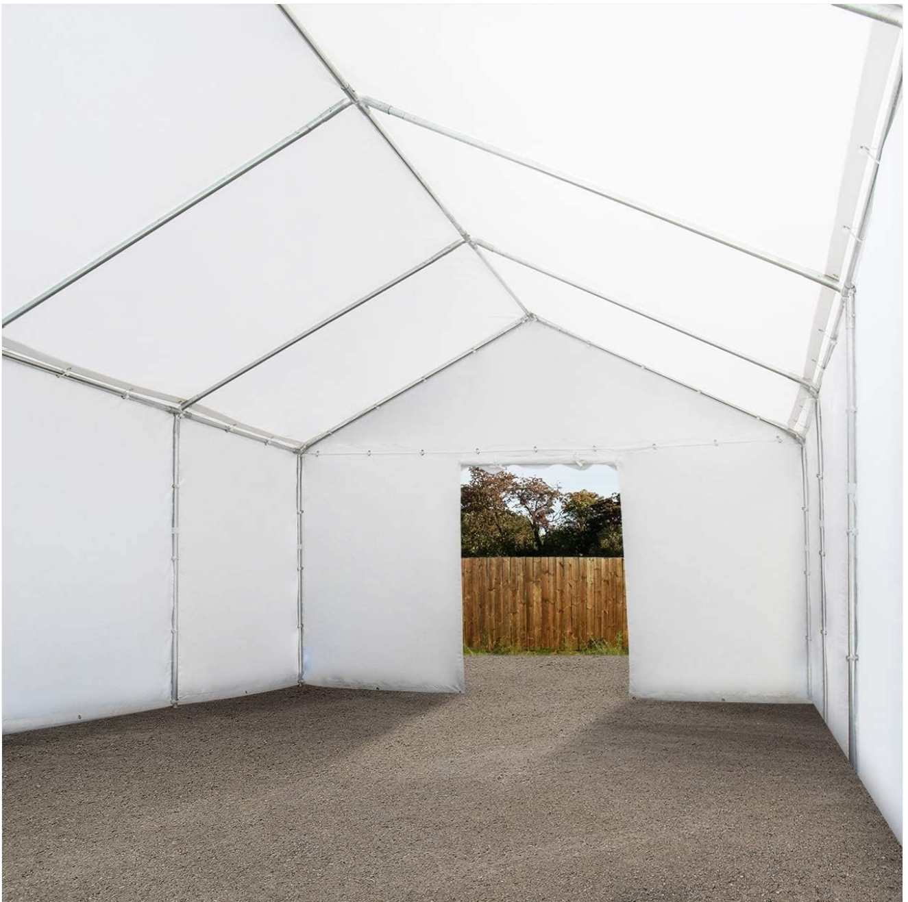
Image: Interior view showcasing the robust steel frame structure.