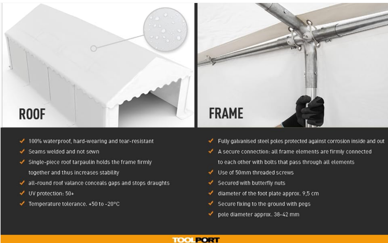
Image: Detailed features of the roof (welded seams, UV protection) and frame (galvanized steel, secure connections).