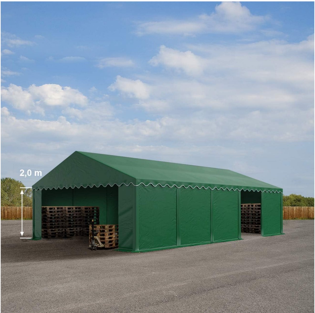
Image: Exterior view of the TOOLPORT 5x10m dark green storage tent.