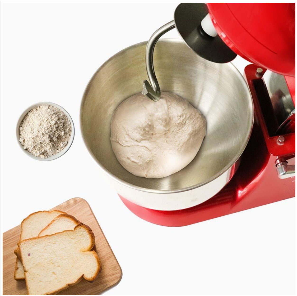
Figure 5.1: The dough hook efficiently kneads bread dough, ensuring proper consistency.