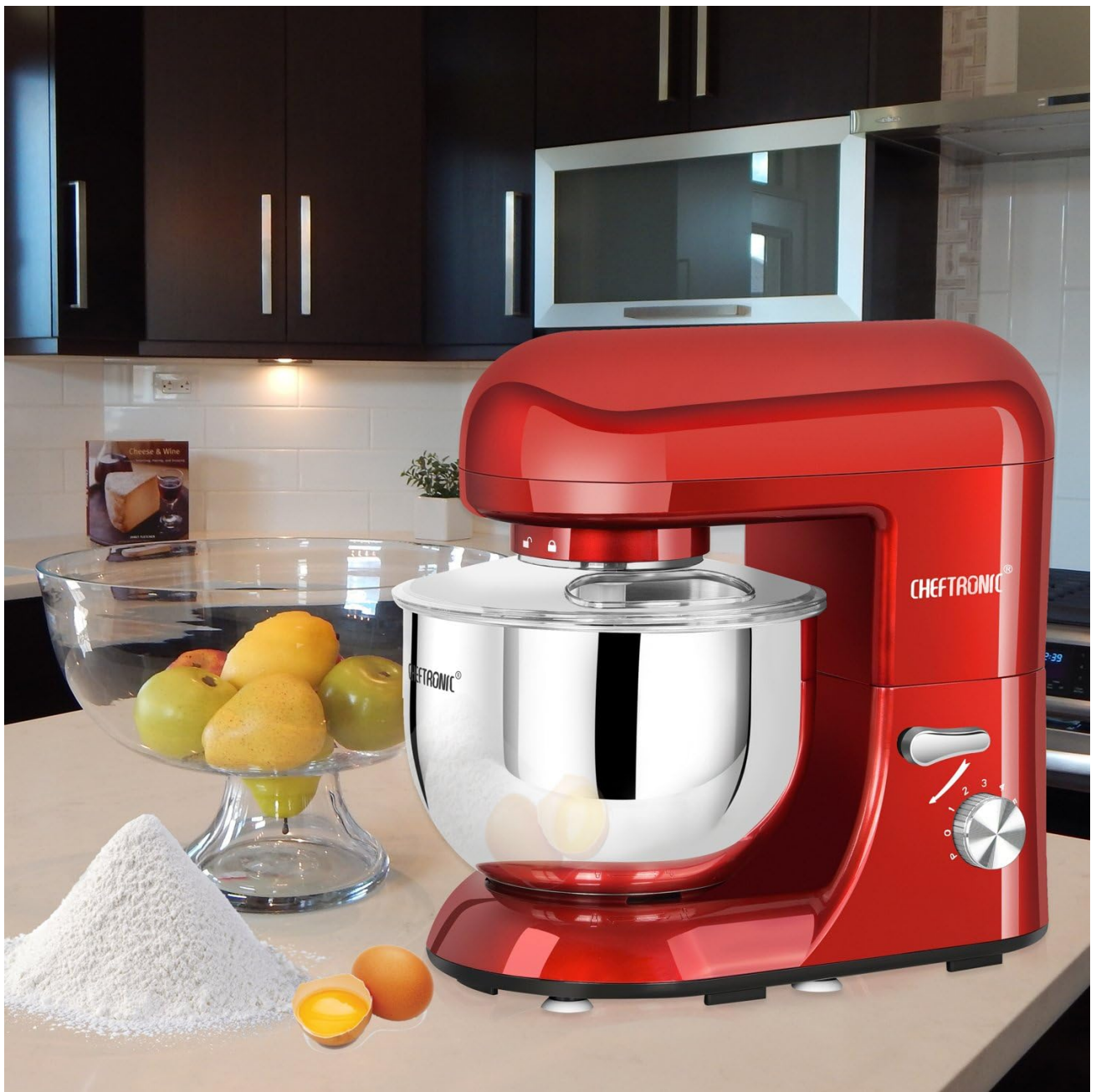
Figure 4.1: The CHEFTRONIC Stand Mixer is designed to blend seamlessly into your kitchen environment.