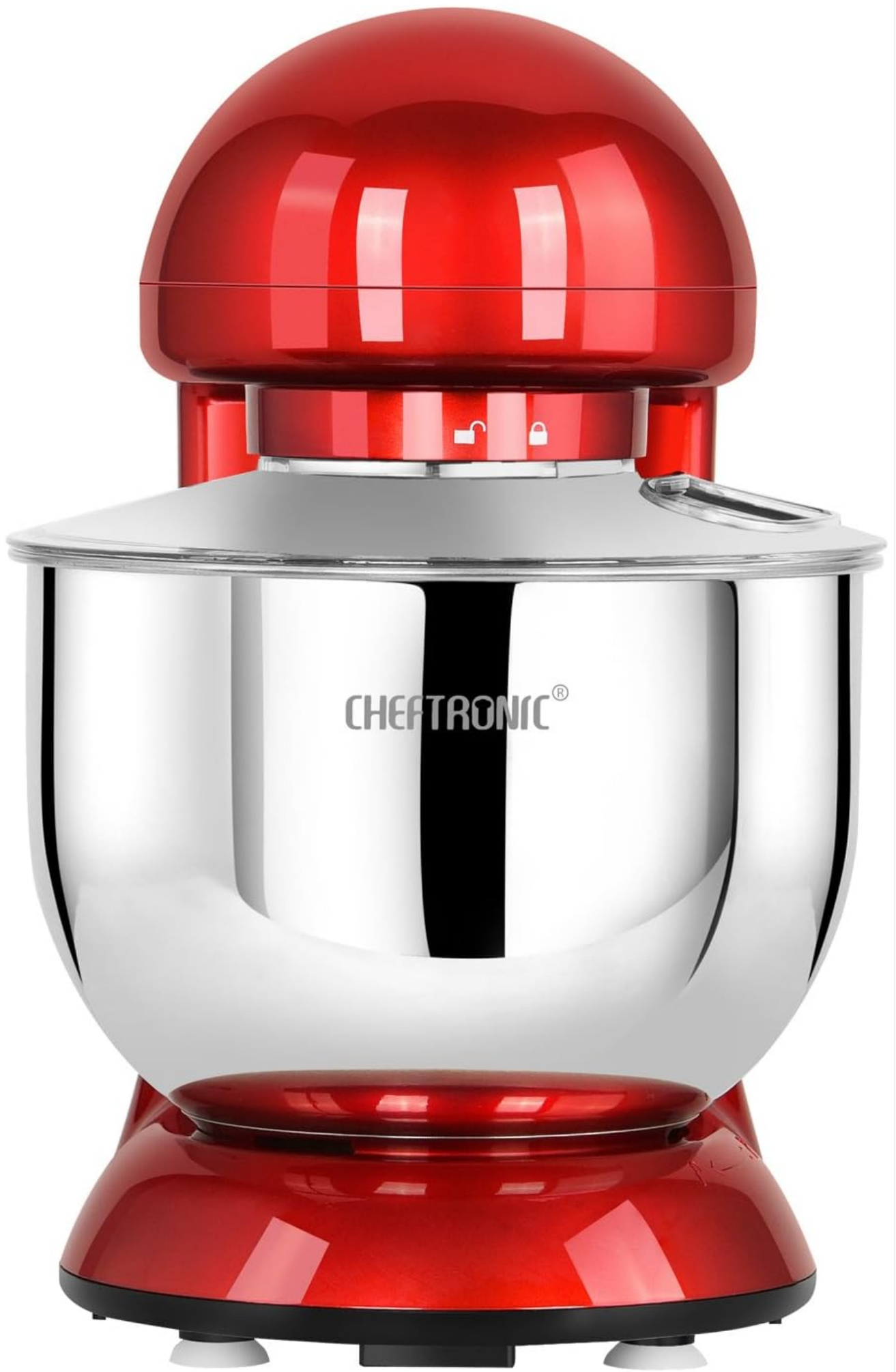
Figure 2.1: Front view of the CHEFTRONIC Stand Mixer with the tilt-head down. This image shows the compact design and the