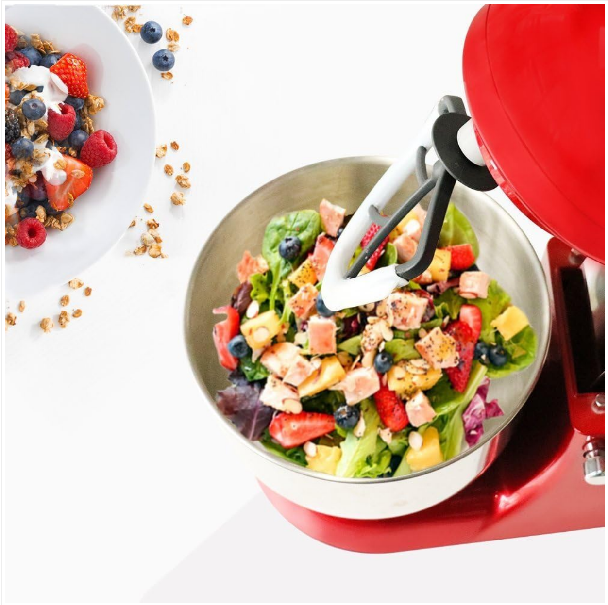
Figure 5.2: The flex edge beater ensures thorough mixing, even for ingredients like salad.