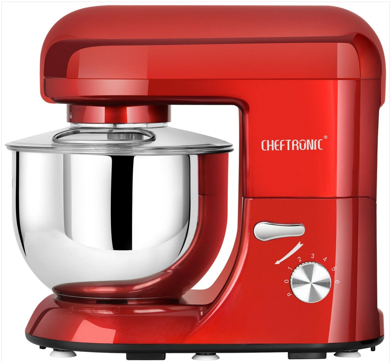
Figure 3.1: The tilt-head mechanism allows for easy attachment and removal of accessories and the mixing bowl.