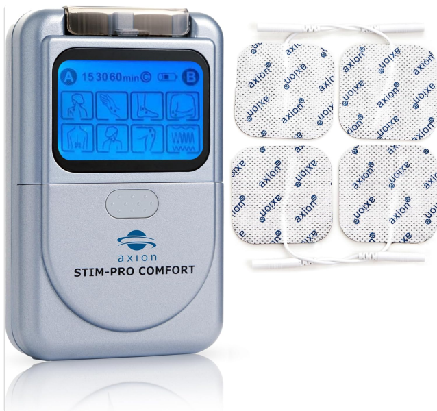
The STIM-PRO Comfort TENS Unit with included electrode pads.