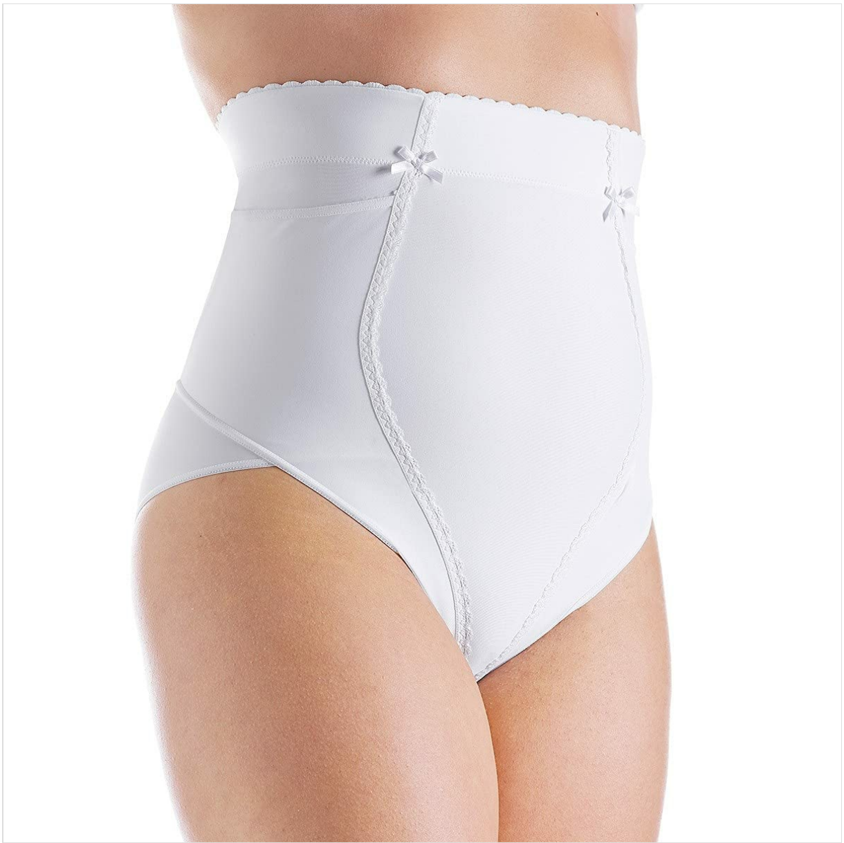
Image 1: Side view of the Chicco Mamma Donna Postpartum Modelling Sheath. This image shows the high-waisted design and the gentle contouring it provides to the abdominal area.