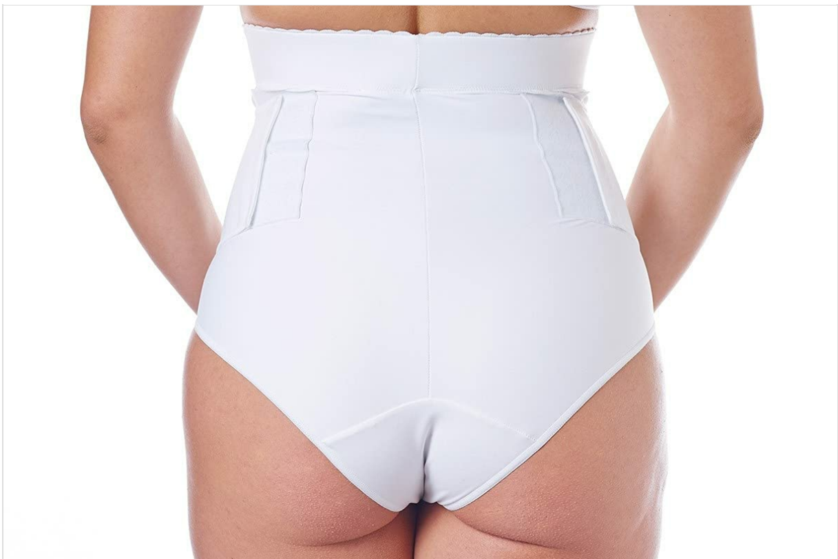
Image 3: Back view of the Chicco Mamma Donna Postpartum Modelling Sheath. This image illustrates the rear coverage and the seamless appearance.