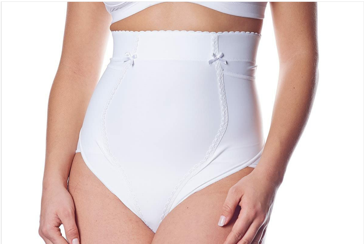
Image 2: Front view of the Chicco Mamma Donna Postpartum Modelling Sheath. This image highlights the front panel design and the overall coverage.