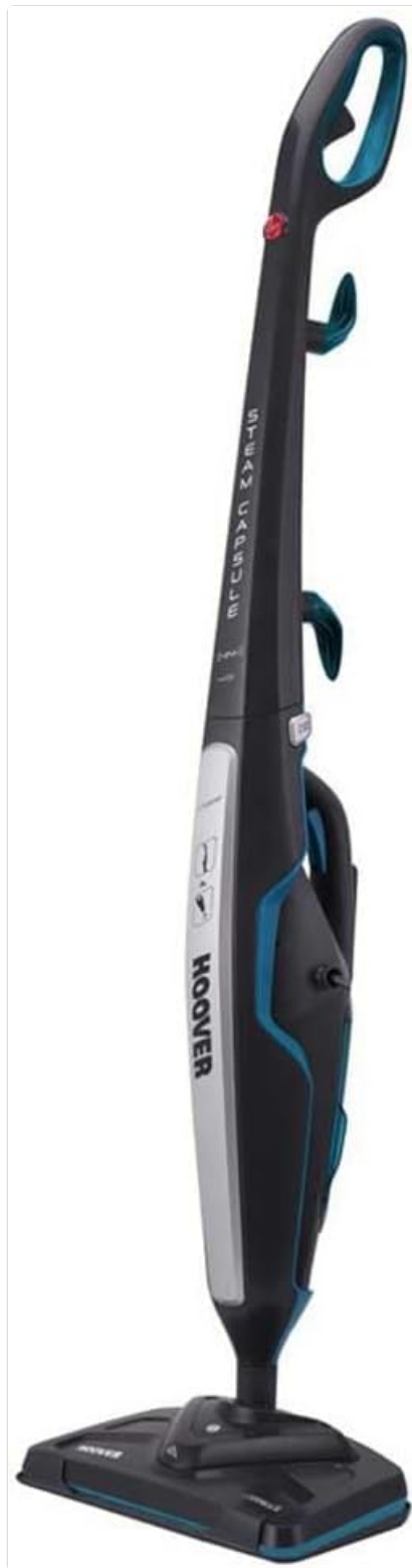
Figure 1: Overview of the Hoover CA2IN1D 011 Steam Capsule 2-in-1 Steam Cleaner.