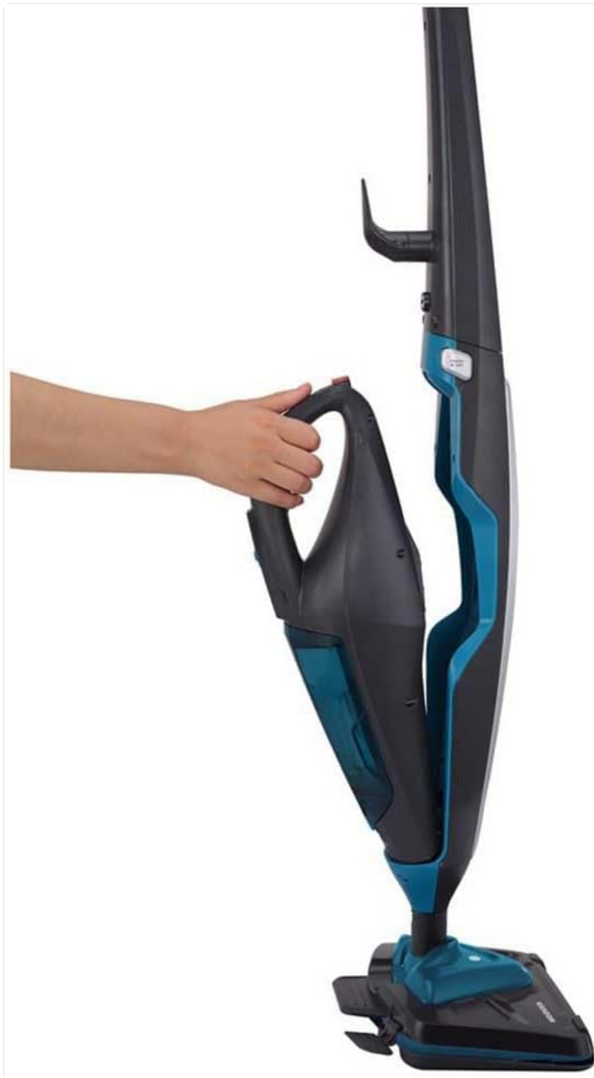
Figure 4: The handheld steam unit being detached from the main body of the steam cleaner.