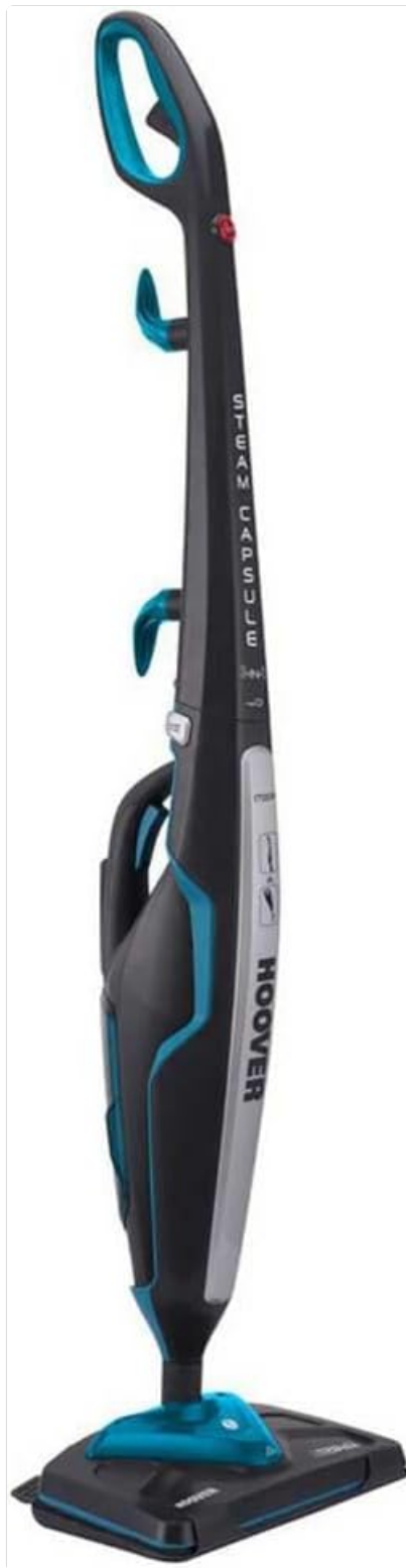
Figure 7: The Hoover Steam Capsule standing upright, ready for use or storage.