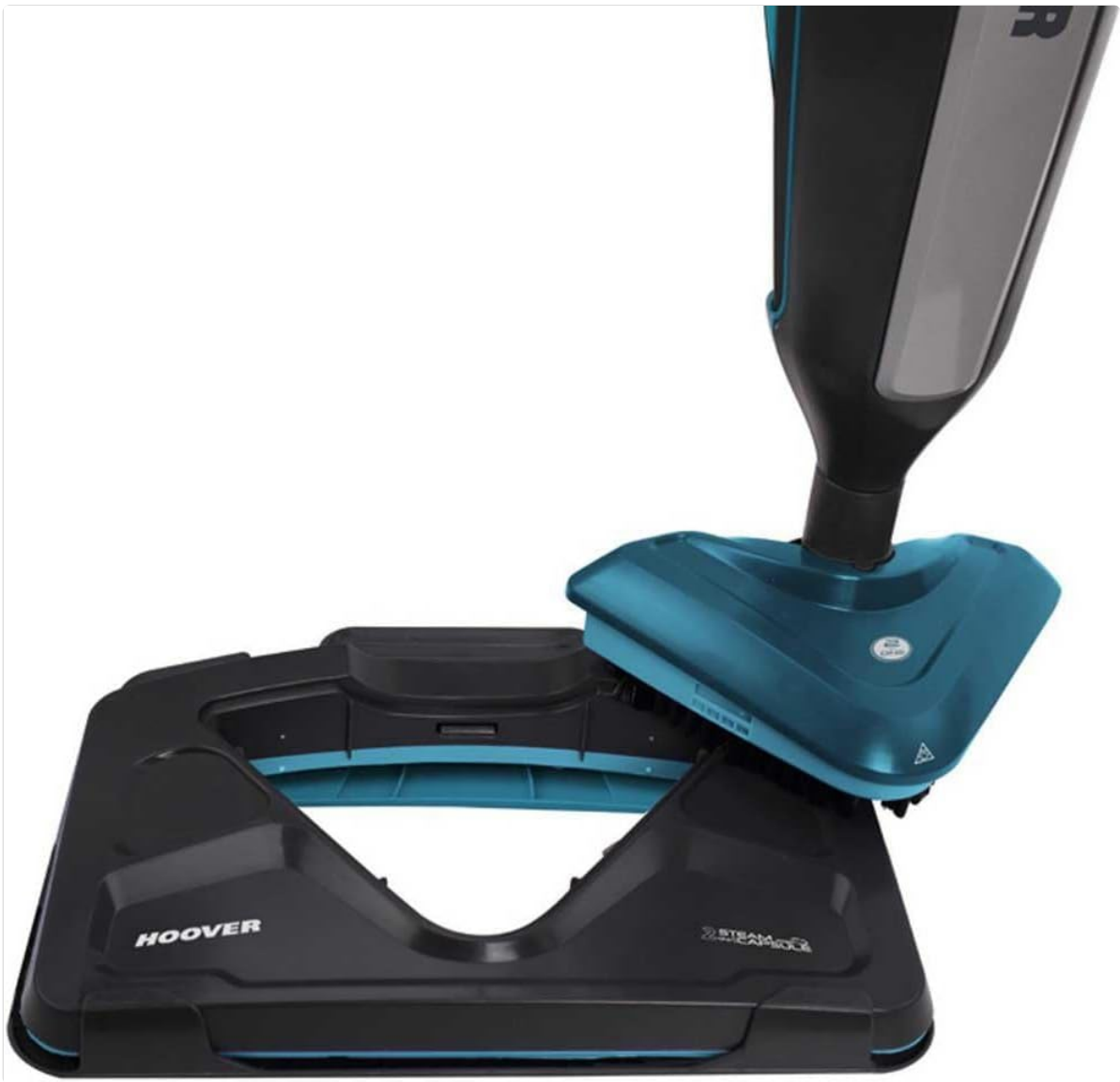
Figure 3: The mop pad being attached to the steam cleaner's base.