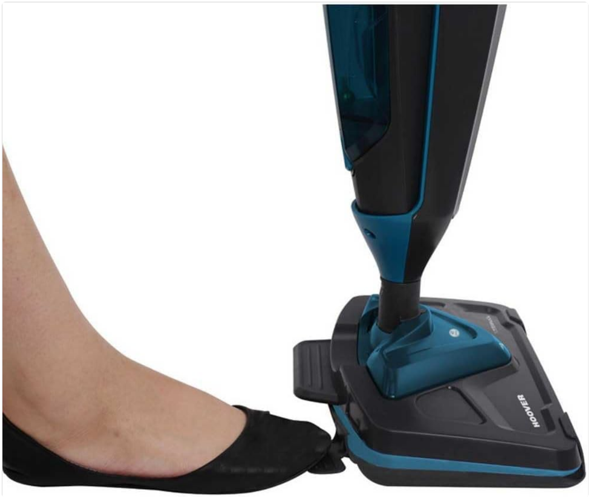
Figure 6: A foot pressing the release pedal to unlock the steam cleaner's base for operation.

steam will sanitize and clean as you move.