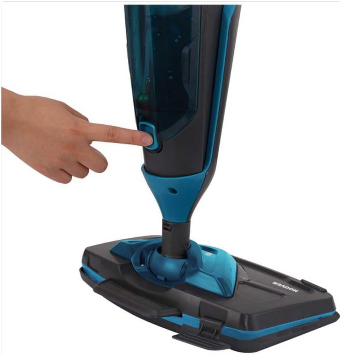
Figure 5: A hand pressing the release button to separate the handheld unit.

Your browser does not support the video tag.