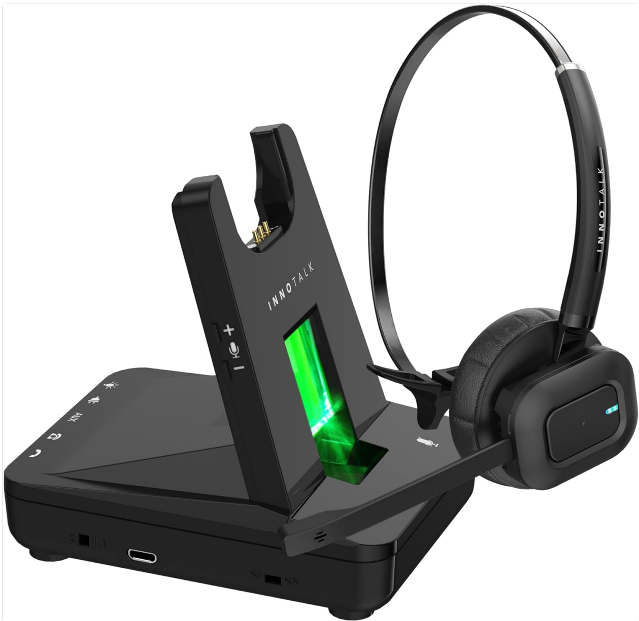
The INNOTALK wireless headset resting on its charging base, ready for use.