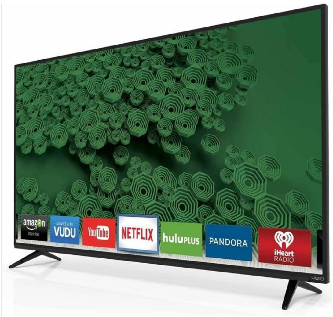
Image: Front view of the VIZIO D50u-D1 TV, showcasing its display with various smart application icons, indicating its smart TV capabilities.

When you power on the TV for the first time, an on-screen setup wizard will guide you through initial configurations, including language selection, network connection (Wi-Fi or Ethernet), and channel scanning (if connecting an antenna).