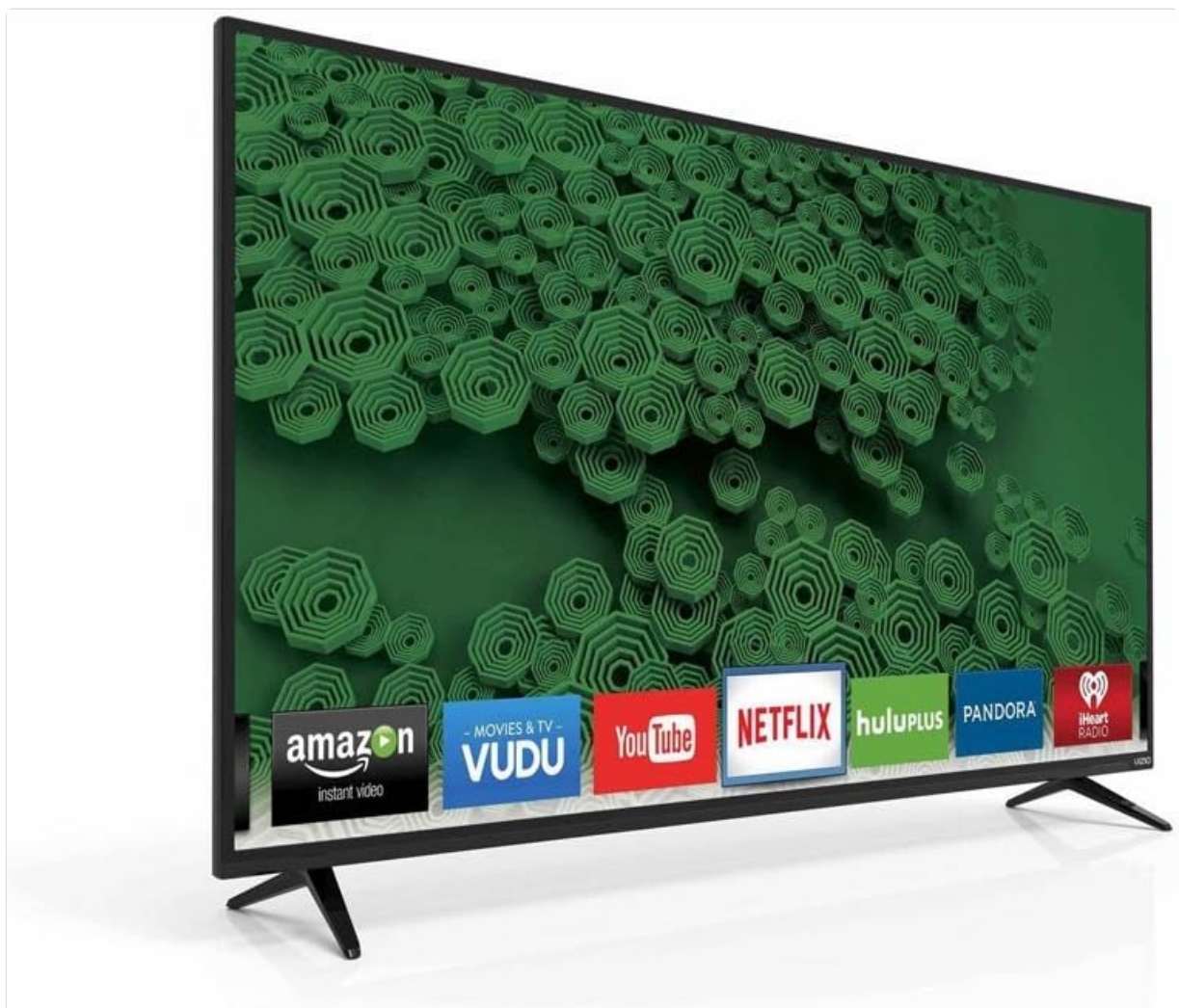
Image: Side view of the VIZIO D50u-D1 TV, illustrating its design and how the stand attaches.

Carefully place the TV screen-down on a soft, clean surface to prevent scratches. Align the stand pieces with the designated slots on the bottom of the TV and secure them with the provided screws. Ensure the stand is firmly attached before placing the TV upright.