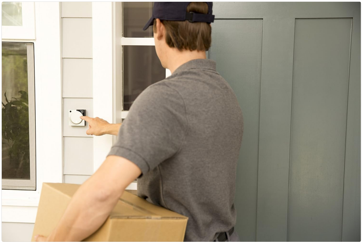
A person's finger presses the illuminated doorbell button on the August Home Doorbell Camera, indicating activation.