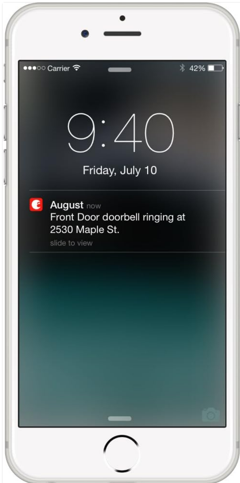
A smartphone screen shows a notification from the August app: 'Front Door doorbell ringing'.