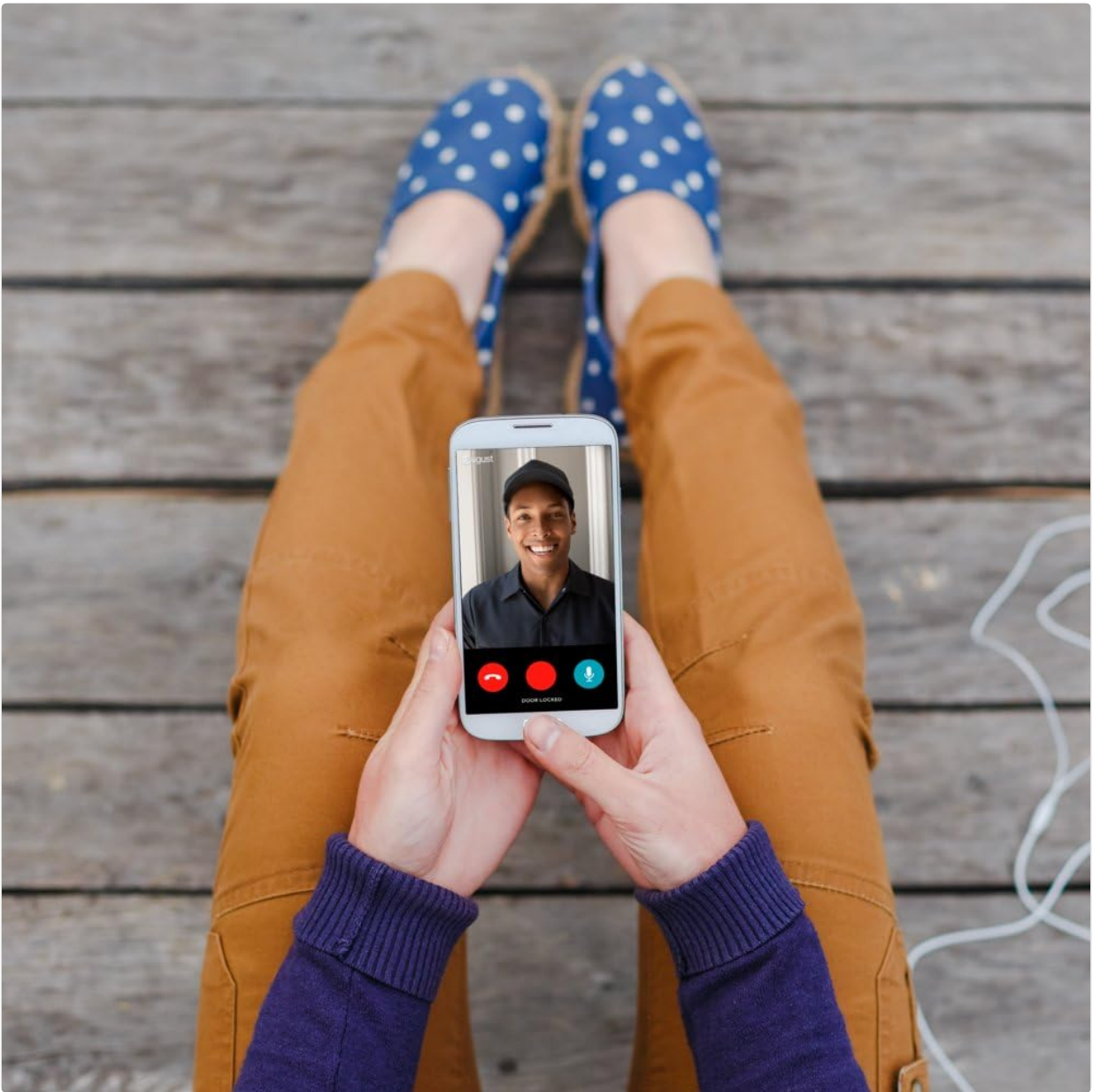
A user holds a smartphone displaying a live video call from the August Doorbell Camera, showing a visitor at the door.