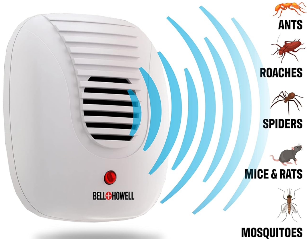
Image: An illustration showing a Bell and Howell Ultrasonic Pest Repeller emitting sound waves, with icons of various pests (ants, roaches, spiders, mice & rats, mosquitoes) being repelled.

Ultrasonic repellers emit sound waves inaudible to humans but uncomfortable for pests, driving them out of your home!