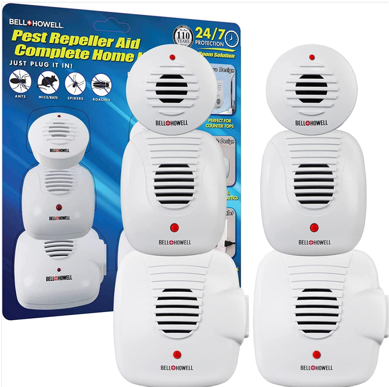
Image: The Bell and Howell Ultrasonic Pest Repeller 6-pack kit, showing the different sizes of repellers included in the package.

Note: For best results, it is recommended to use one repeller per room. The ultrasonic waves do not penetrate walls or solid objects effectively.