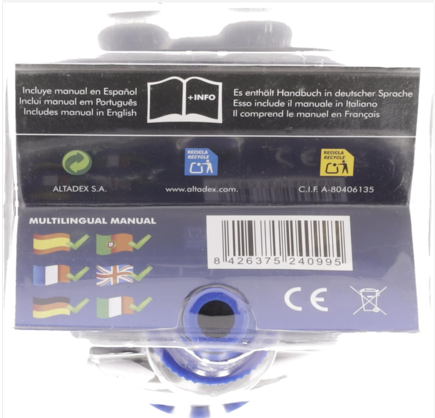
Figure 7: Product packaging displaying manufacturer and website information.