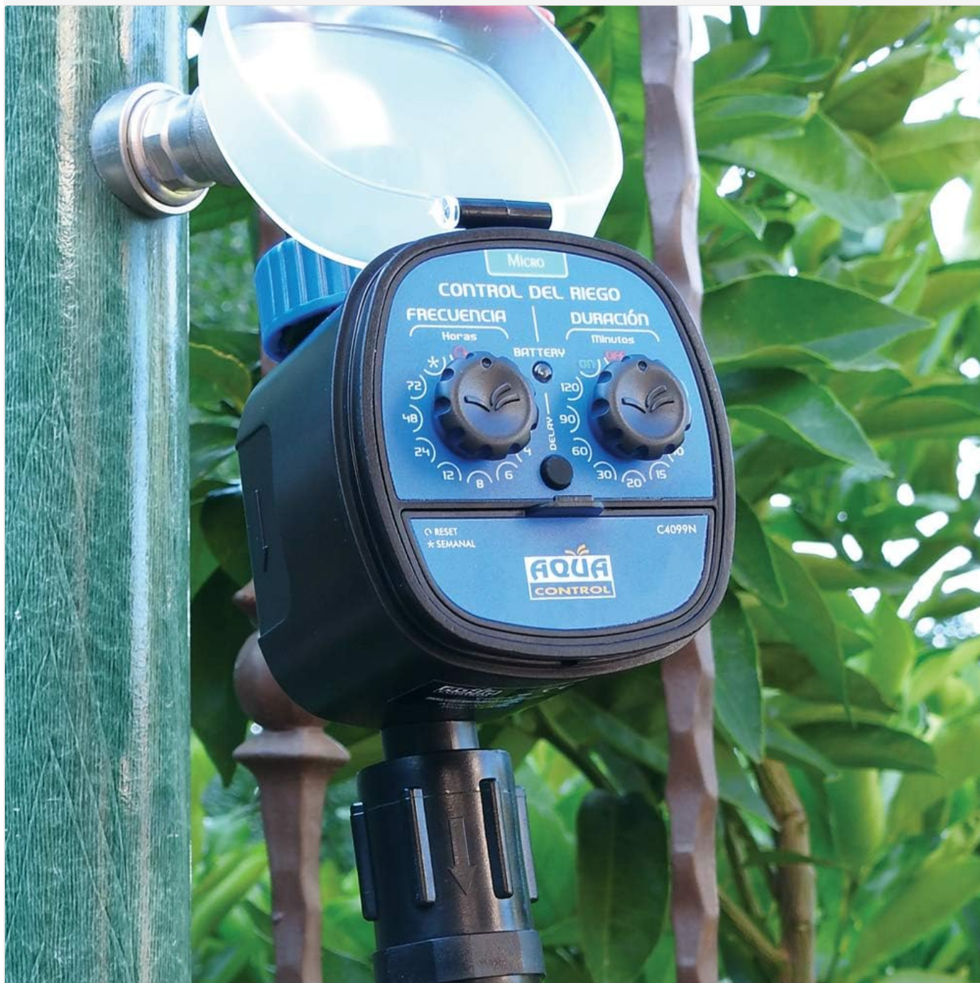
Figure 4: The irrigation programmer correctly installed on a garden tap.