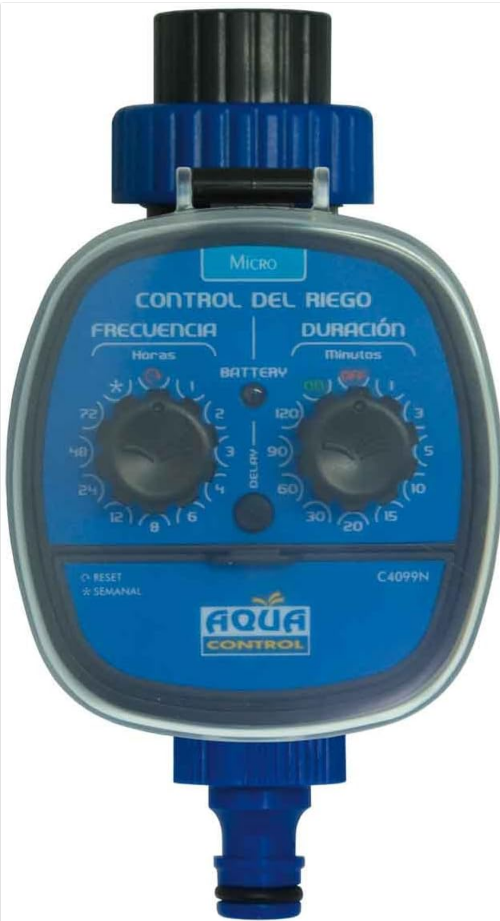
Figure 1: Front view of the Aqua Control C4099N Irrigation Programmer.