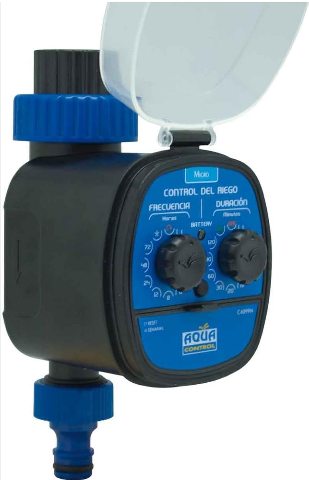
Figure 3: The programmer with its protective cover open, revealing the control dials.