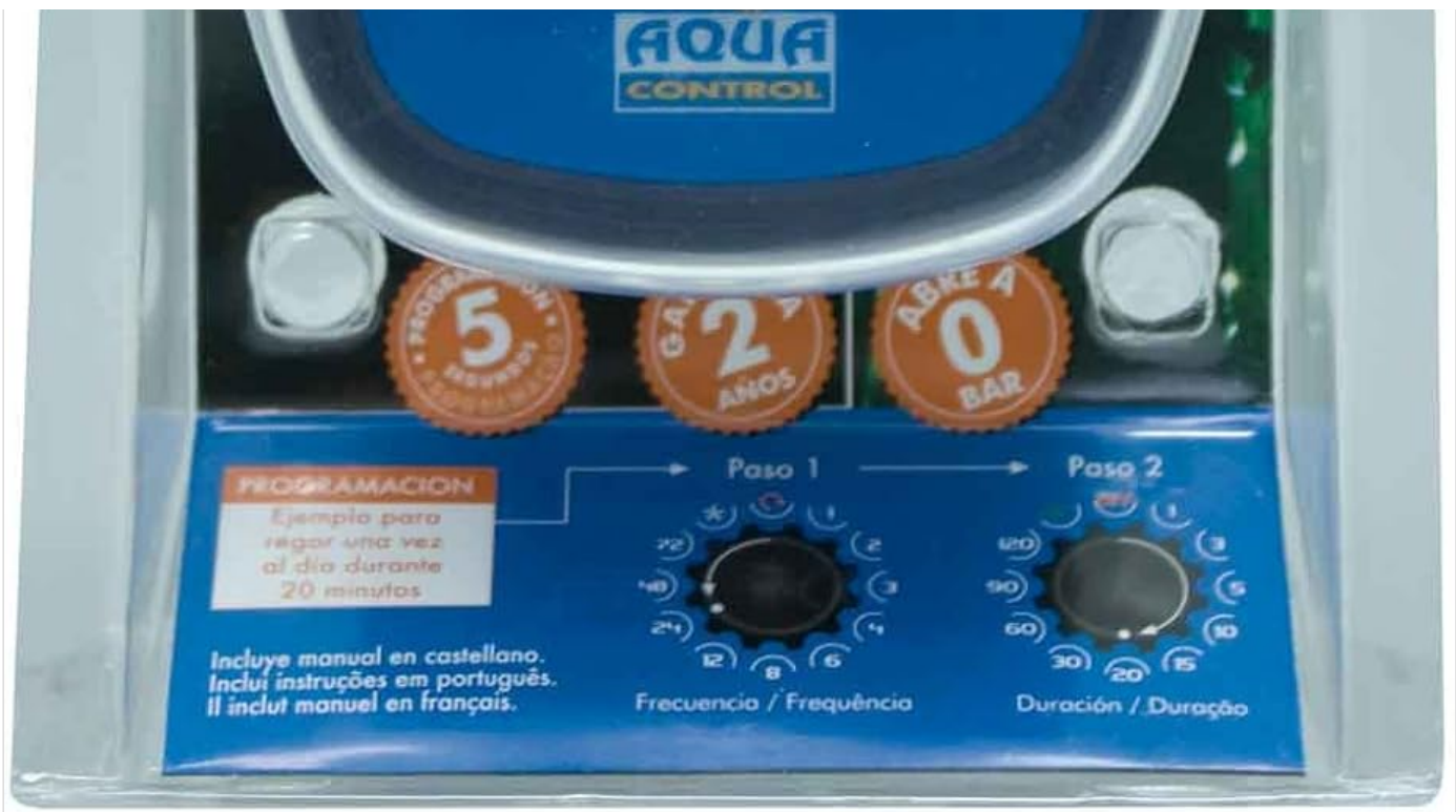
Figure 2: The Aqua Control C4099N Irrigation Programmer as packaged.