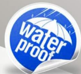
Figure 6: The product highlighting its 2-year warranty and waterproof design.