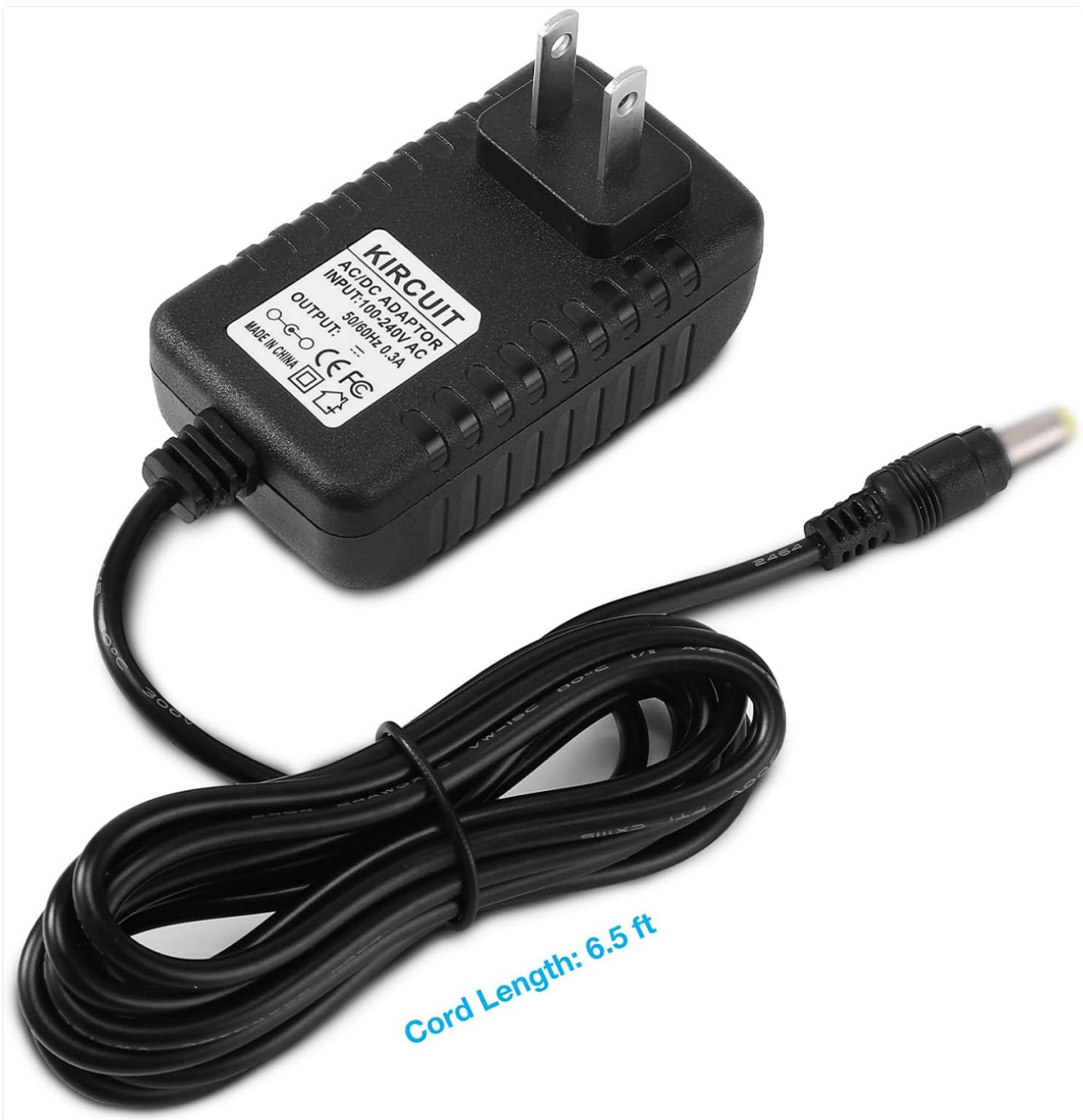
Image: The Kircuit AC Adapter displaying its 6.5 ft cord length.