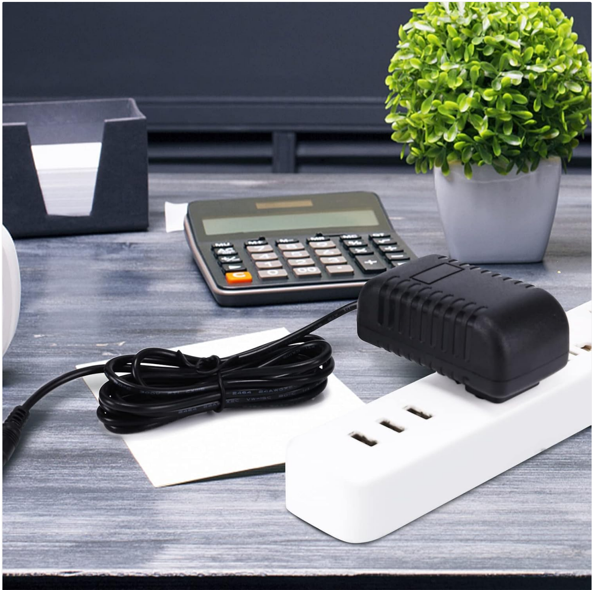
Image: The Kircuit AC Adapter connected to a power strip, illustrating a typical setup.