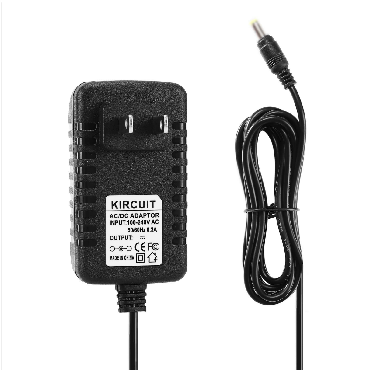
Image: The Kircuit AC Adapter, showing its compact design and connection type.