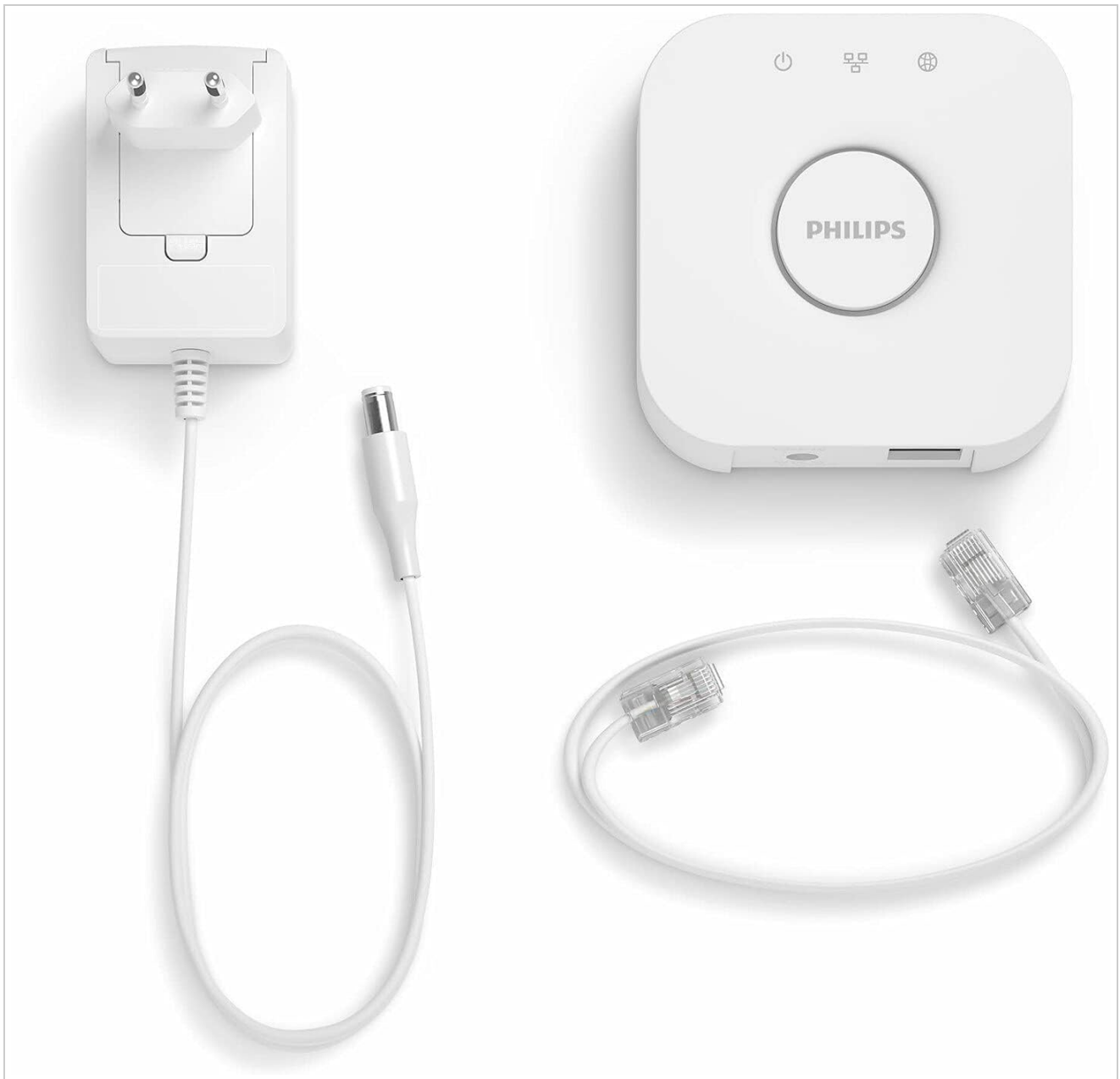
Image: Philips Hue Bridge, power adapter, and Ethernet cable included in the box.