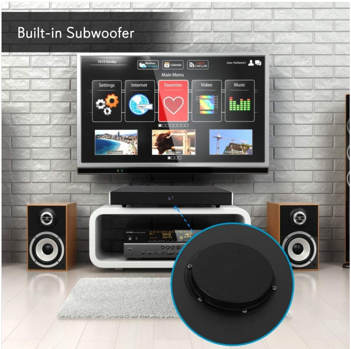
Image: Detail of the built-in subwoofer, contributing to the sound base's powerful audio output.