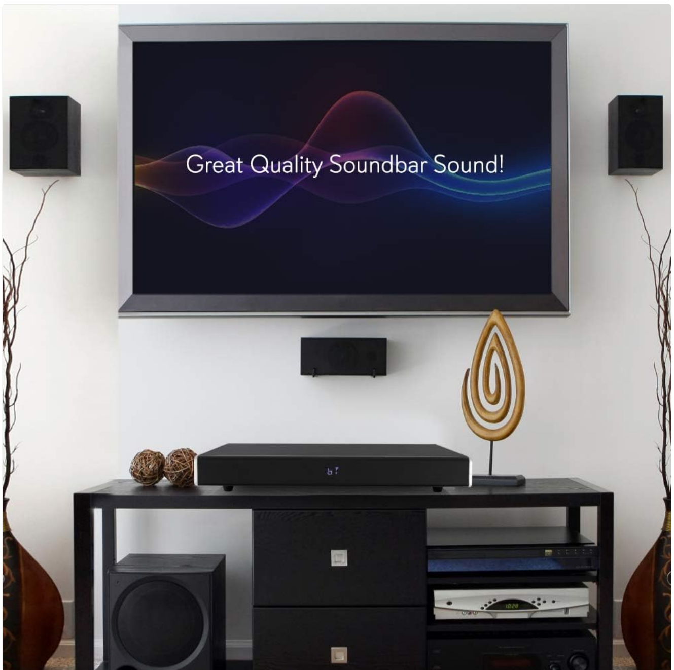
Image: The Pyle PSBV820BT delivers great quality soundbar sound for an immersive audio experience.

The integrated 5-inch subwoofer and dual 1.5-inch speakers provide a full range of audio, enhancing both dialogue and bass for a richer listening experience. Adjust bass and treble settings to suit your preference.