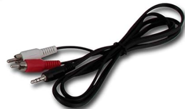
Aux-to-RCA Audio Cable

Image: Contents of the Pyle PSBV820BT package.