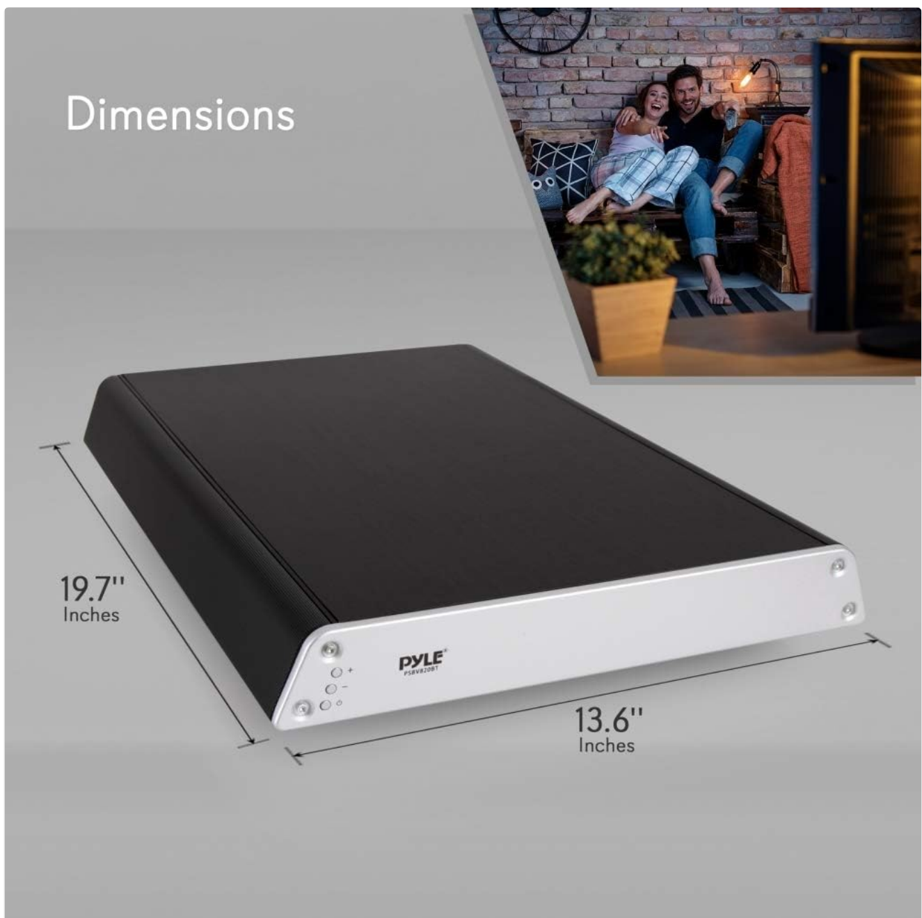
Image: Physical dimensions of the Pyle PSBV820BT Sound Base.