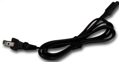
Wall Power Adapter Cable