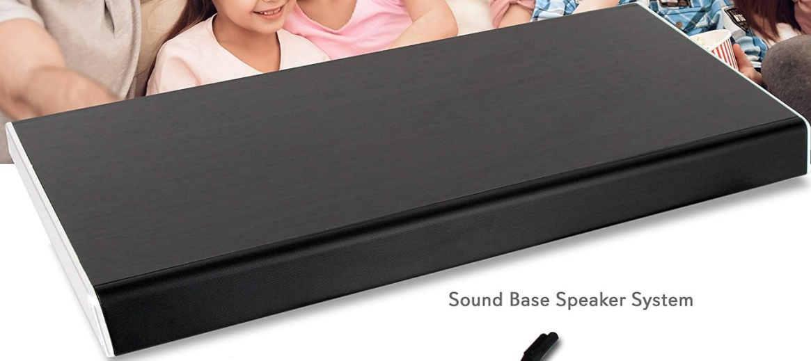
Sound Base Speaker System