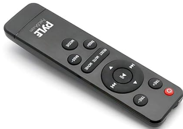
Remote Control *Batteries not included