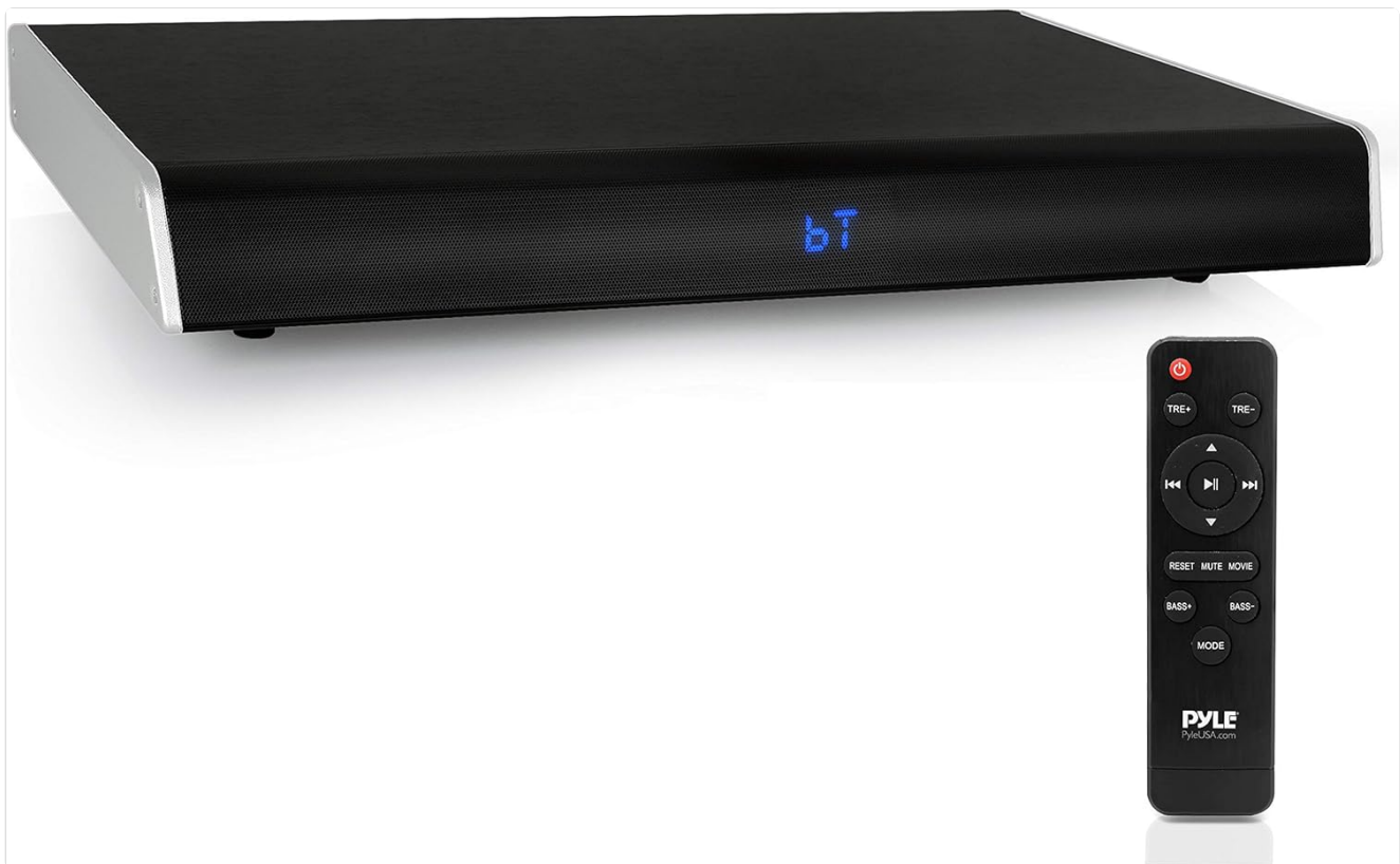
Image: The Pyle PSBV820BT Sound Base and its remote control for operation.