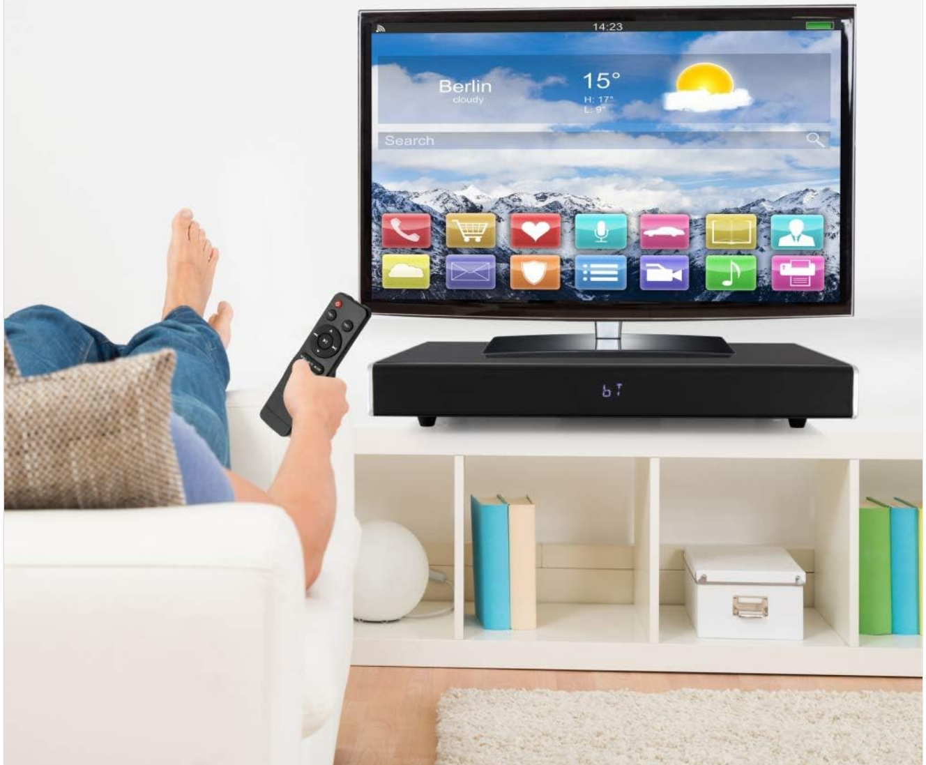
Image: The Pyle PSBV820BT Sound Base positioned under a television.

Place the sound base directly under your television. Its low-profile design allows the TV to sit on top of the sound base, saving space and integrating seamlessly with your entertainment setup.