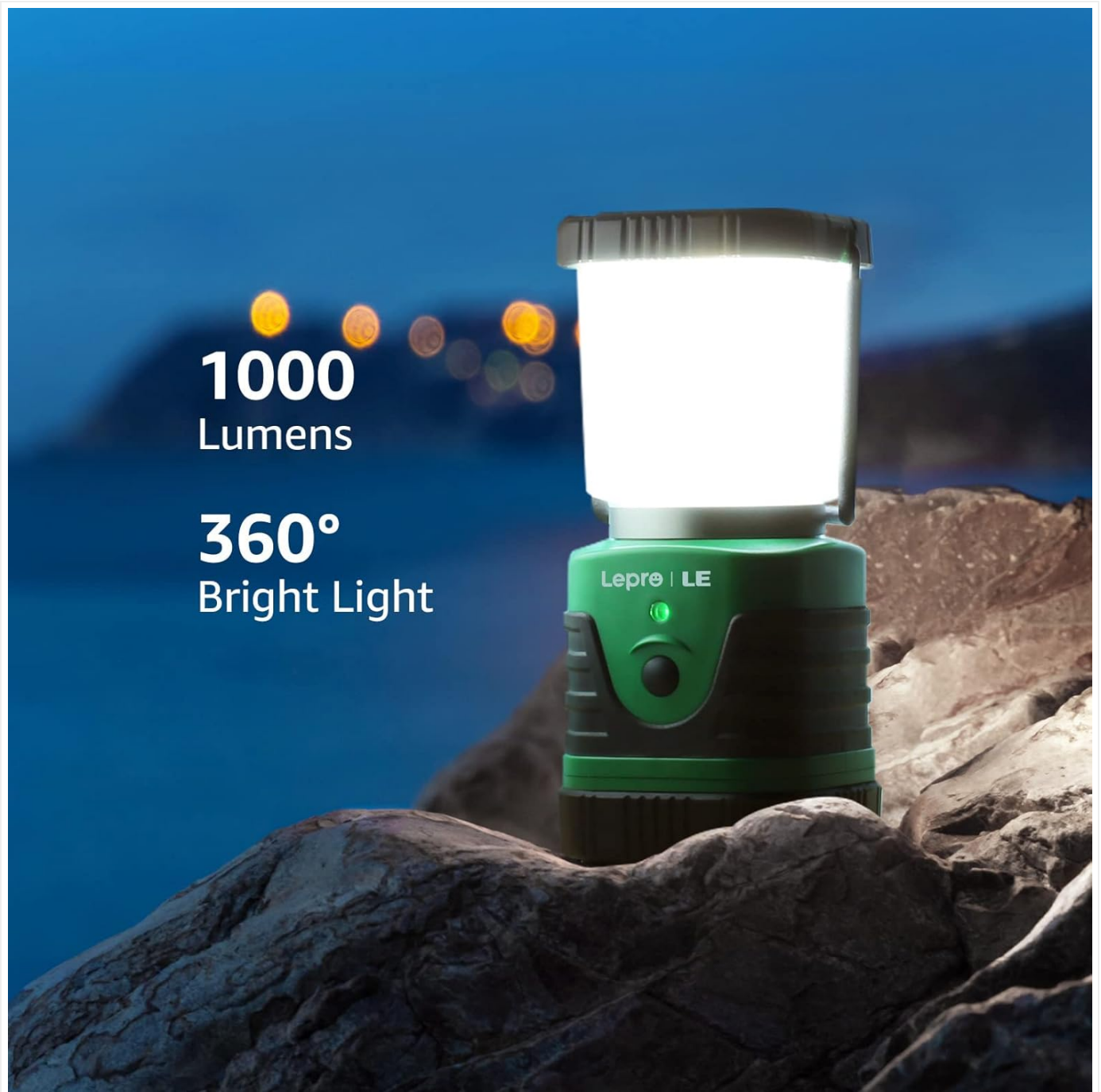
Figure 1.2: The lantern provides 1000 lumens of 360-degree bright light, illuminating a wide area.