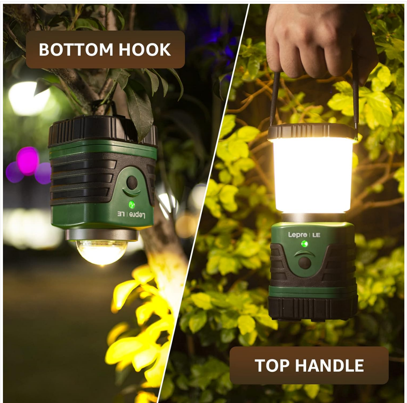
Figure 3.2: The lantern features a versatile top handle and a bottom hook for various hanging options.