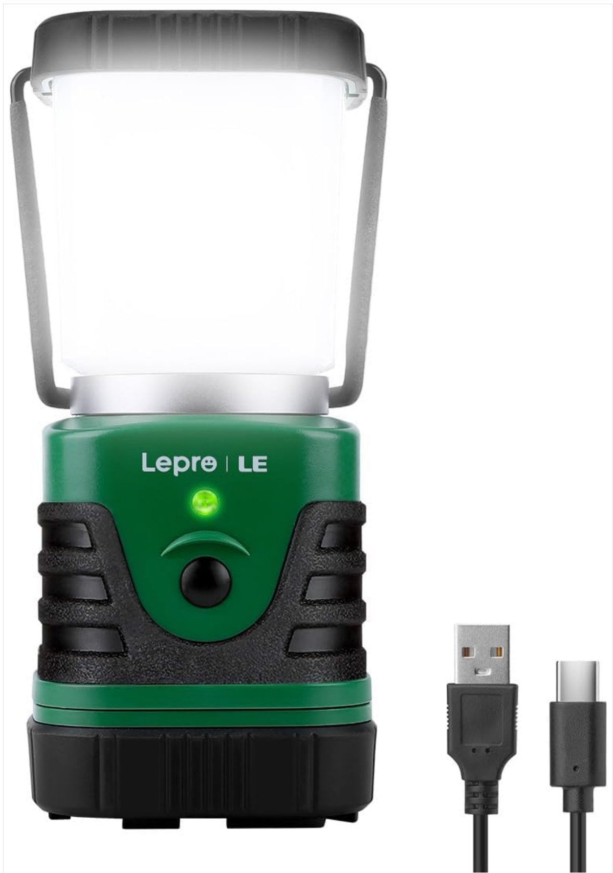
Figure 1.1: The Lepre 1000LM LED Camping Lantern, showcasing its compact design and included USB charging cable.