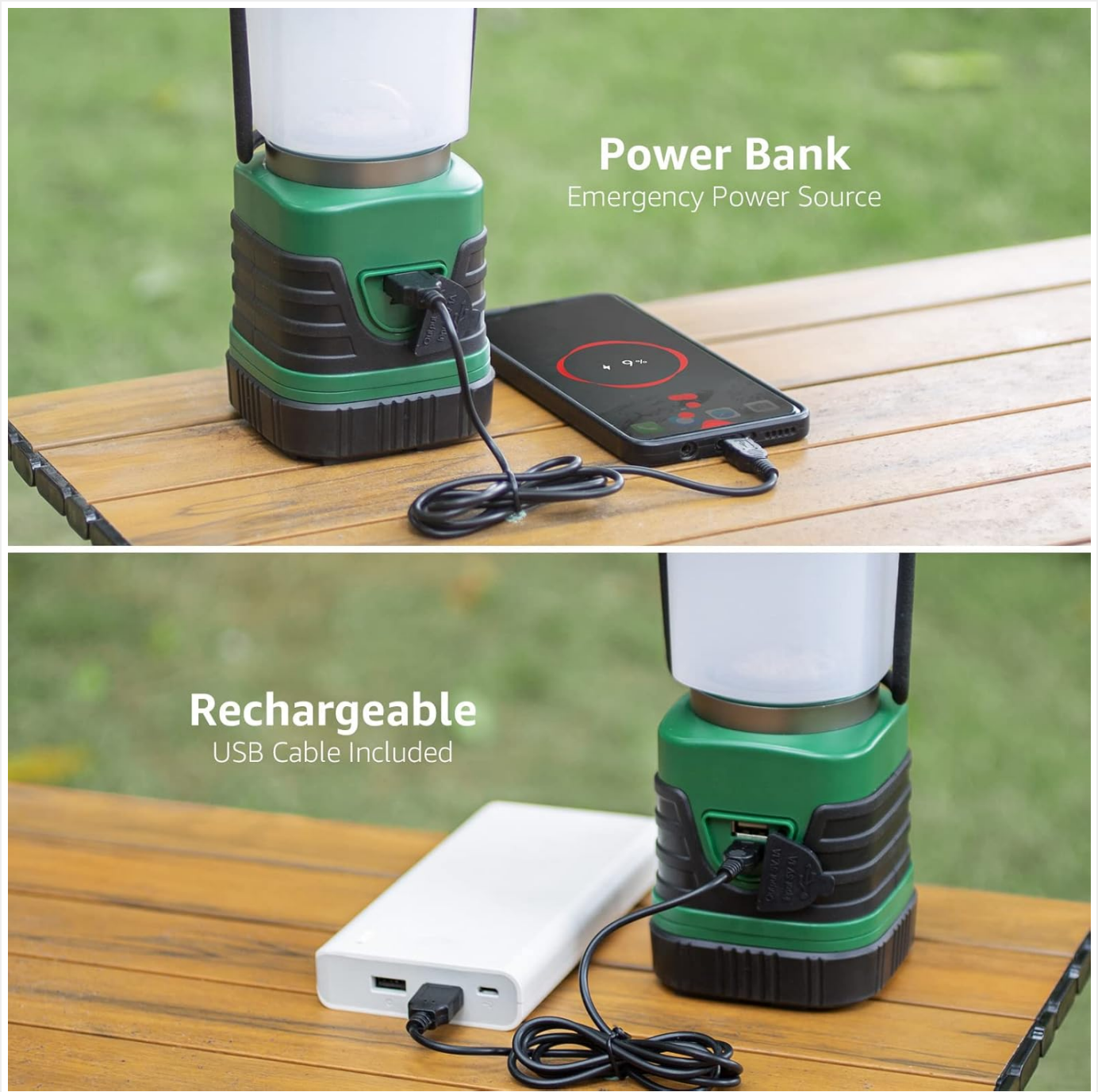
Figure 2.1: The lantern can be recharged via USB and also functions as a power bank.

Note: Do not use charger adapters over 5V voltage. The lantern can be used while charging, but it may extend the charging time. Avoid using the lantern as a power bank while it is simultaneously charging.