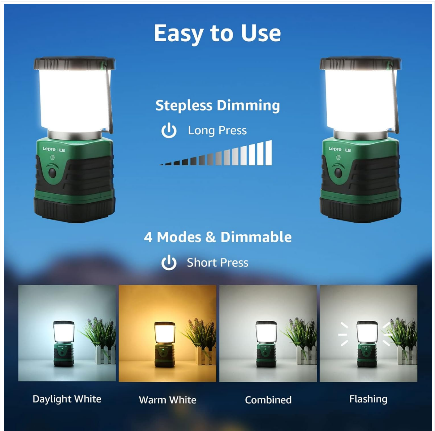
Figure 3.1: Control the light modes with a short press and adjust brightness with a long press.

2. Turn Off: After cycling through all modes, a short press will turn the lantern off.