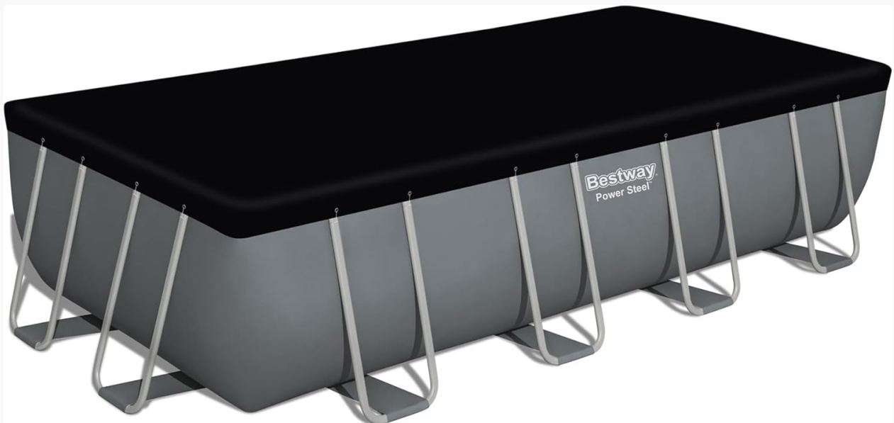
Figure 4: Bestway Power Steel pool with the included cover.