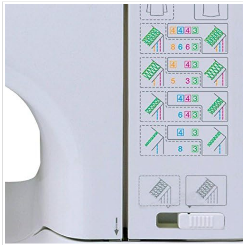
Figure 2: Stitch selection and tension dials, indicating various stitch types and settings.