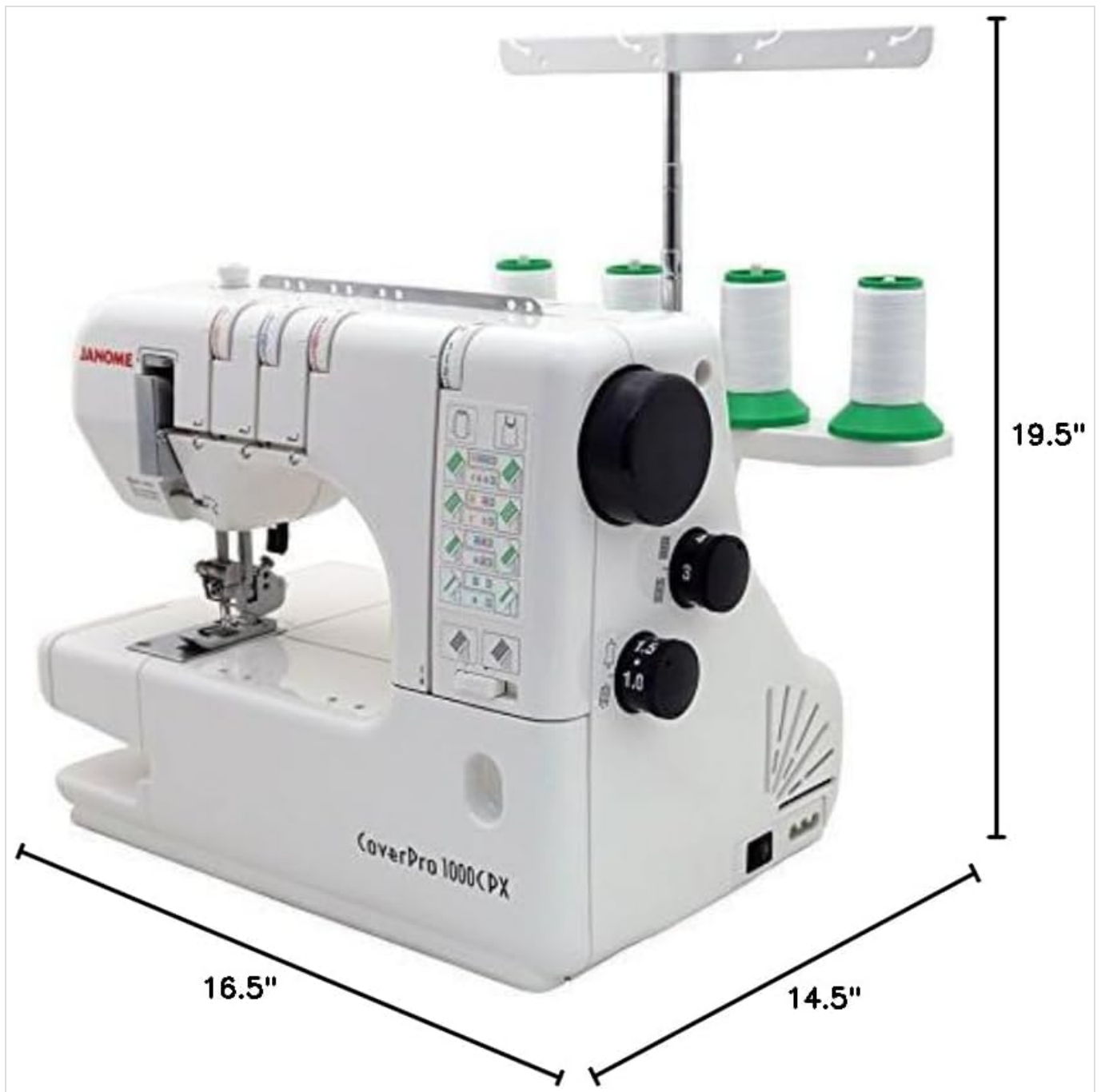
Figure 5: Product dimensions for the Janome Cover Pro 1000CPX.