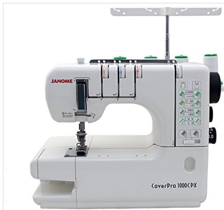
Figure 3: The Janome Cover Pro 1000CPX with its free arm, ideal for hemming small items.

To use the free arm, slide off the accessory tray. This feature is particularly useful for hemming small, tubular items like sleeves, pant legs, and necklines, allowing for easier manipulation of fabric.