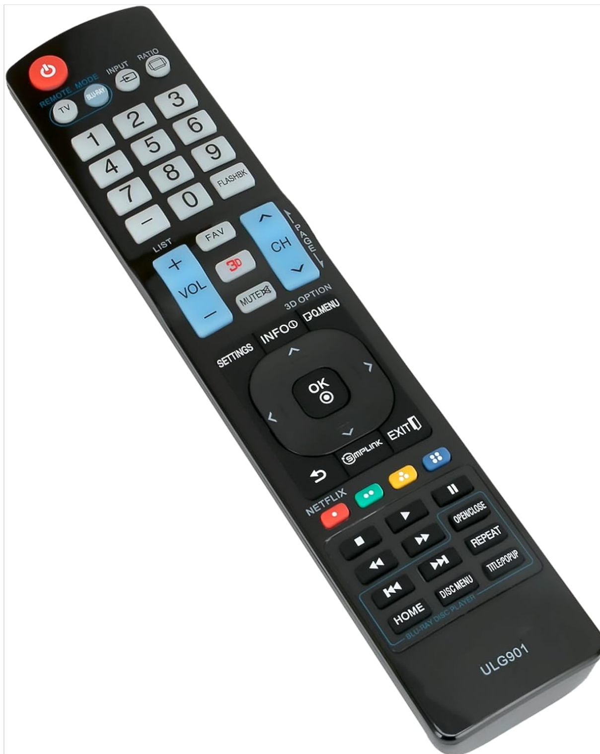
Image: Angled view of the VINABTY ULG901 remote control, showing its side profile and button layout.