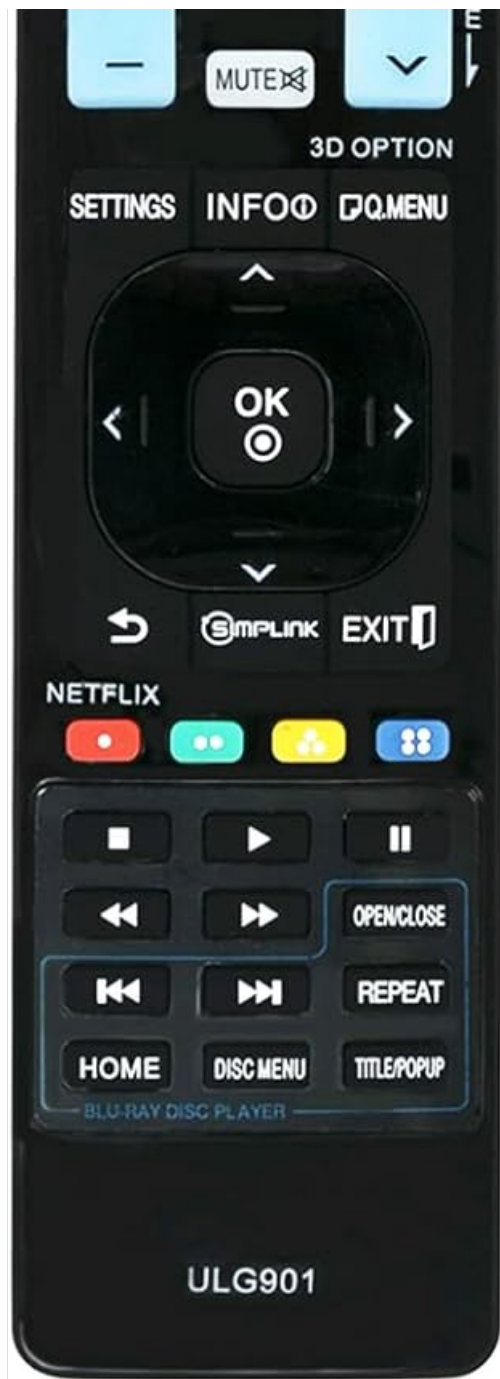
Image: Front view of the VINABTY ULG901 Universal Remote Control, showcasing all buttons and its ergonomic design.