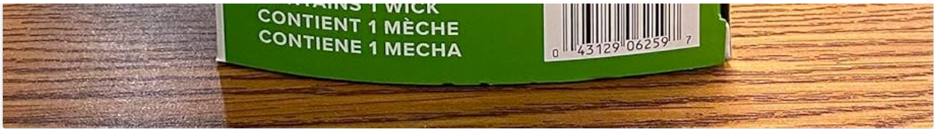
Image 2: Packaging of the AIRCARE 1043 Super Wick, listing compatible humidifier models such as 821000, 826000, 831000, 826800, and SS390DWHT. For a complete list of legacy models, visit aircareproducts.com/1043.html .