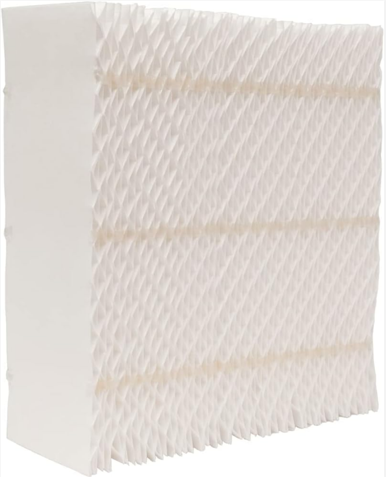
Image 1: The AIRCARE 1043 Replacement Space Saver Wick, showing its pleated design for increased surface area.