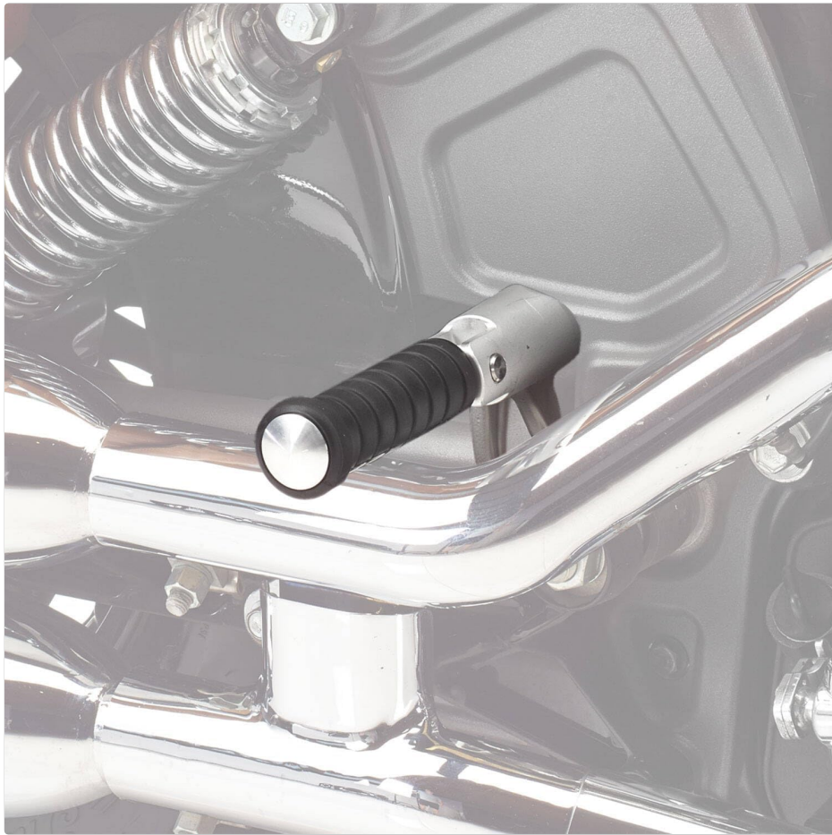
Figure 6.2: Close-up view of the passenger foot peg correctly installed on an Indian Scout motorcycle.