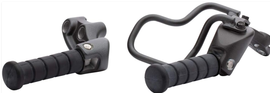
Figure 2.1: A pair of Indian Motorcycle Adjustable Passenger Foot Pegs, showcasing their design and grooved rubber grips.