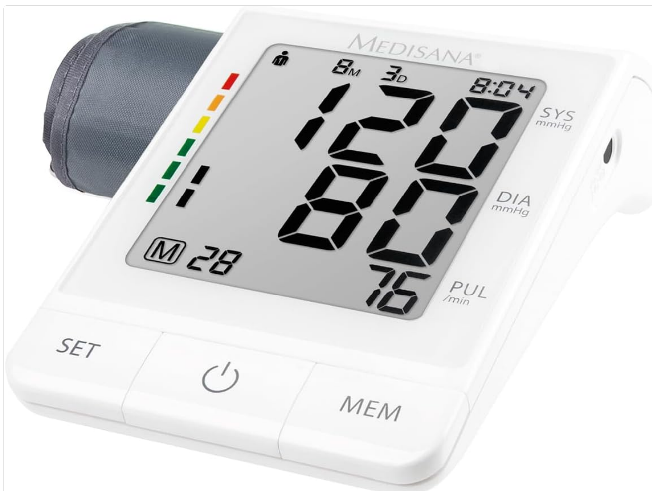
Image 1.1: The Medisana BU 530 Connect device with its upper arm cuff.

The Medisana BU 530 Connect is an advanced upper arm blood pressure monitor designed for accurate and convenient self-measurement of blood pressure and pulse. This device features a traffic light color scale for easy classification of results, detection of irregular heartbeats, and Bluetooth connectivity for data transfer to the VitaDock+ app. It is a certified medical device intended for personal health monitoring.