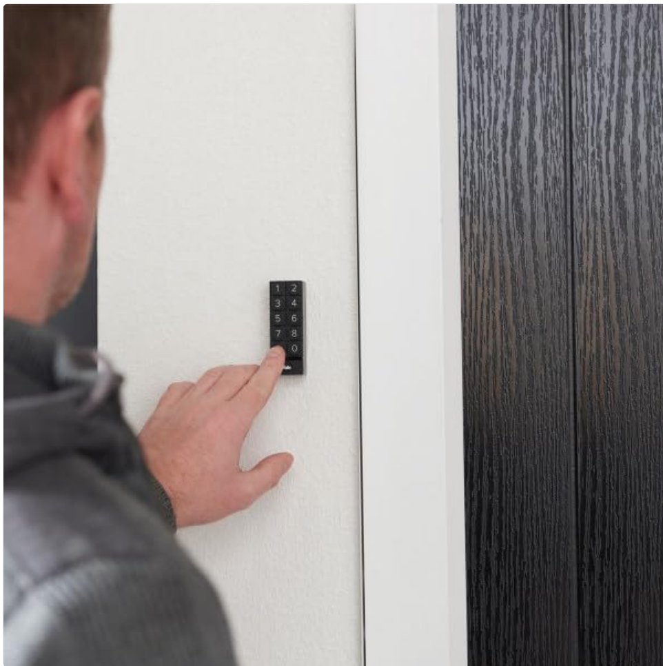
Image: A close-up of the August Smart Keypad with a hand entering a code for keyless entry.