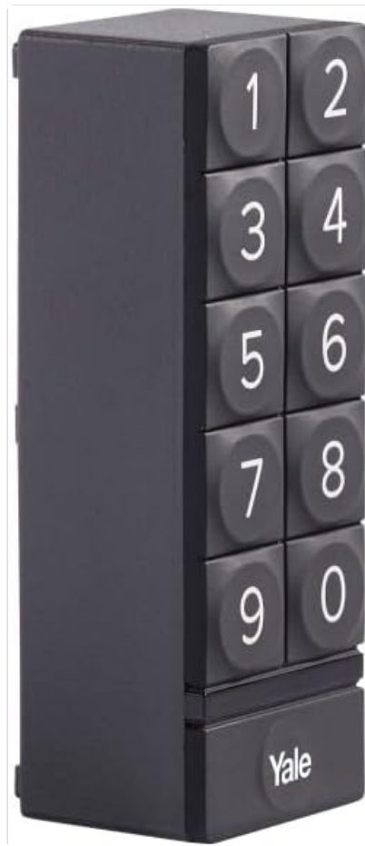
Image: Side view of the August Smart Keypad, illustrating its slim profile and potential battery compartment access.