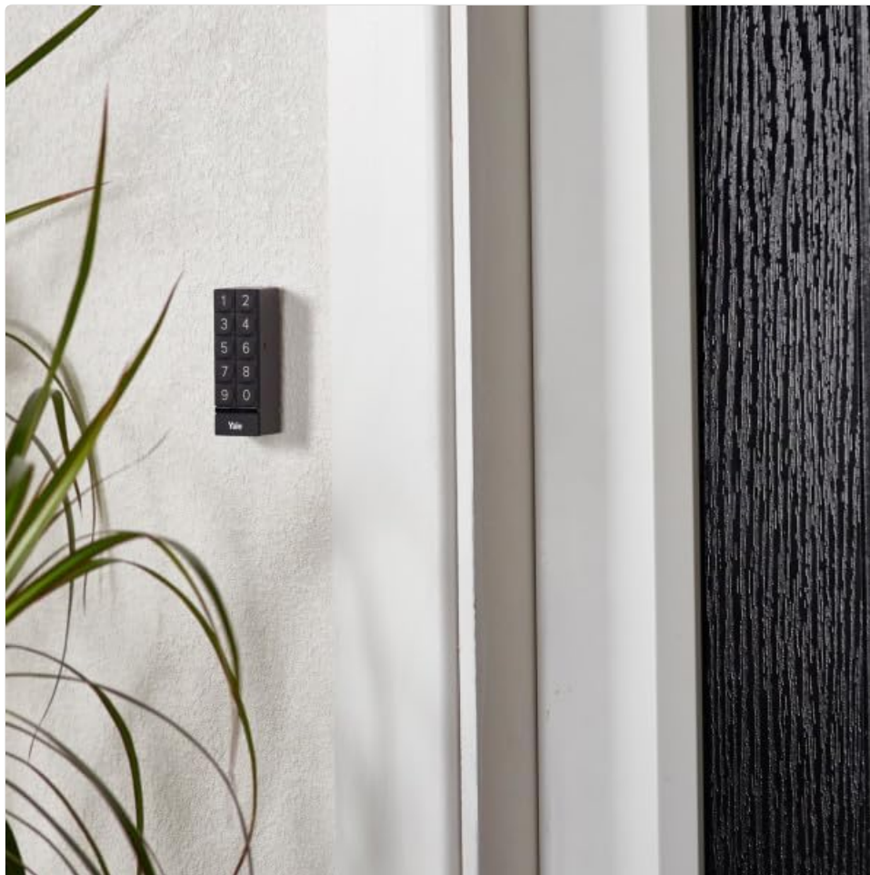
Image: August Smart Keypad mounted on a white wall next to a dark door frame.

The Smart Keypad can be mounted near your door using either the included screws and wall anchors or the double-sided tape. Ensure the mounting location is within 10 feet (approximately 3 meters) of your August Smart Lock for optimal Bluetooth connectivity.